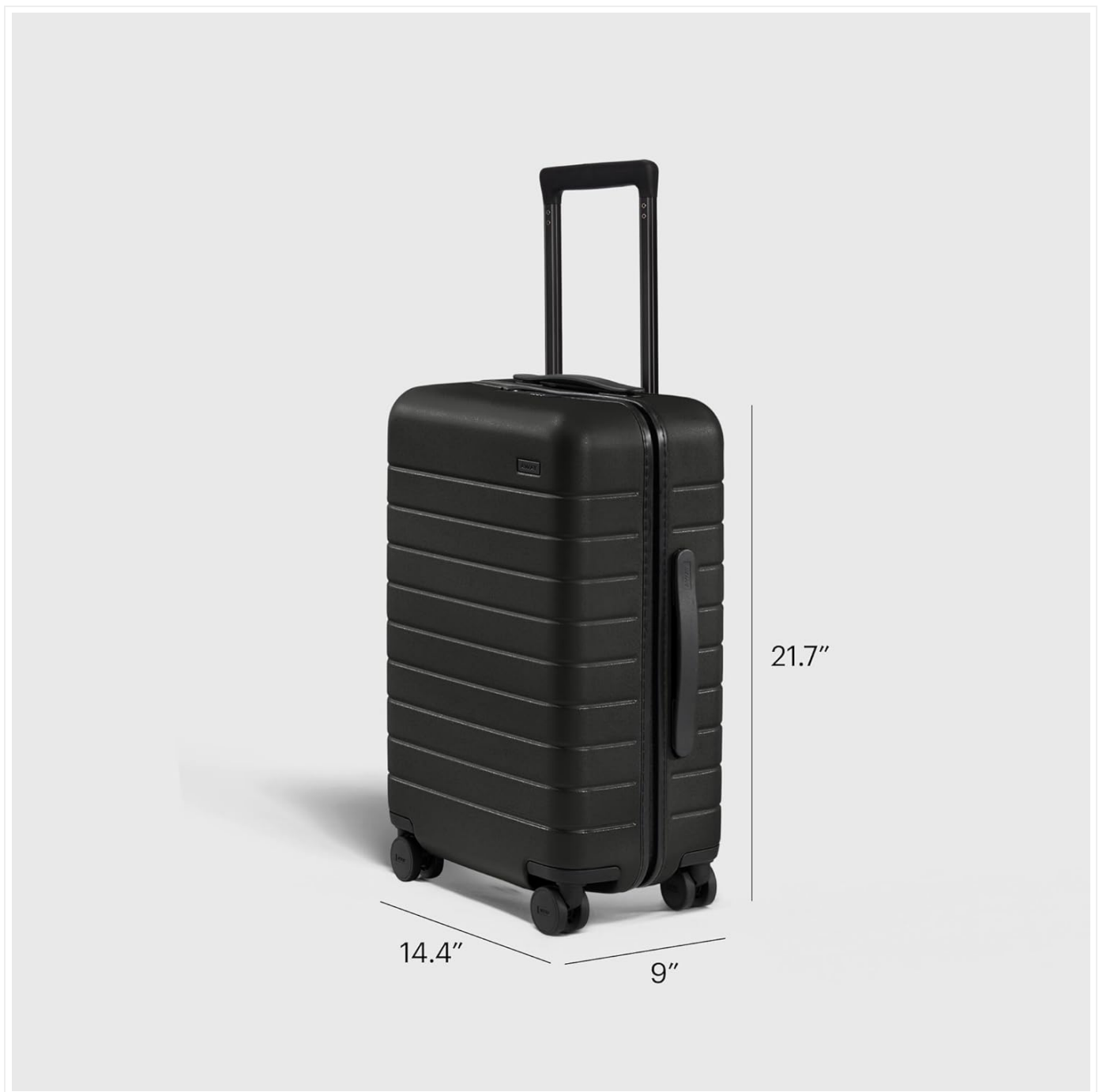
Image: Diagram illustrating the dimensions of the Away Carry-On Luggage (21.7" H x 14.4" W x 9" D).