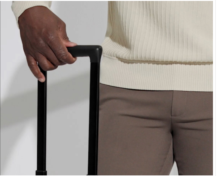
Image: A hand demonstrating the use of the underside grab handle for easy lifting of the luggage.

Stable, easy-grip trolley handle guarantees a smooth ride and better maneuverability. Made of high-grade aluminum, everything about our luggage is built to last.