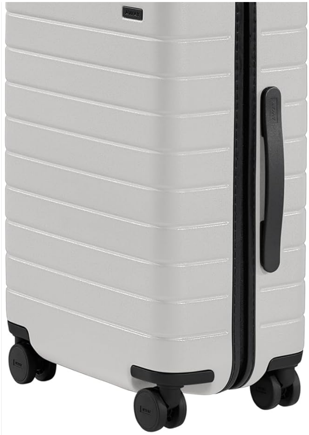
Image: Side view of the Away Carry-On Luggage in Cloud Gray, showcasing its hardside shell and extended telescopic handle.