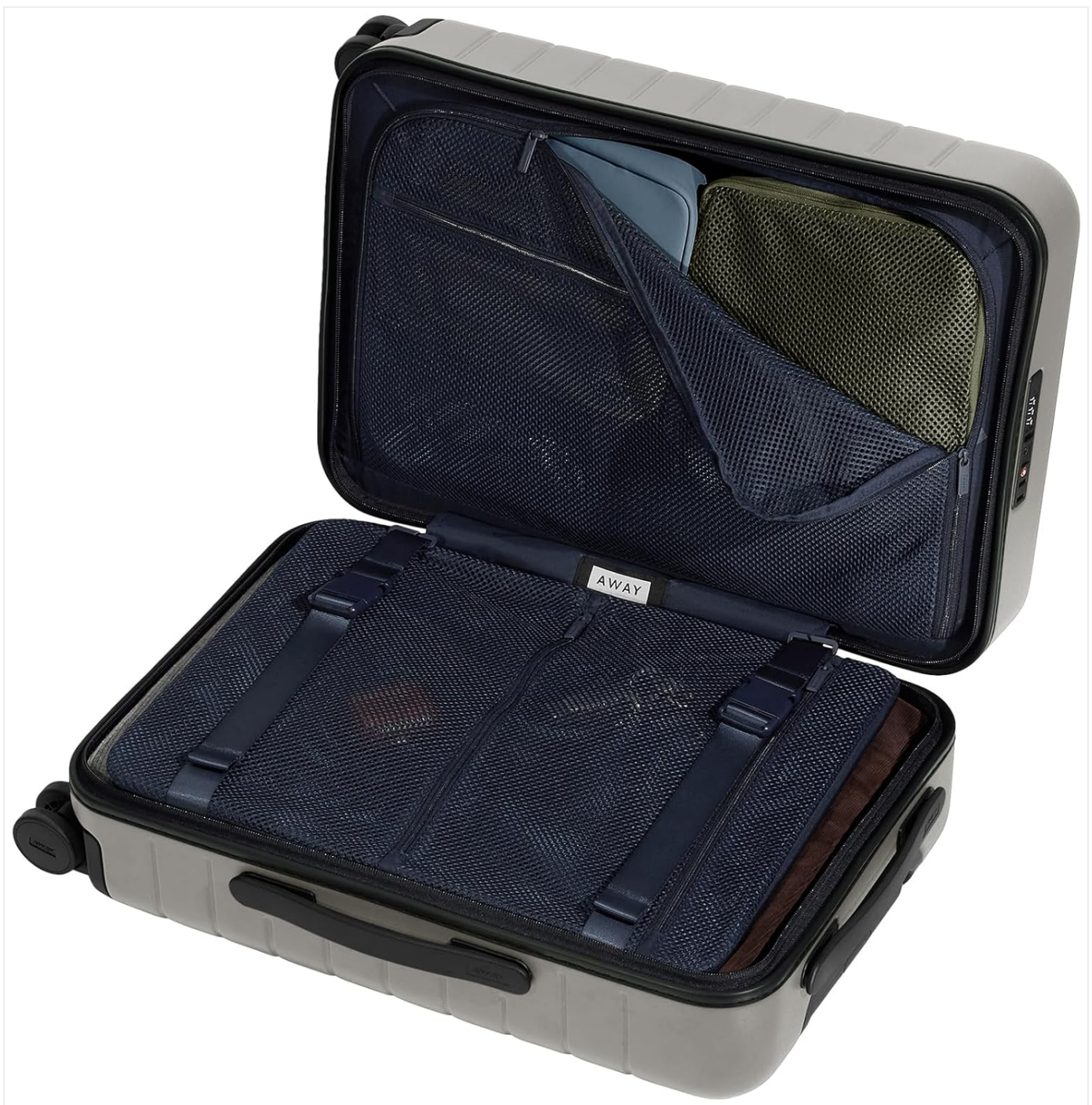
Image: Detailed view of the Away Carry-On, showing the patented compression pad system and zippered mesh pockets for organized packing.