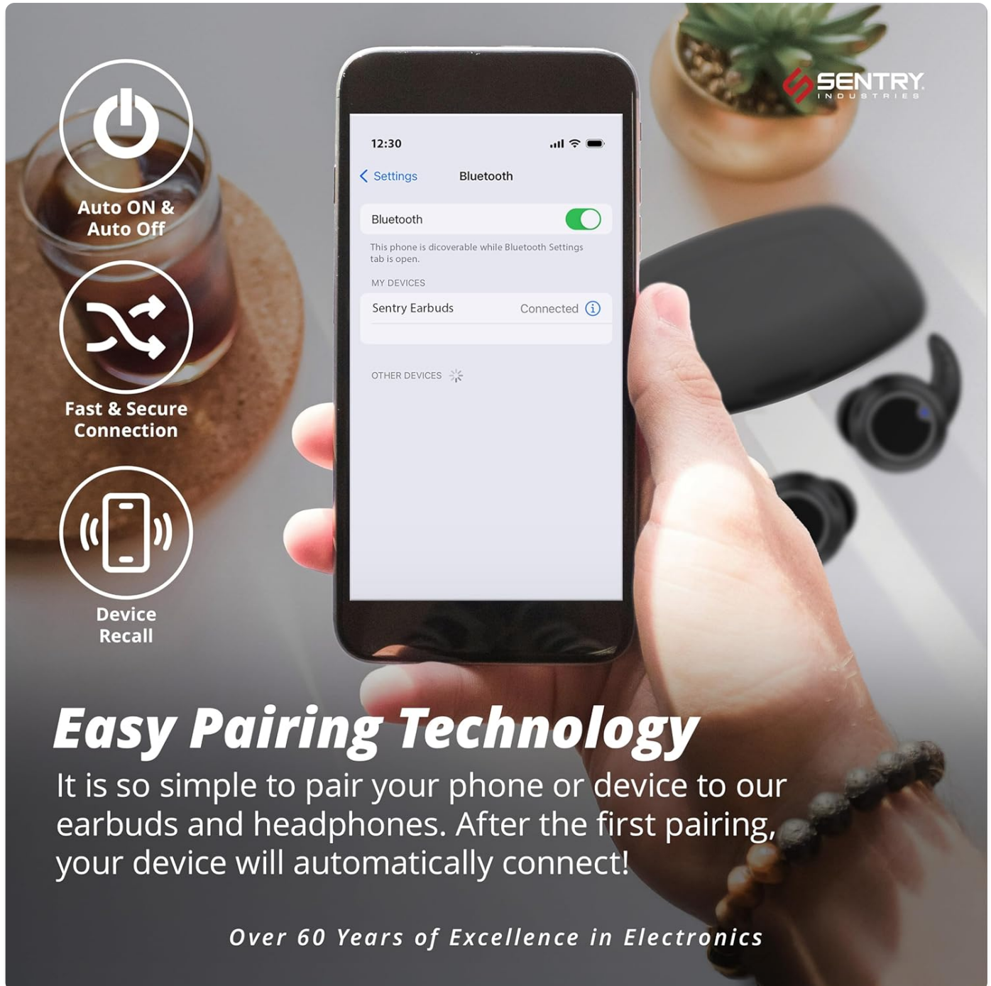
Image: A smartphone displaying its Bluetooth settings, showing "Sentry Earbuds" as a connected device, illustrating the easy pairing process.