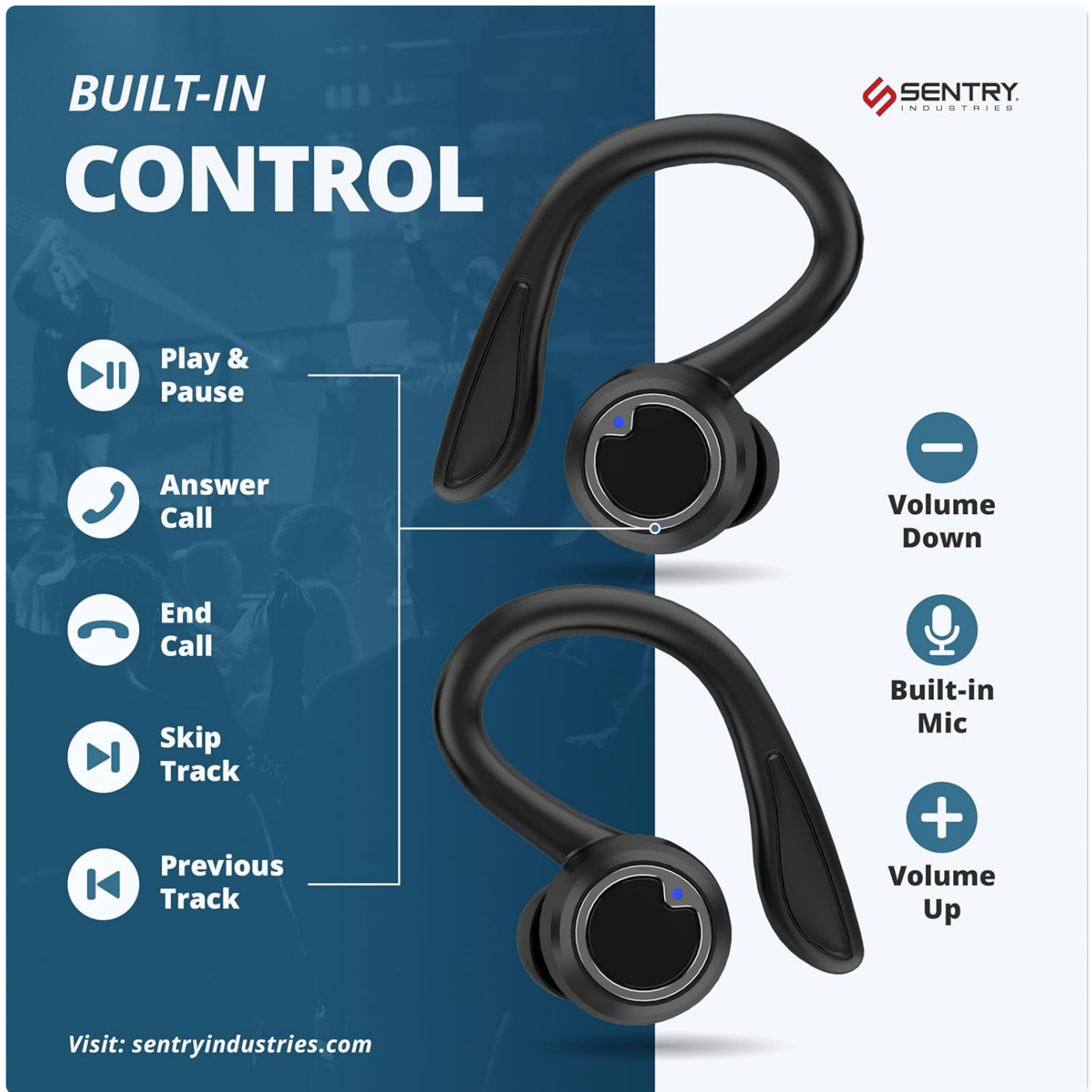
Image: A detailed diagram illustrating the button controls on the earbuds, including functions for Play & Pause, Answer Call, End Call, Skip Track, Previous Track, Volume Down, Built-in Mic, and Volume Up.

The earbuds are equipped with multi-function buttons. Refer to the diagram below for specific functions: