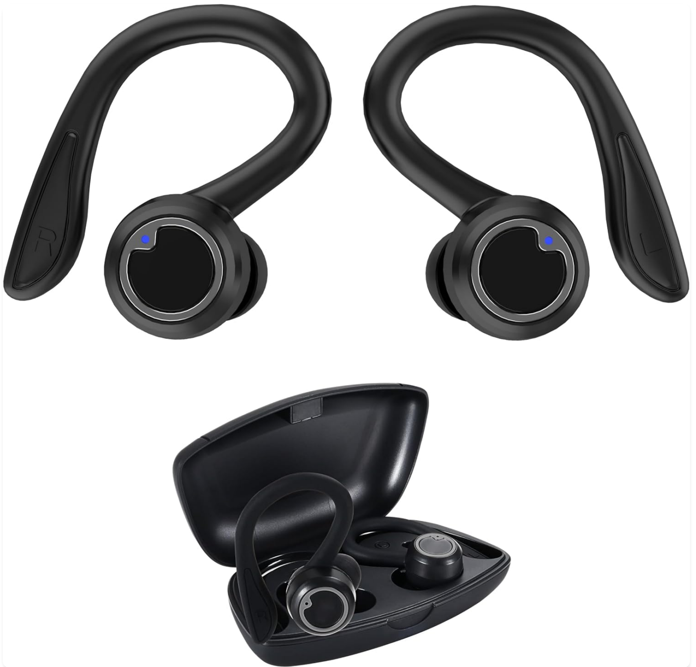
Image: SENTRY OSE Sport Hook Bluetooth Wireless Earbuds with their charging case, showcasing the sleek black design and the ear hooks.