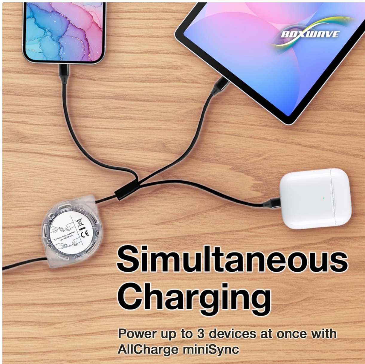
Image 4.1: Illustrates the capability of the AllCharge miniSync cable to charge multiple devices, such as a smartphone, tablet, and earbuds, at the same time.