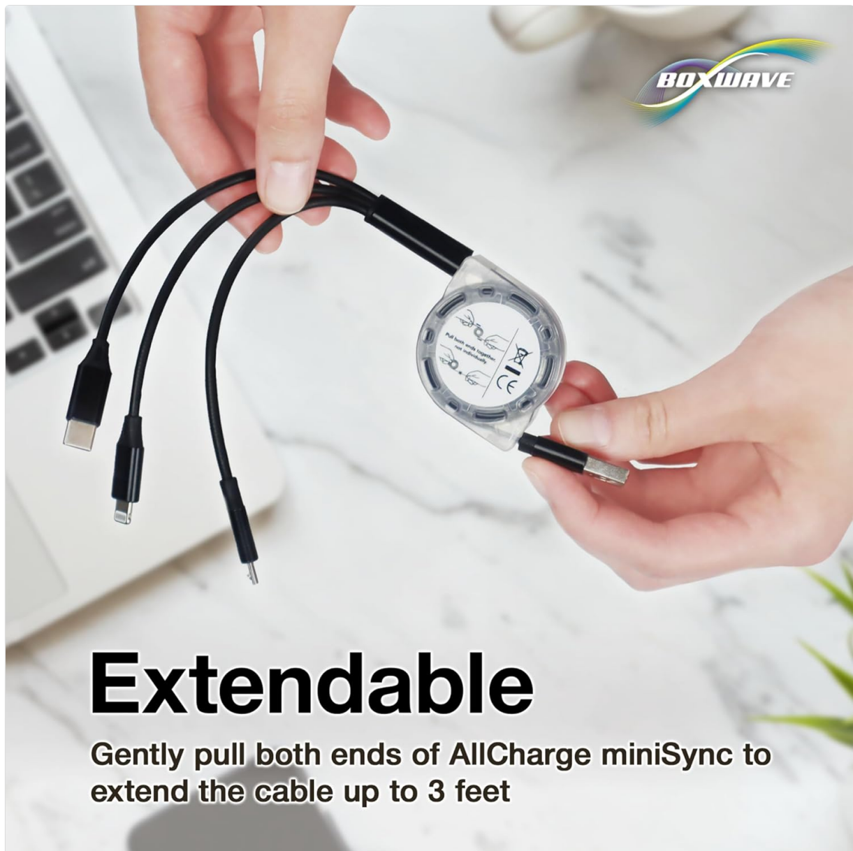
Image 3.1: Demonstrates the proper method for extending the cable by gently pulling both ends simultaneously.