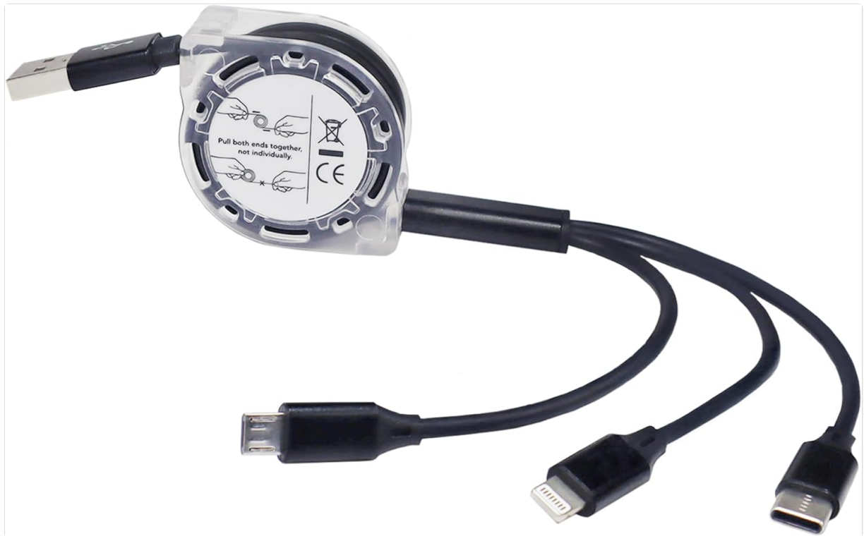
Image 2.1: The AllCharge miniSync cable in its fully retracted, compact state, highlighting its portability and tangle-free design.