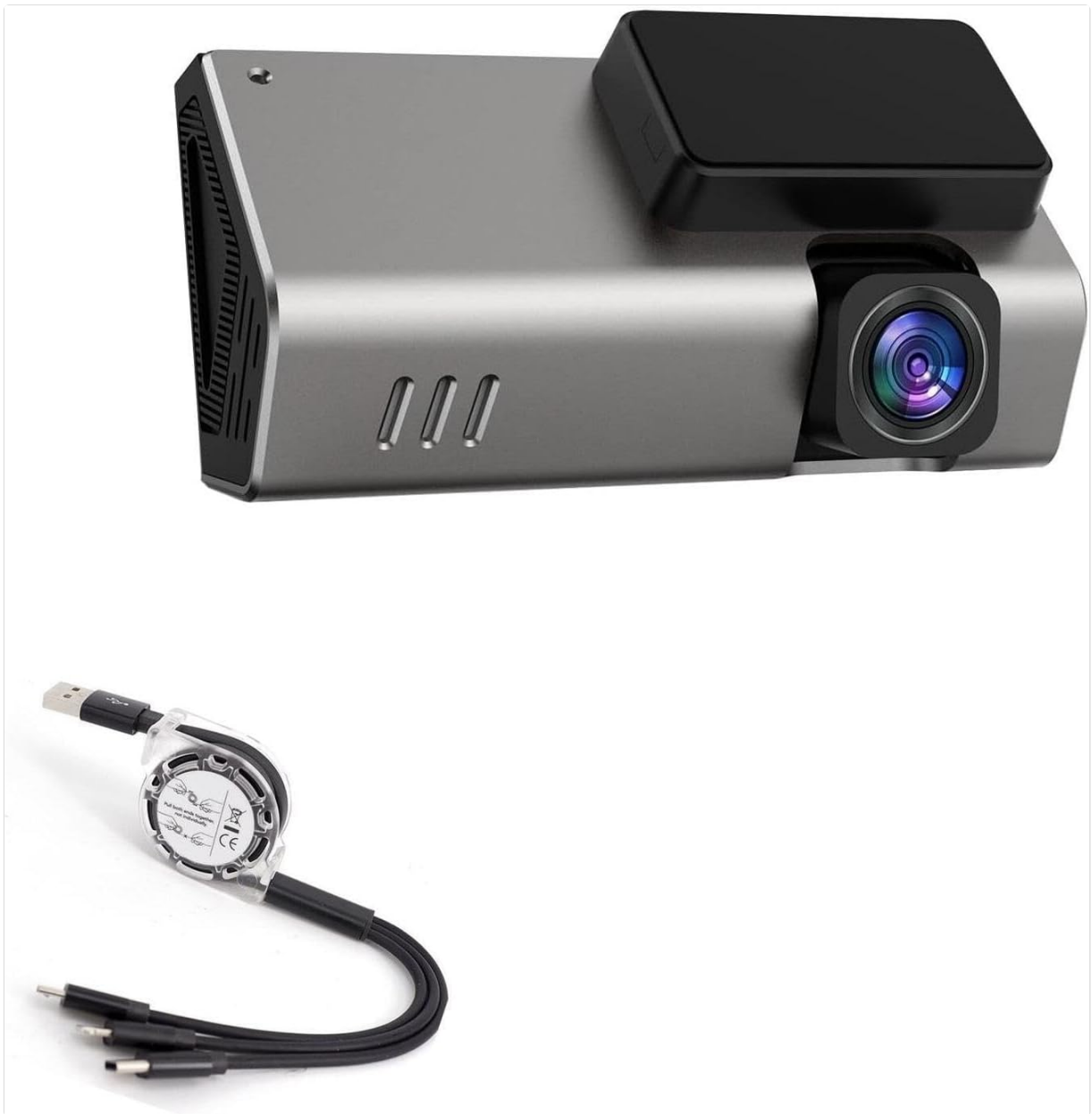
Image 1.1: The BoxWave AllCharge miniSync Retractable Portable USB Cable. This cable features a compact, retractable design for easy storage and multiple connectors for versatile charging and syncing.