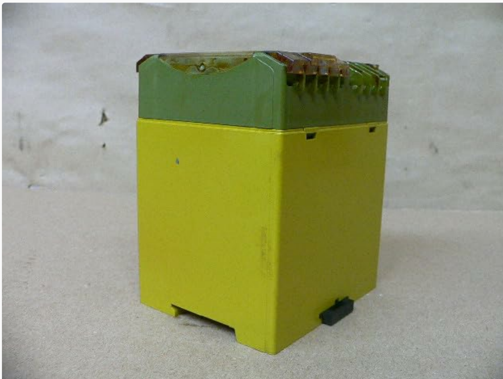
Figure 3.2: Side View

This image displays the front of the P2hz5 safety relay, highlighting the terminal connections (A1, A2, 11, 12, 23, 24, etc.) and the integrated wiring schematic. The schematic illustrates the internal logic and contact configuration, including inputs for push buttons (T1, T2) and outputs (K1, K2). The Pilz branding and model number P2HZ 5 are clearly visible.