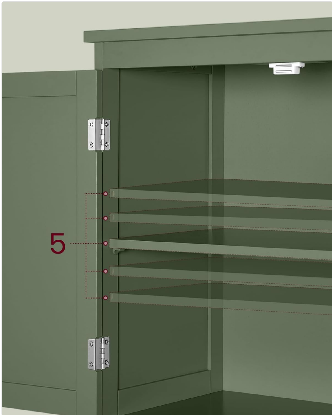
Image 5.2: Detail of the adjustable shelf system, highlighting the five available height settings.