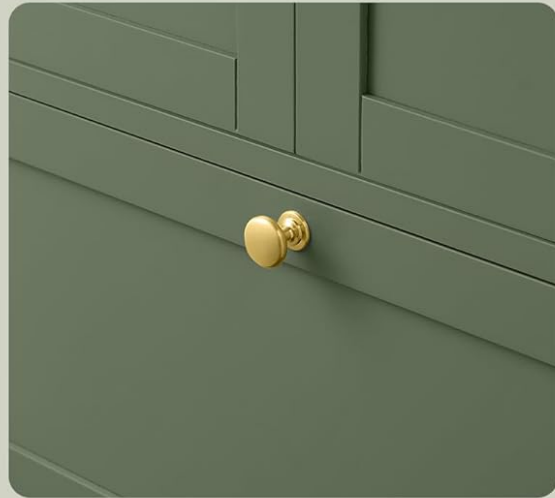
Image 5.3: The two lower drawers, showcasing their smooth operation and storage potential for smaller items.