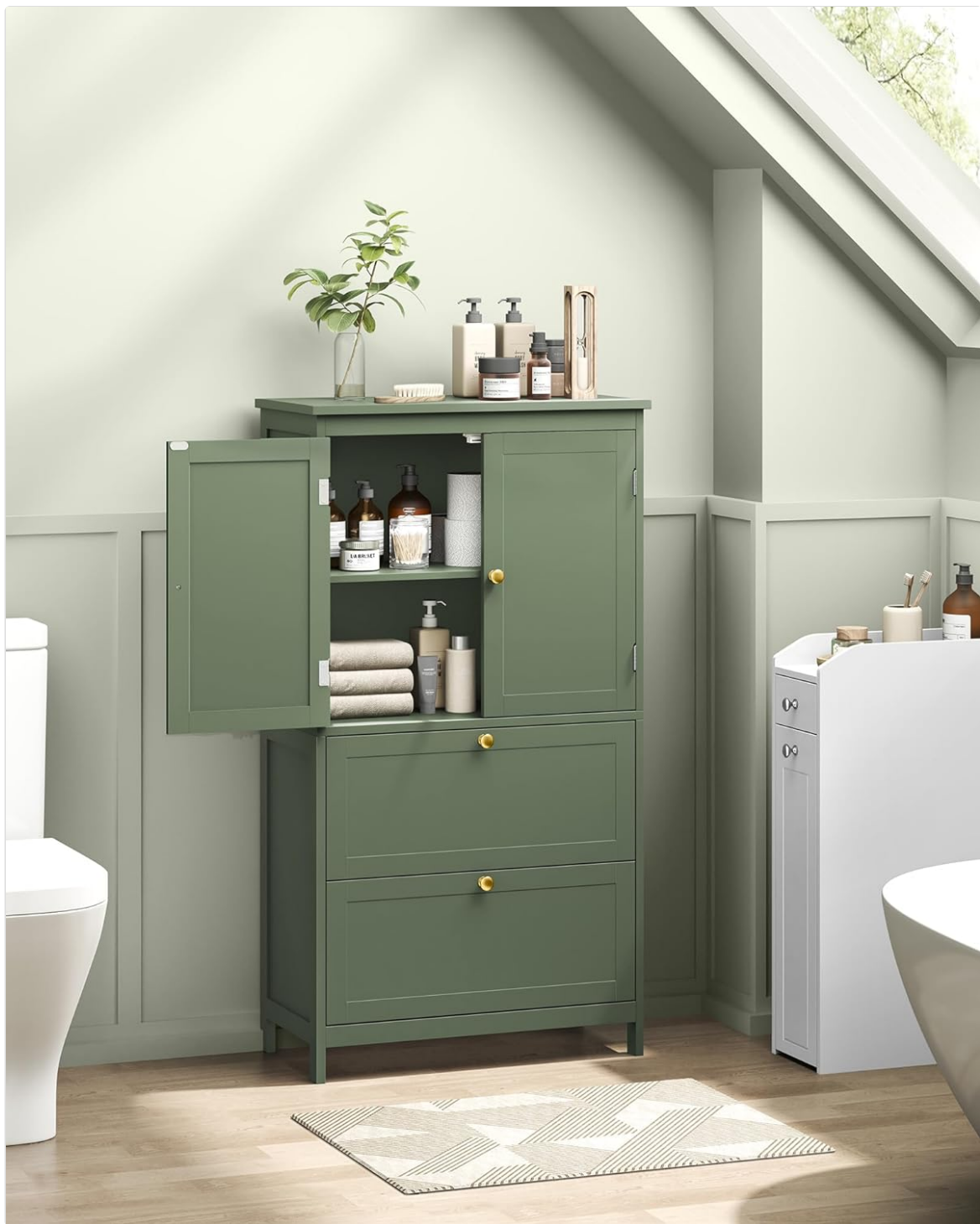
Image 5.1: The cabinet with its doors open, demonstrating its storage capacity for various bathroom essentials.