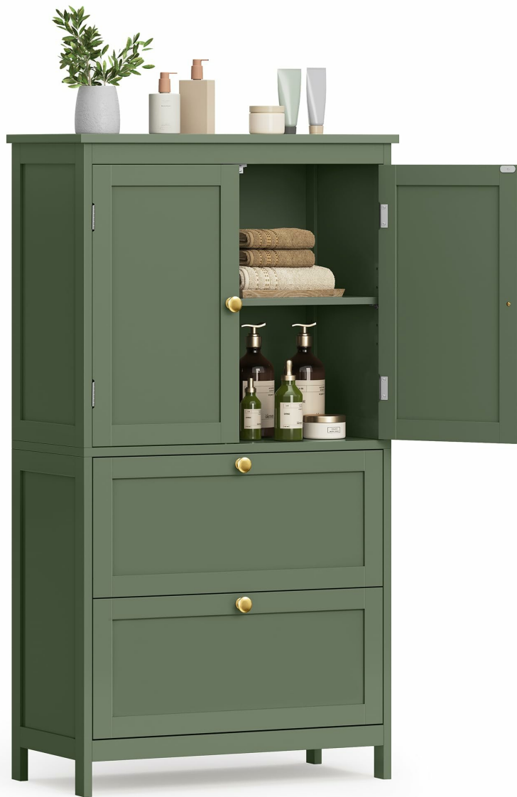
Image 1.1: The VASAGLE BBC551C01V1 Bathroom Cabinet, featuring its two-door upper compartment and two lower drawers, providing ample storage.