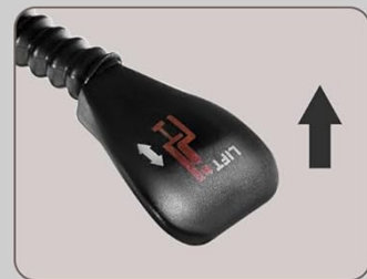
Image 6: Illustration demonstrating the adjustable seat height feature, showing how to raise the chair.