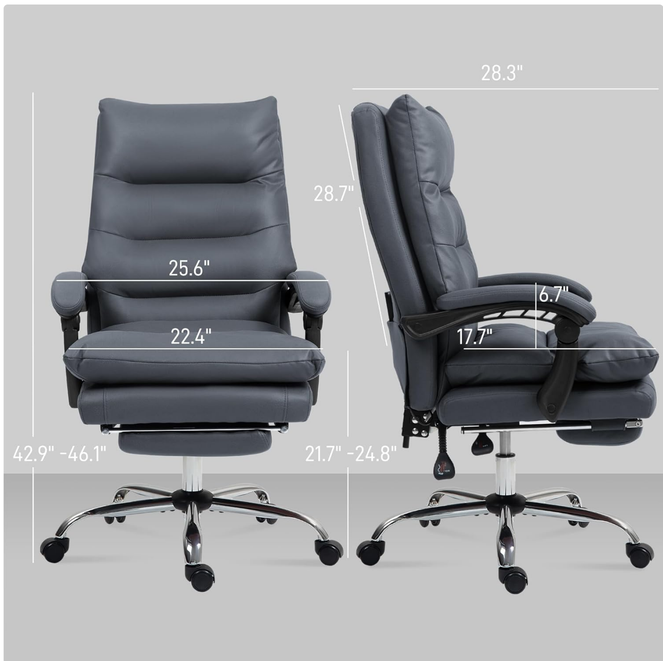
Image 7: Detailed dimensional drawing of the chair, providing measurements for various parts.