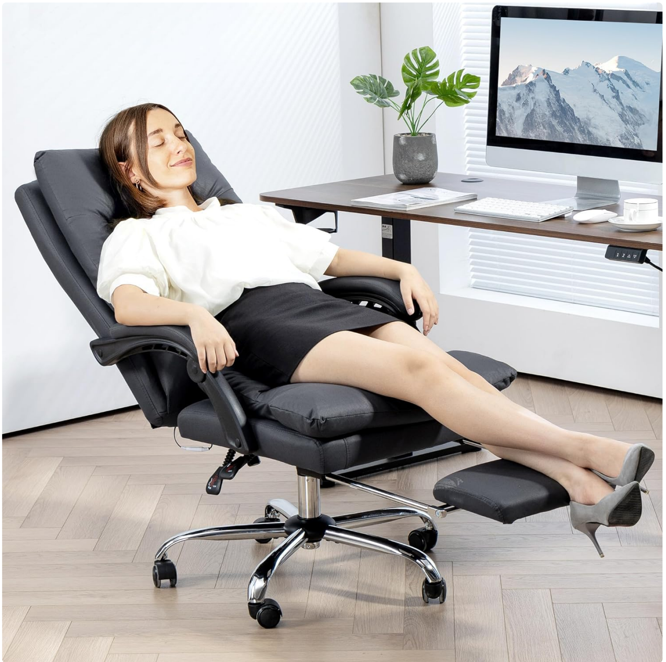
Image 1: The Vinsetto Executive Massage Office Chair in a reclined position with the footrest extended, demonstrating its relaxation capabilities.