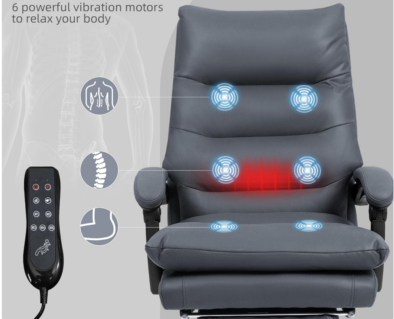
Image 3: Illustration of the chair's ergonomic design, highlighting the placement of the six vibration motors and the remote control for massage and heating functions.

6 powerful vibration motors to relax your body