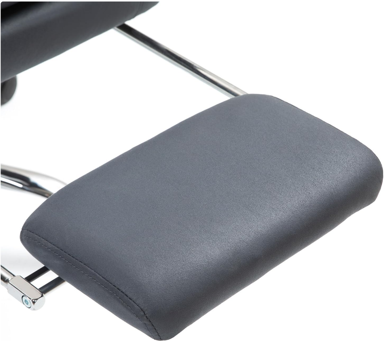
Image 5: A detailed image of the chair's retractable footrest in its extended position.