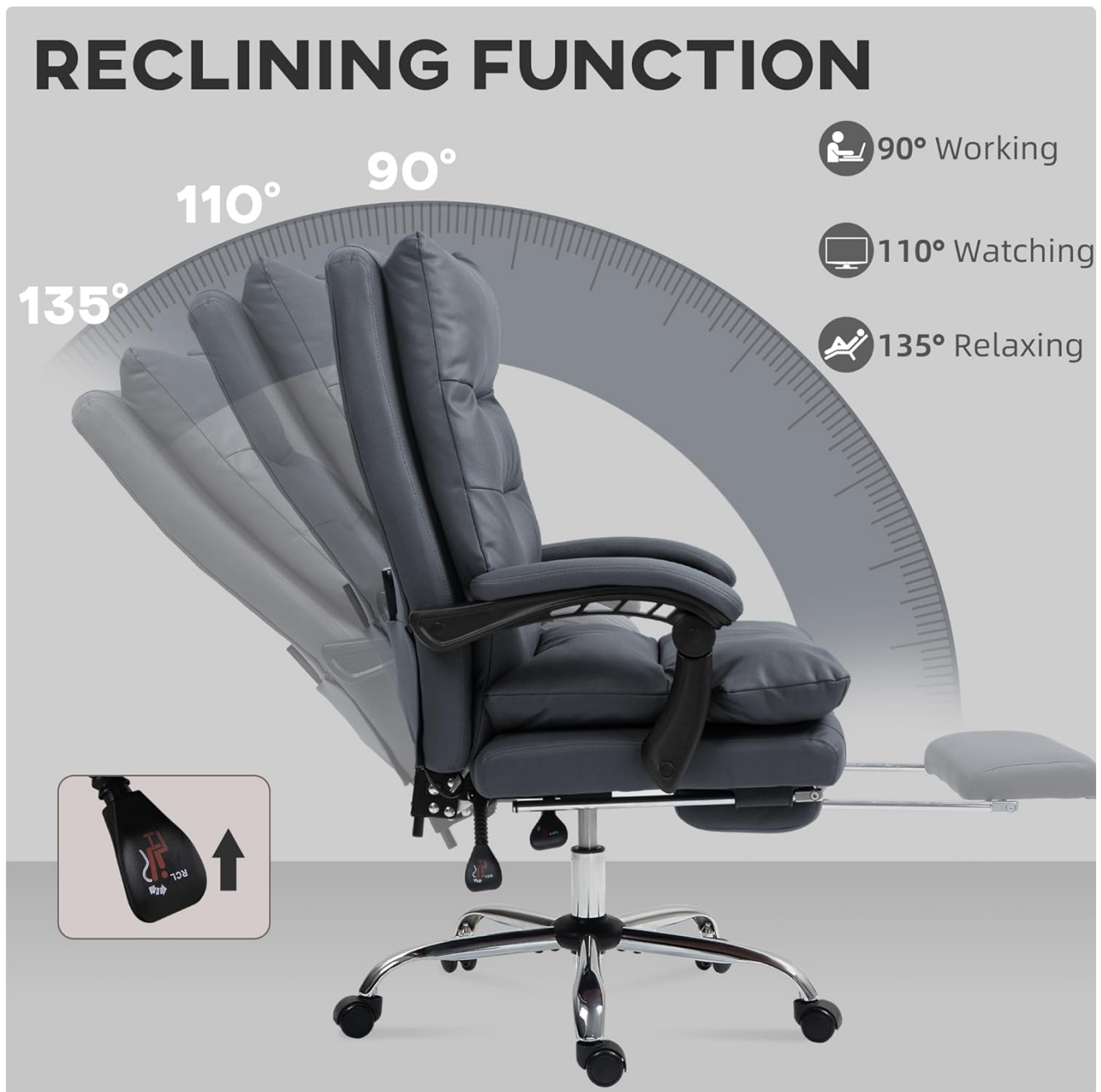
Image 4: Visual representation of the chair's reclining capabilities, showing various angles suitable for working, watching, and relaxing.