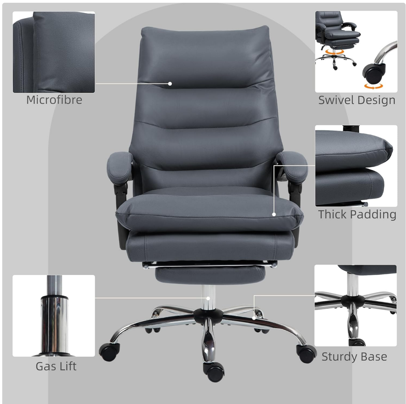
Image 2: Close-up details of the chair's construction, including the microfibre fabric, swivel mechanism, thick padding, gas lift, and sturdy base.