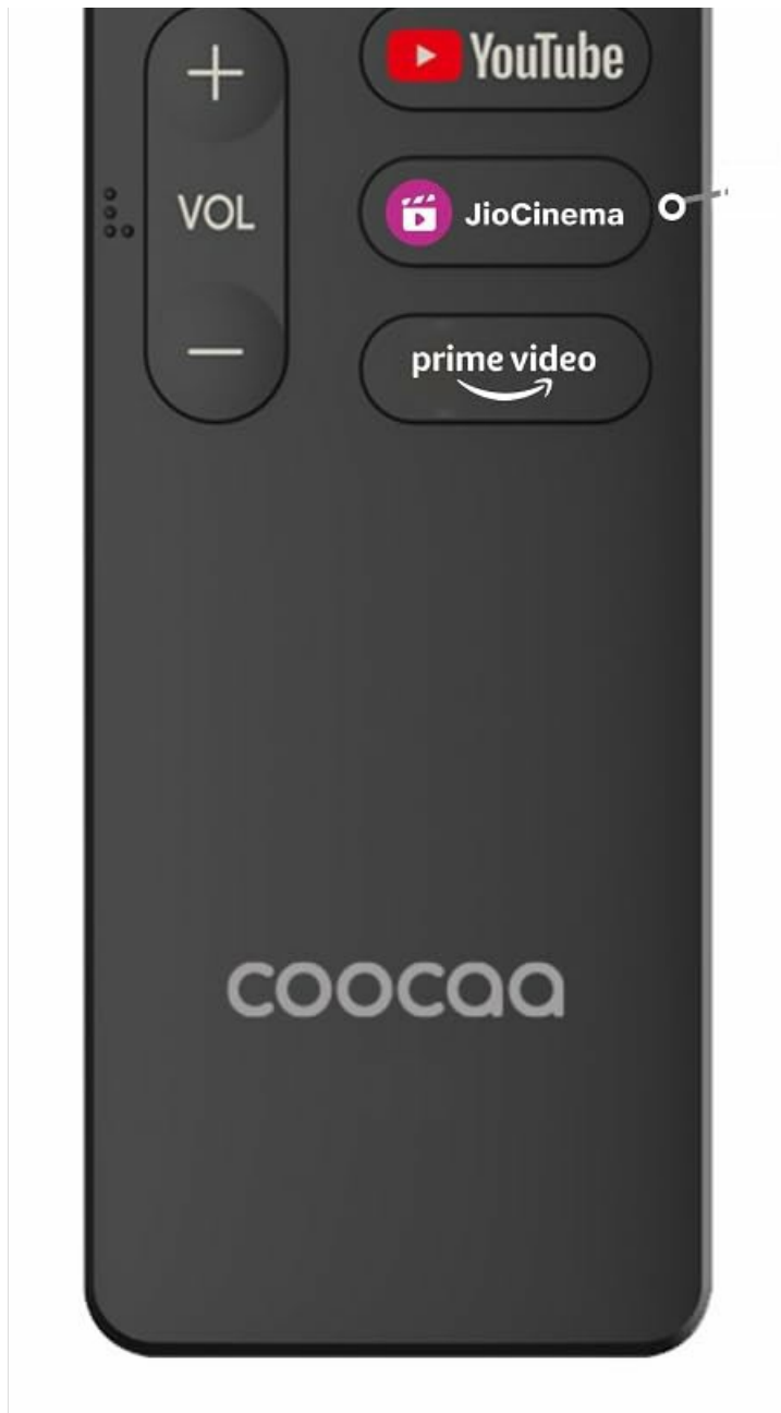
Figure 1: Overview of the SANDY Remote Control.