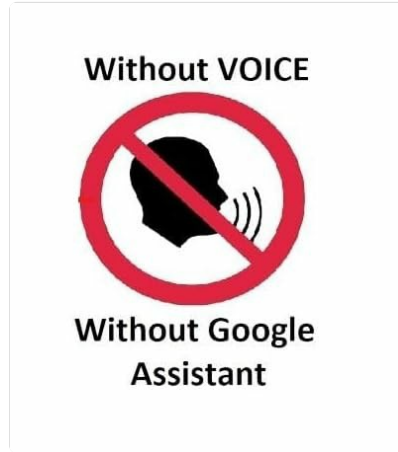
Figure 3: This remote control does not include voice control or Google Assistant features.