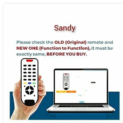
Figure 2: Visual guide for comparing your original remote with the SANDY remote to ensure compatibility. Both remotes must have the

This remote control is compatible with various Coocaa Smart LED TV models, specifically tested for the Coocaa 43S3U Plus. To ensure proper functionality, it is crucial that your original TV remote control is functionally identical to the SANDY remote control shown in this manual. This remote does not support voice commands or Google Assistant functionality.