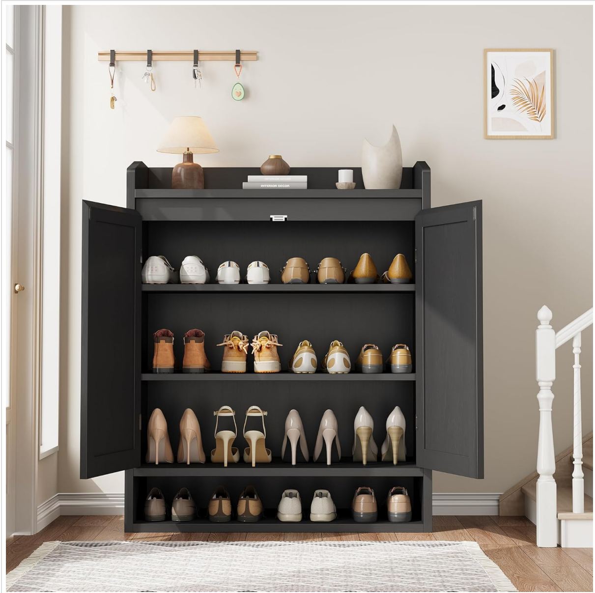
Image 4.1: The shoe cabinet with its doors open, revealing multiple shelves neatly organized with various types of footwear.