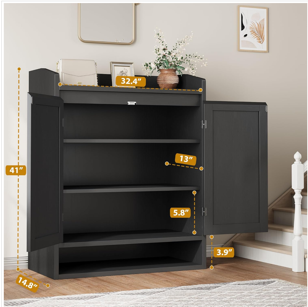
Image 3.1: Dimensional diagram of the GarveeHome Rattan Shoe Cabinet, indicating its height, width, and depth for planning placement.

After assembling the cabinet, it is crucial to install the anti-tip device. Refer to Image 2.1 for a visual guide. Secure the device to the back of the cabinet and firmly attach it to a wall stud using appropriate hardware. This step significantly enhances the stability and safety of the cabinet.