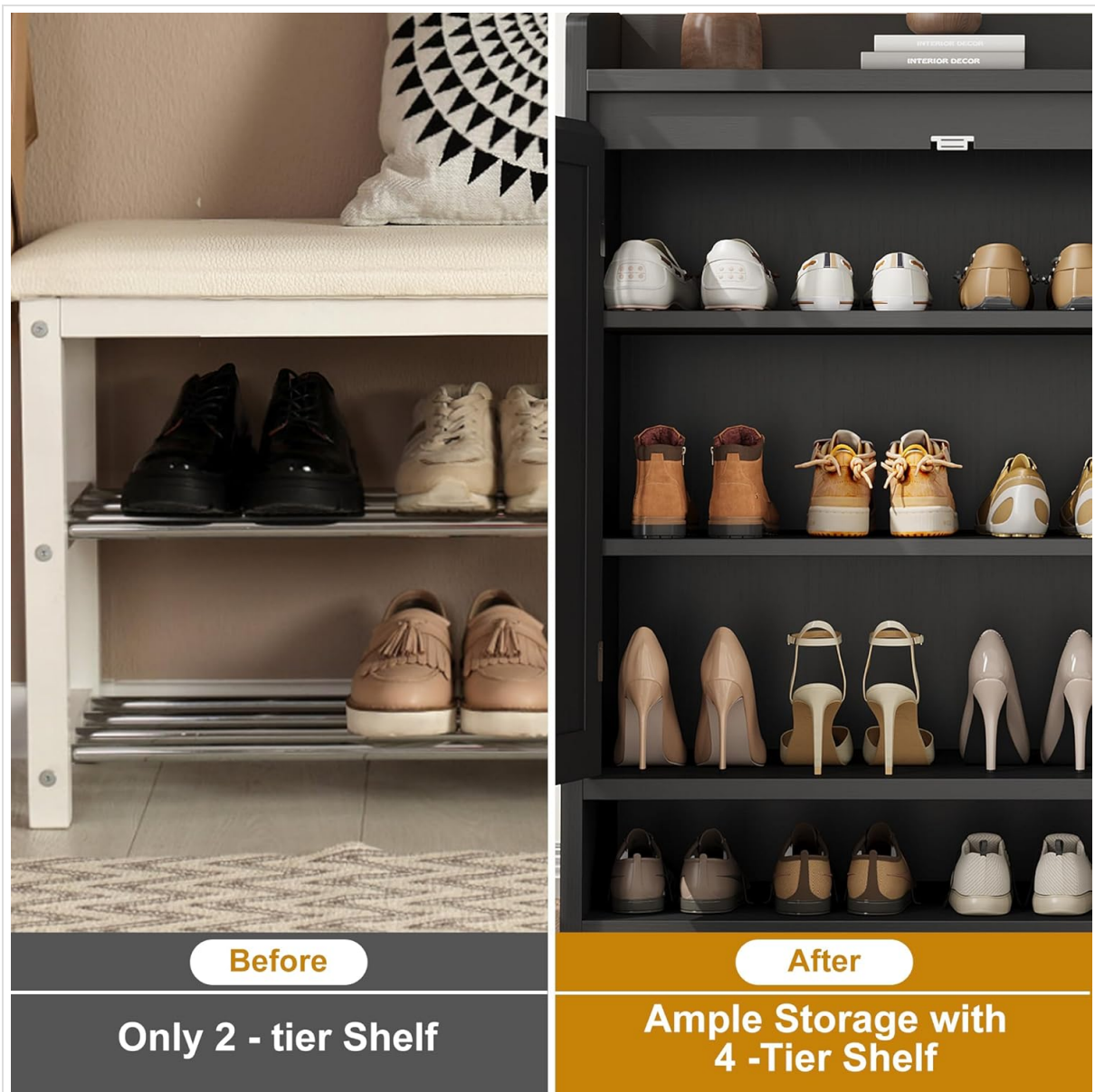
Image 4.2: A visual comparison illustrating the increased storage capacity achieved with the adjustable 4-tier shelf configuration compared to a smaller 2-tier shelf.