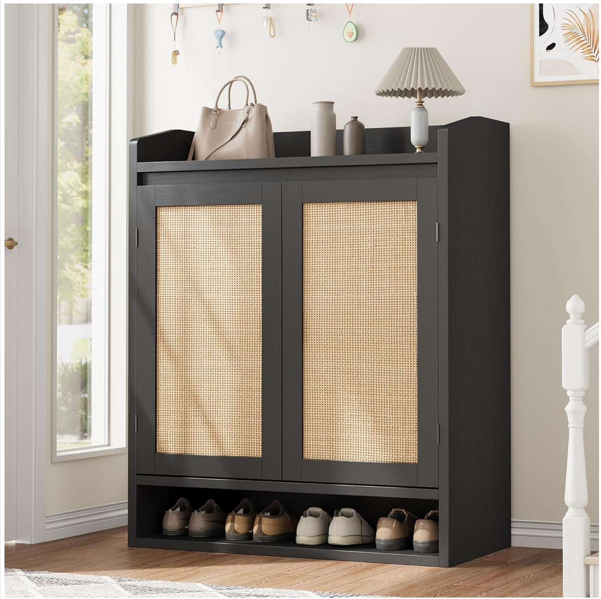
Image 1.1: Front view of the GarveeHome Rattan Shoe Cabinet, showcasing its two doors with rattan panels and a top surface for display.