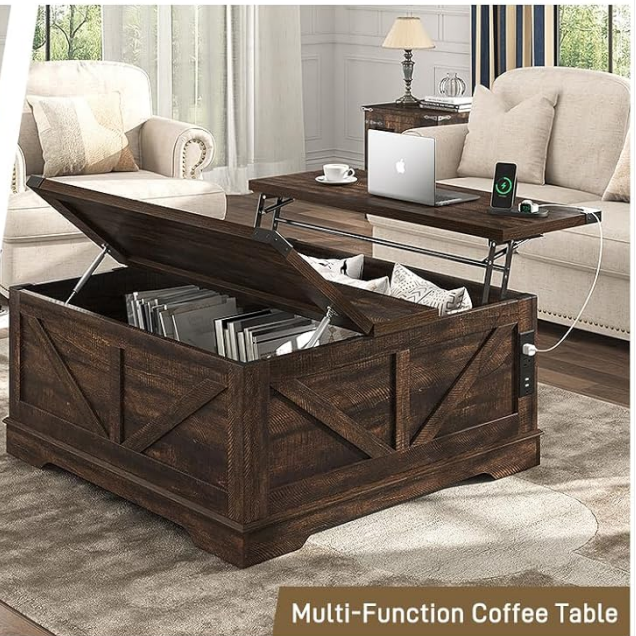
Multi-Function Coffee Table

Image: Various configurations of the coffee table, demonstrating its versatility as a standard table, with hidden storage, and with the lift-top extended.