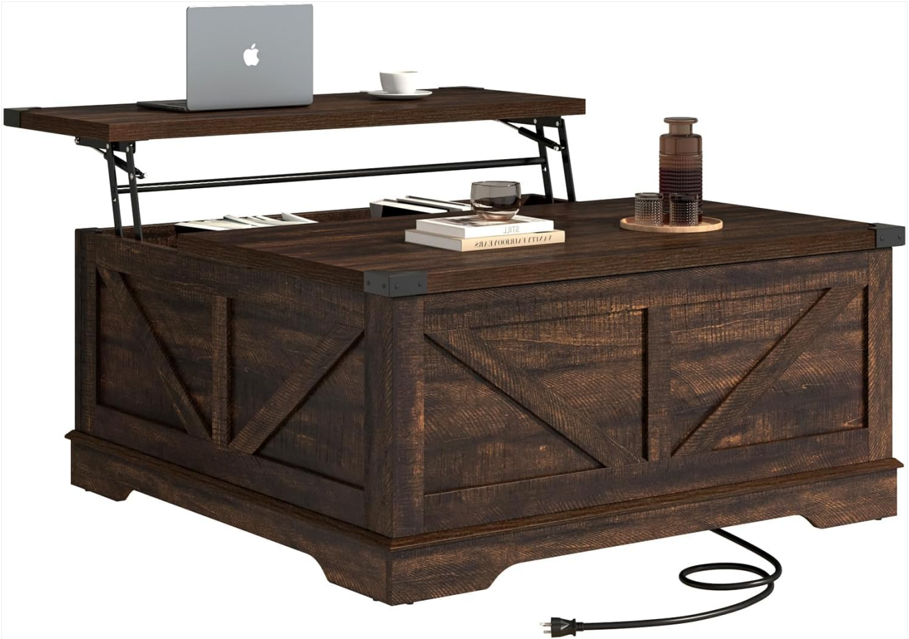
Image: The coffee table with its lift-top raised, showing the integrated power cord for the charging station.