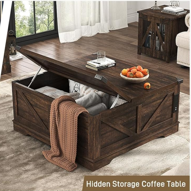
Hidden Storage Coffee Table