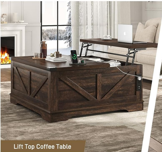
Lift Top Coffee Table