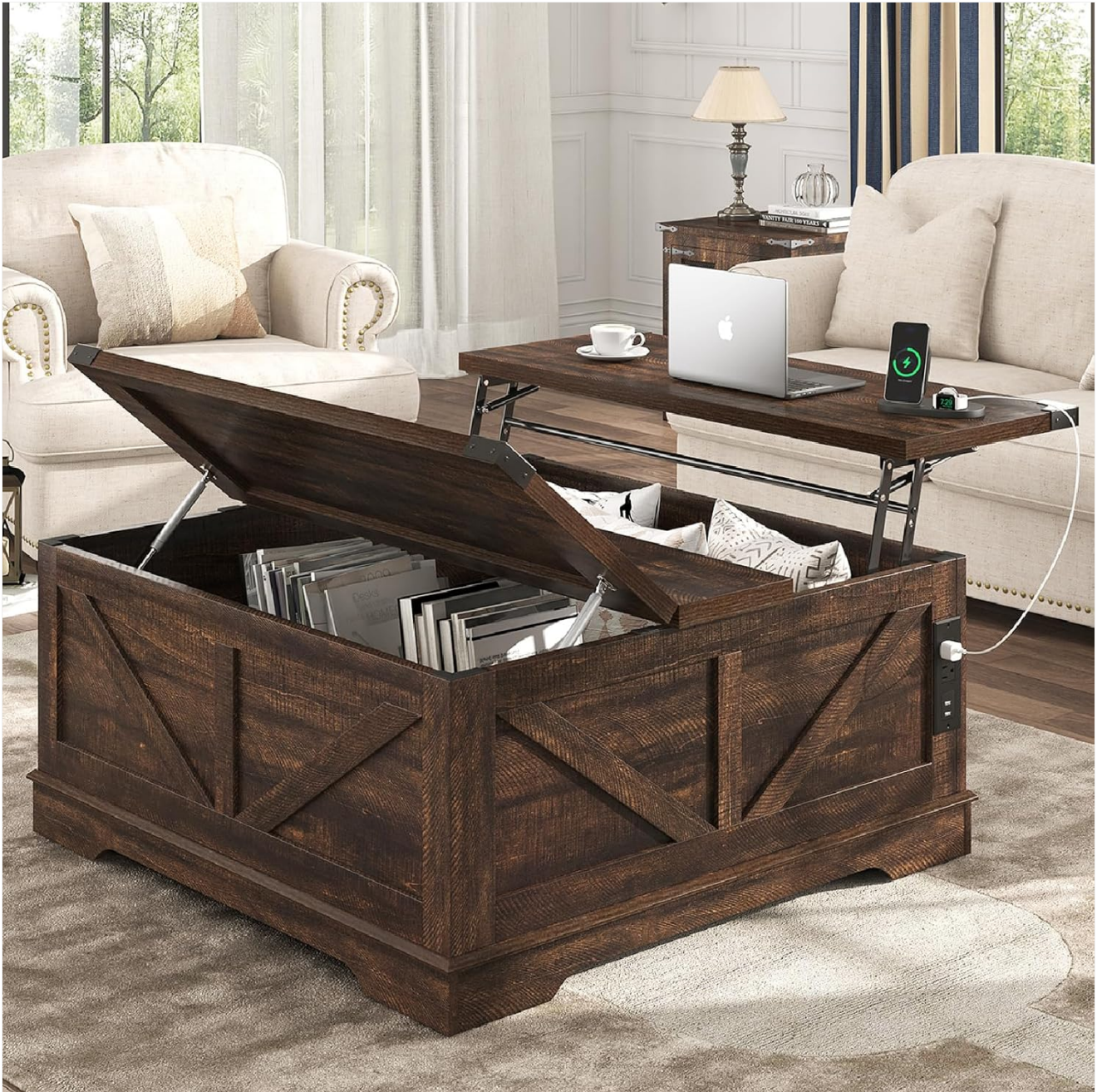
Image: The Hlivelood Farmhouse Lift Top Coffee Table in a living room setting, showcasing its lift-top functionality and hidden storage compartment.