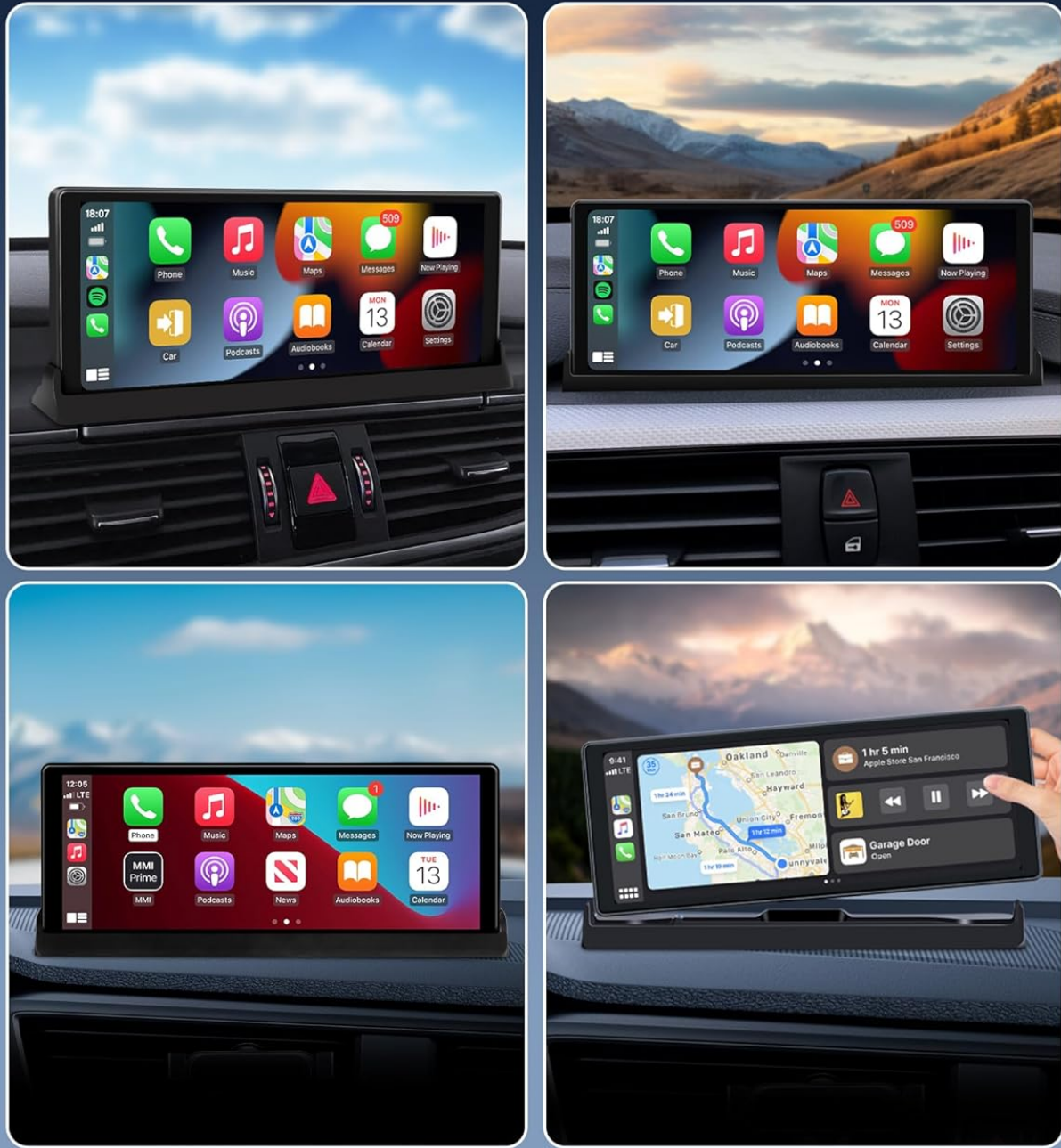
Image 3.1: Examples of the customized bracket installation in different vehicle interiors.

Perfectly match the size of the center console of some models, more beautiful