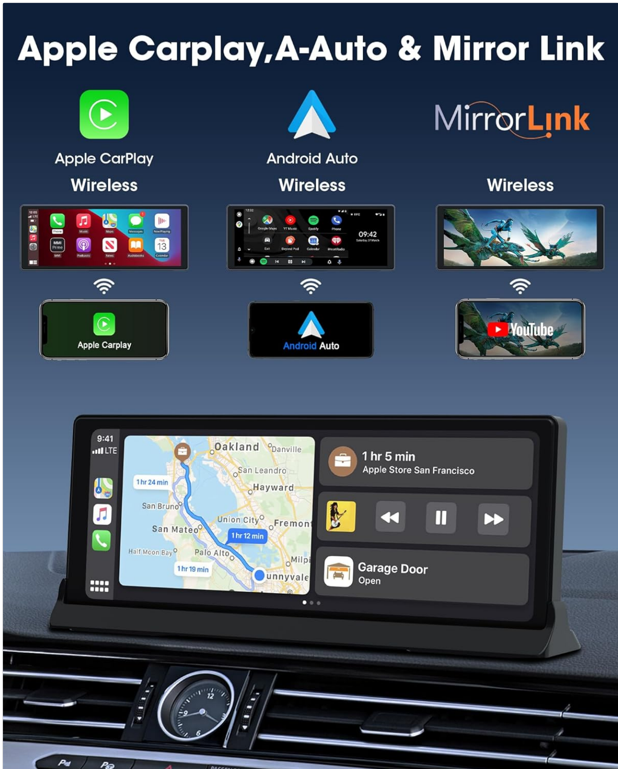
Image 4.1: Wireless Apple Carplay, Android Auto, and Mirror Link interfaces.

Once connected, you can access your phone's compatible apps, music, and navigation directly on the Carplay screen.