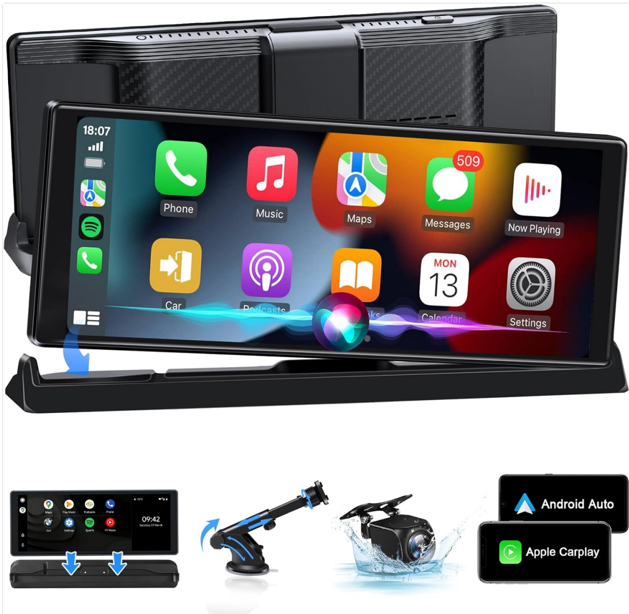
Image 2.1: Overview of the Jelkuz 10.26-inch Wireless Carplay Screen.