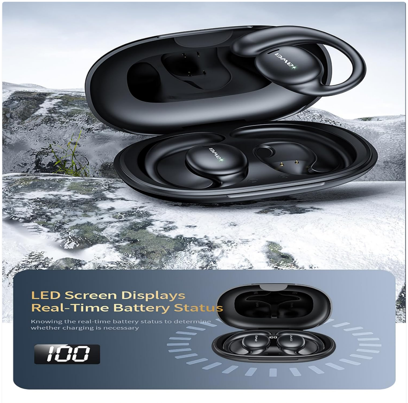
Image: The AWEI T80 charging case open, showing the earbuds inside and an LED display indicating "100" for full charge.

Before first use, fully charge the earbuds and the charging case. Connect the Type-C cable to the charging port on the case and to a USB power source. The LED display on the case will indicate the charging status.