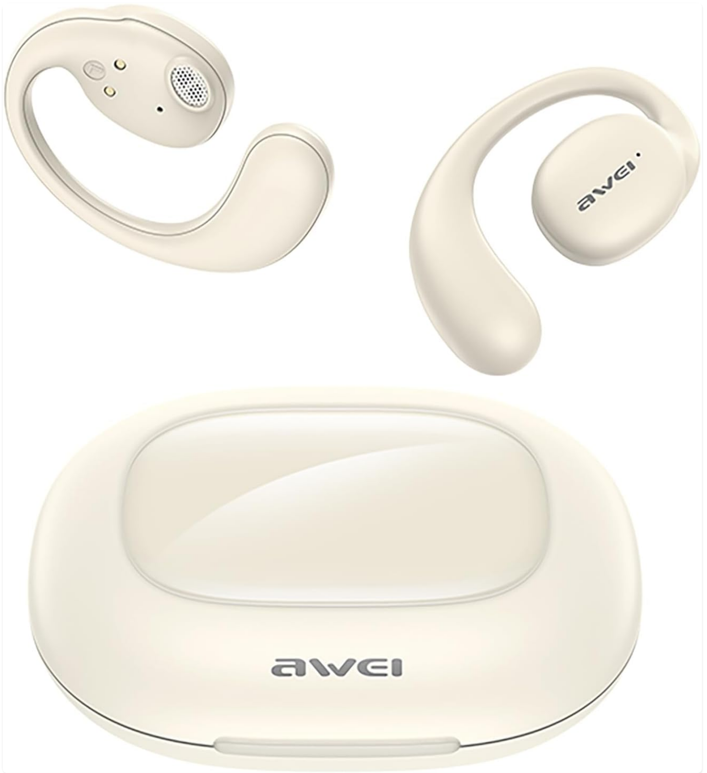
Image: The AWEI T80 earbuds in beige, showing both earbuds and their charging case. The earbuds feature an over-ear hook design for a secure fit.