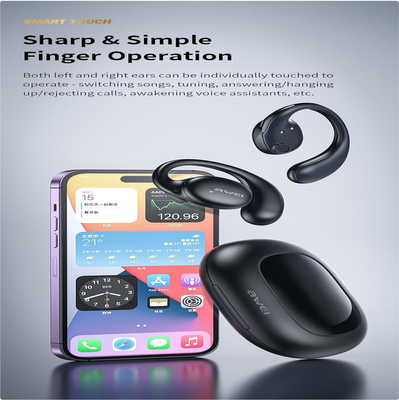
Image: The AWEI T80 earbuds positioned near a smartphone, highlighting their smart touch capabilities for various functions.

Equipped with 16mm large speakers, the AWEI T80 delivers exceptional audio quality with deep bass and clear sound. Built-in microphones ensure clear and loud voice transmission during calls.