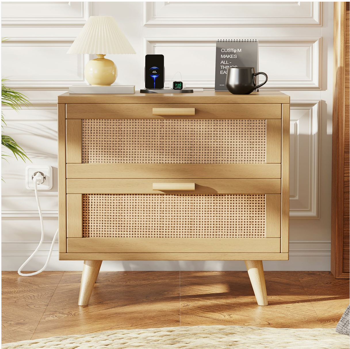
Image: The Rovaux Rattan Nightstand, showcasing its natural oak finish, two rattan-front drawers, and integrated charging station on the top surface.