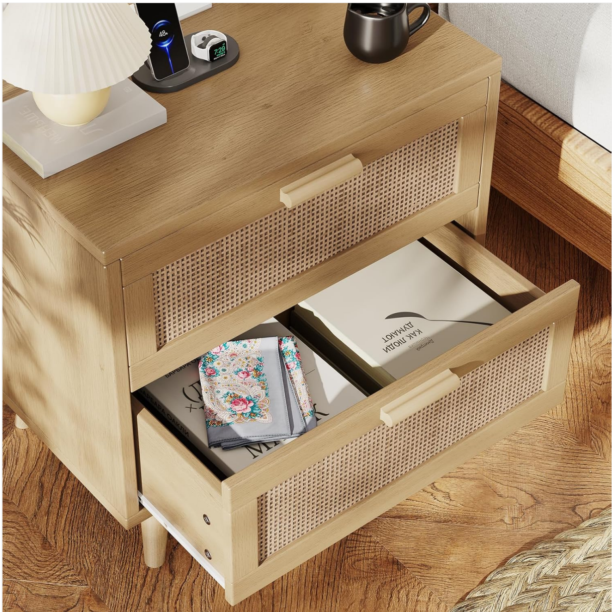
Image: The bottom drawer of the nightstand is partially open, showing books and a folded scarf stored inside, demonstrating its storage capacity.