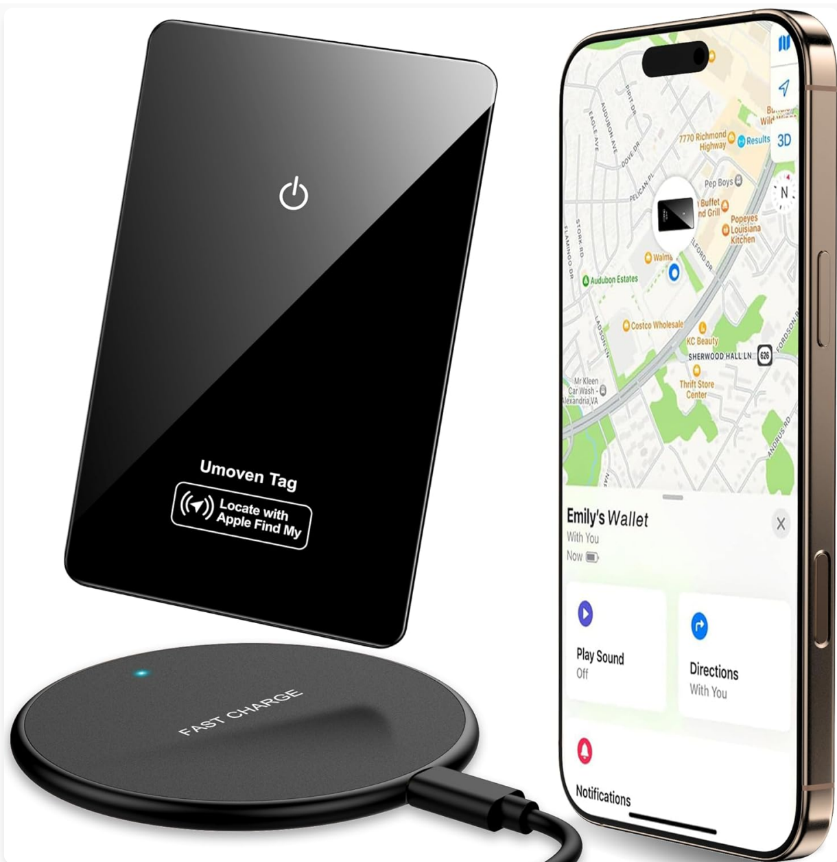
Umovent Tracker Card, Wireless Charger, and iPhone displaying the Find My app.

The package includes the Umovent Tracker Card and a wireless charging device. The card is ultra-thin, making it ideal for wallets, luggage tags, ID card holders, and backpacks.