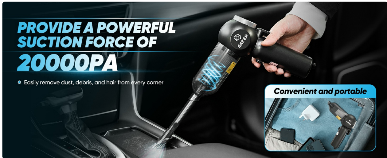
Image 5.1: Demonstrating the powerful suction of the Saker SW-102.

for larger areas) to the front of the vacuum. Turn on the device and select the appropriate suction level. Move the nozzle over the area to be cleaned.