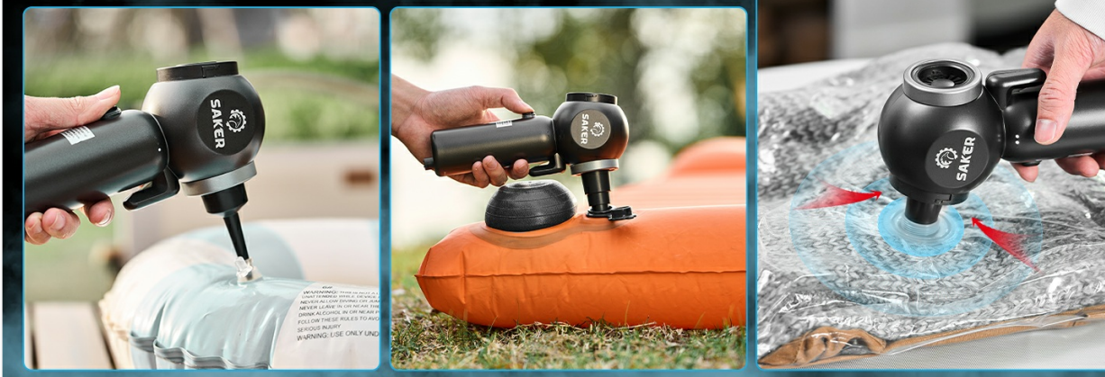
Image 5.3: The Saker SW-102's air inflating and extracting functions.