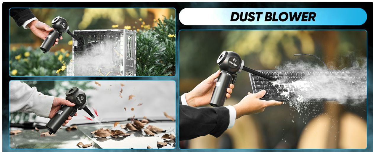
Image 5.2: Using the Saker SW-102 for its dust blowing capabilities.

Attach a blowing nozzle (e.g., short blowing nozzle, long blowing pipe, pipe blowing round brush) to the rear exhaust port of the vacuum. Turn on the device and use it to blow away dust from keyboards, car vents, or other hard-to-reach areas.