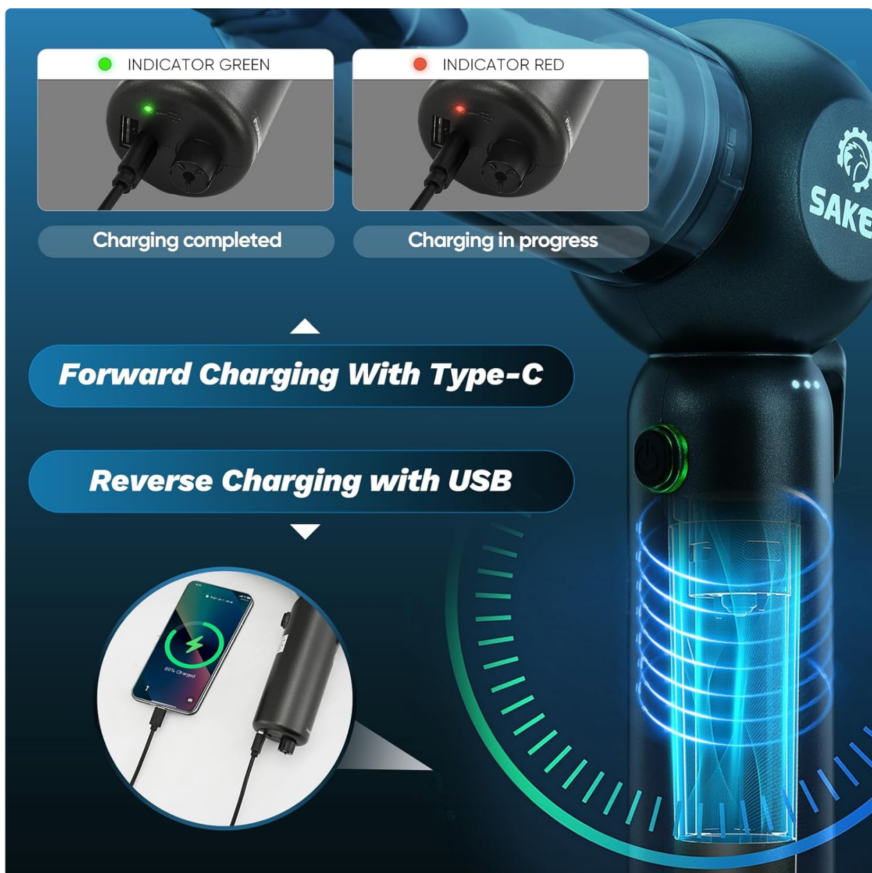
Image 4.1: Charging the Saker SW-102 and using it as a power bank.