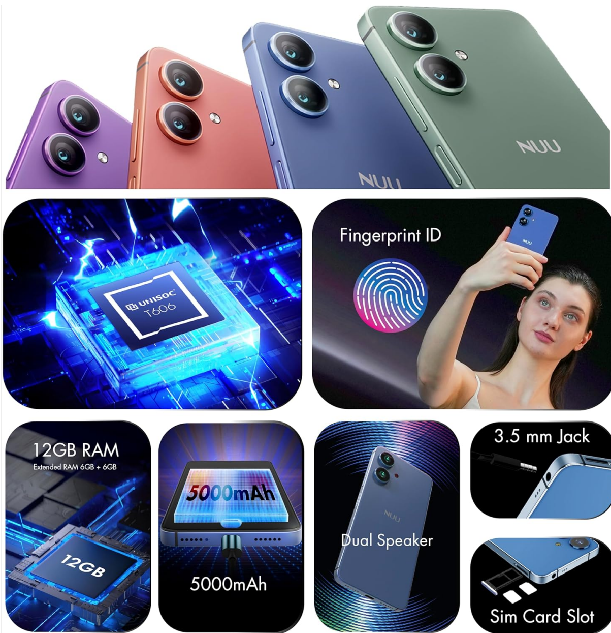
Figure 6: Detailed view of the NUU N20 camera specifications, including 16MP main, 8MP wide-angle, and 5MP front cameras.

Video 2: Showcases the NUU N20 camera features and capabilities. This video demonstrates the camera's performance in various settings.