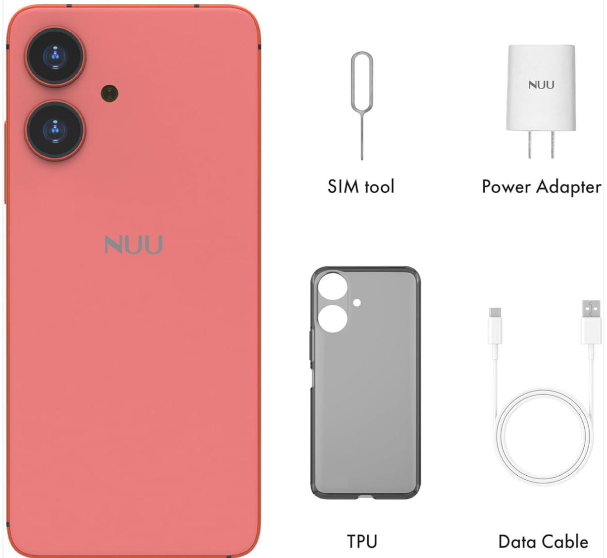
Figure 3: Rear view of the NUU N20 Basic Cell Phone, showing the dual camera setup and NUU branding.