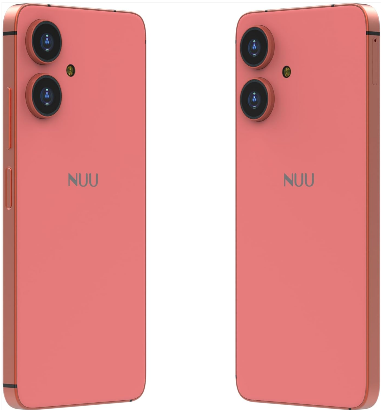
Figure 2: Side view of the NUU N20 Basic Cell Phone, highlighting its slim profile and button placement.