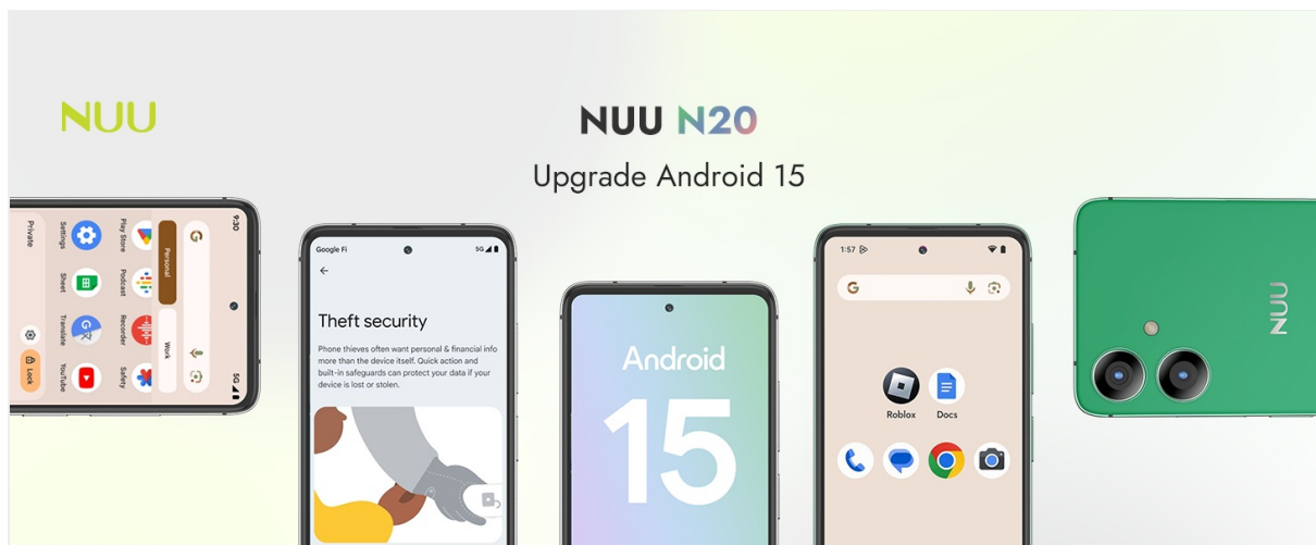
Figure 9: The NUU N20 displaying the Android 15 operating system interface.