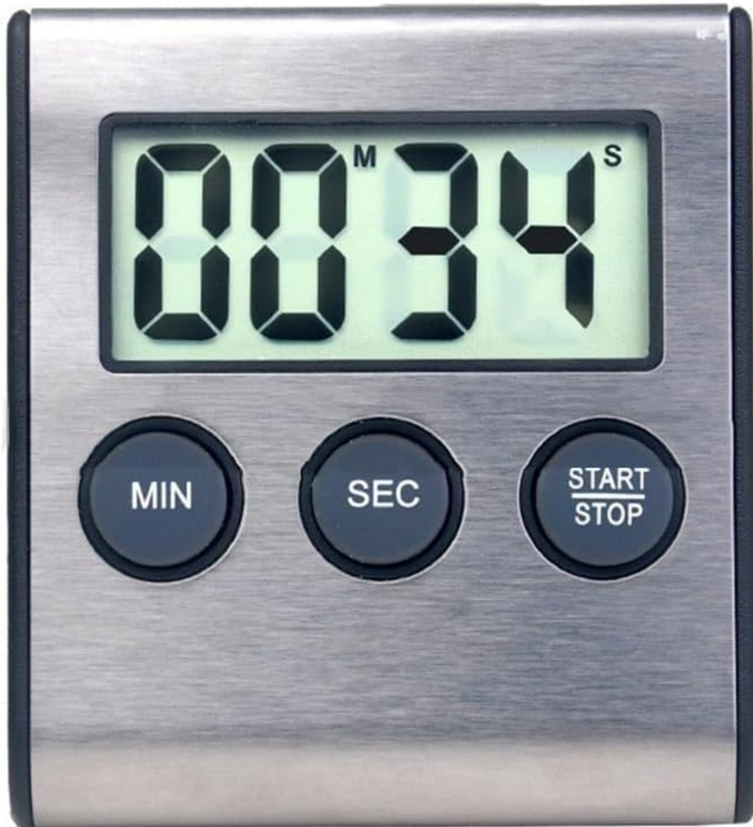
Image: The main product view of the timer, showing its large LCD display and control buttons.