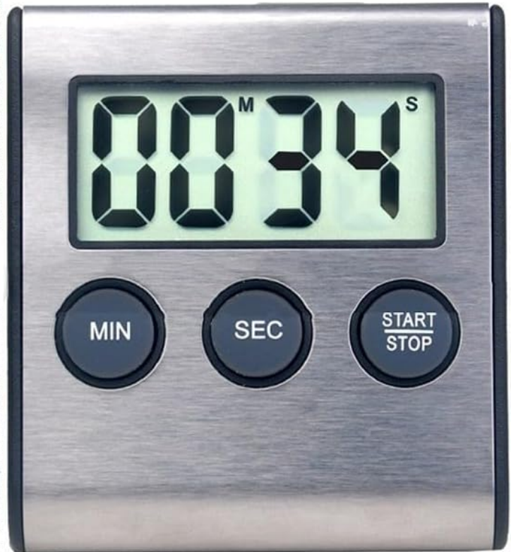
Image: The timer with its physical dimensions clearly indicated.