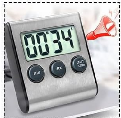
Image: The timer shown in different placement scenarios, including being attached magnetically to a surface, standing on a table, and hanging.