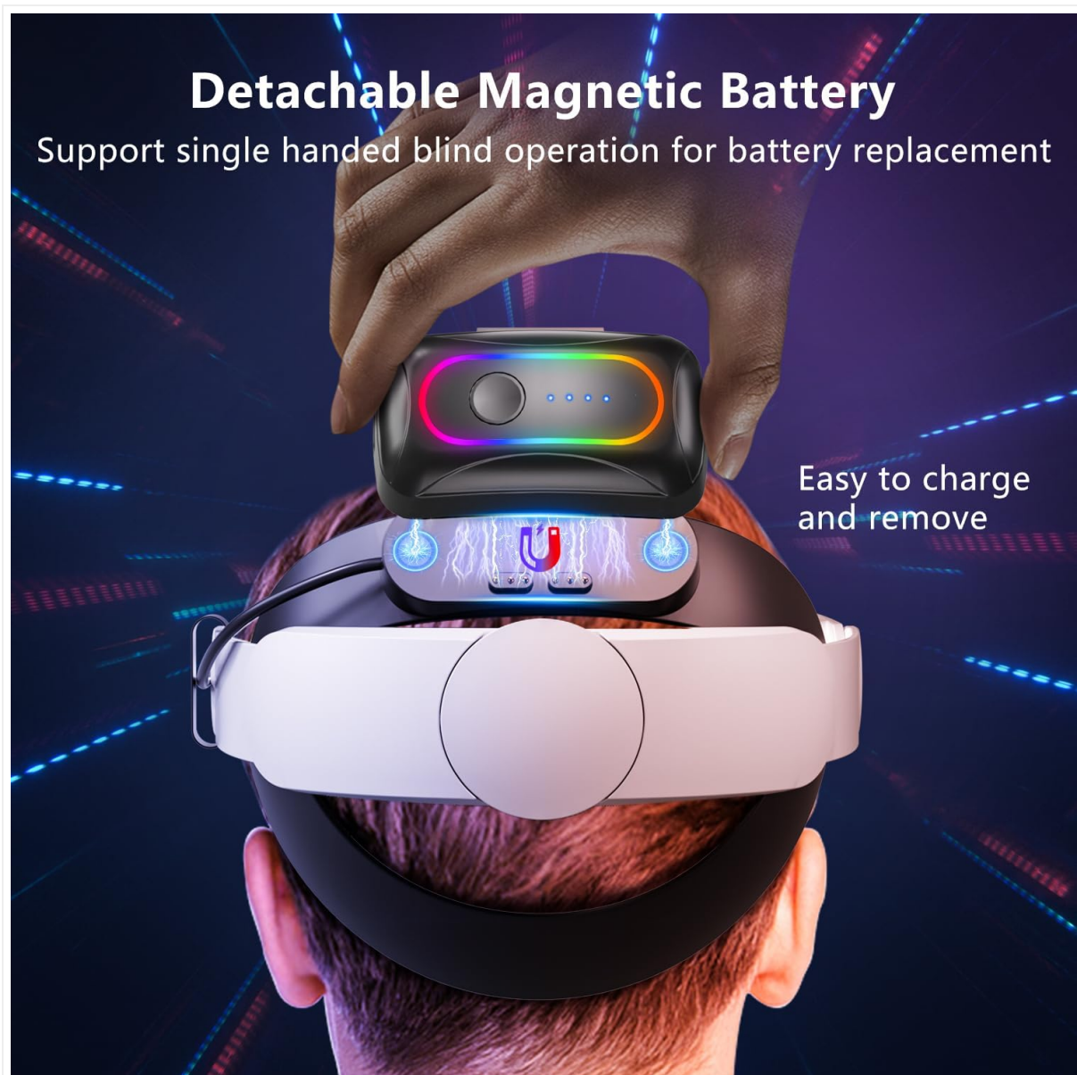
Image: The Saqico head strap securely attached to a Meta Quest headset.