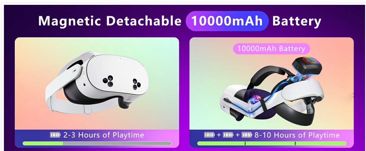
Image: The head strap features colorful RGB lighting.