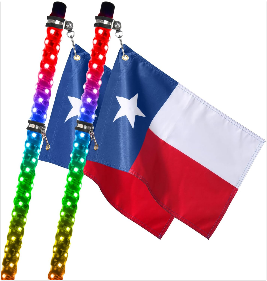
Image: Two Texas flags attached to whip lights, illustrating how they connect.