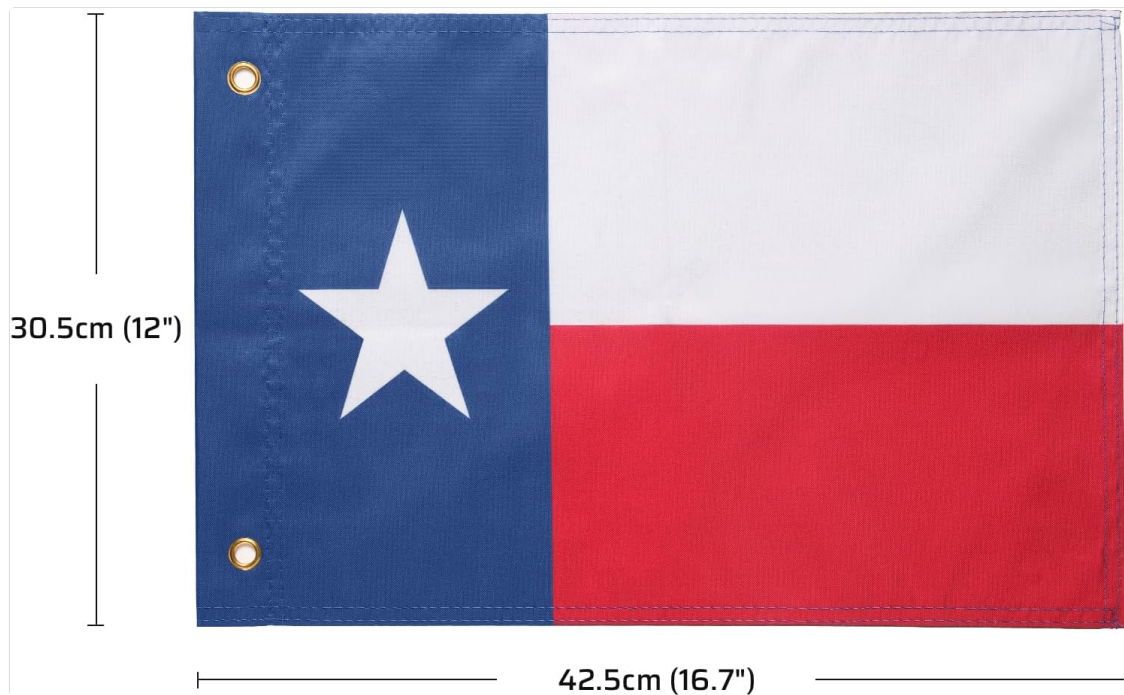
Image: Dimensions of the Texas flag.