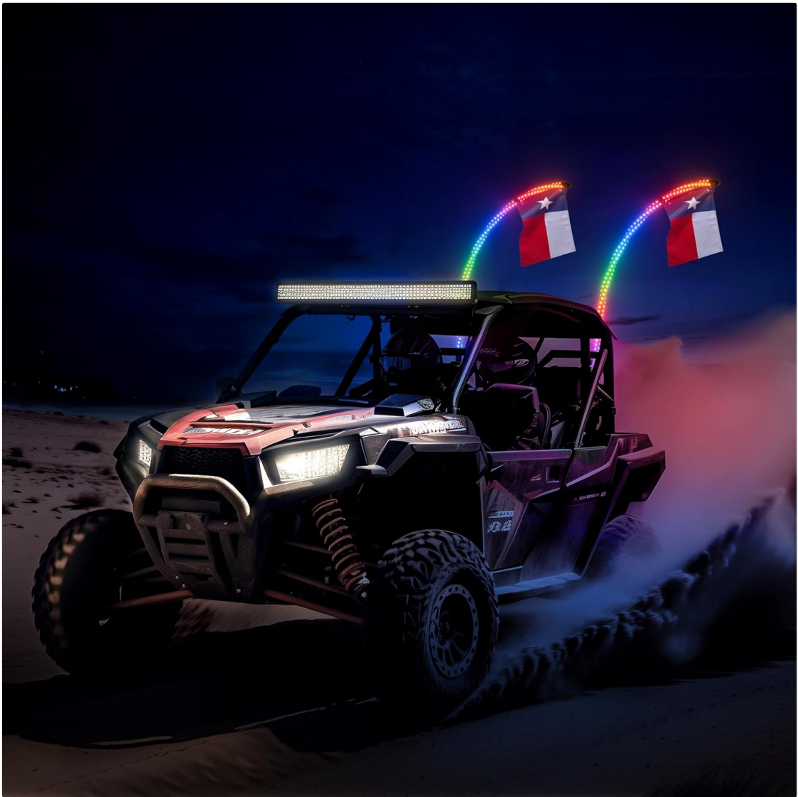
Image: Example of flags installed on a UTV with whip lights.