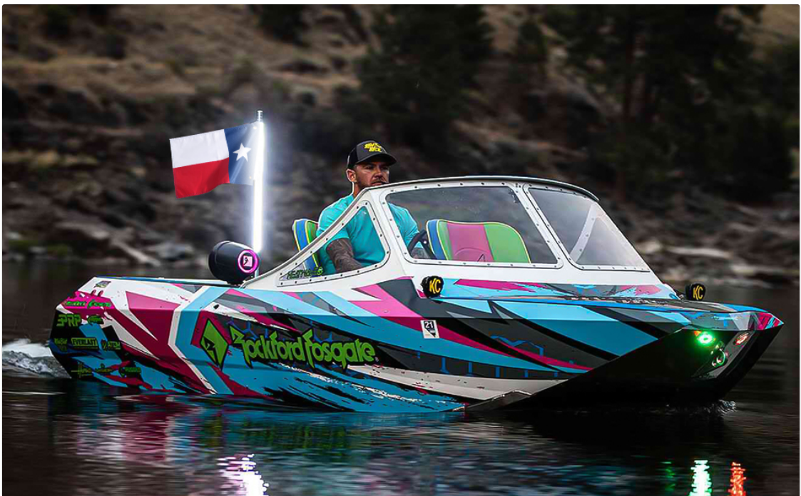
Image: Example of a flag installed on a boat.