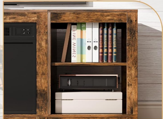
Durable and Sturdy Base Maximum weight capacity 420 LBS