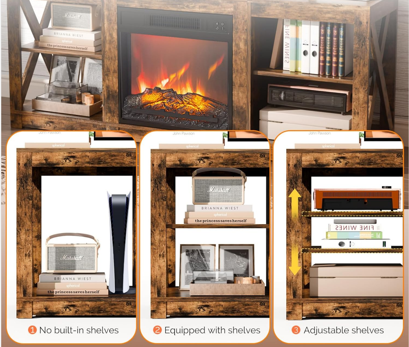
Figure 4.1: Examples of personalized storage configurations with adjustable and removable shelves.

Flexible storage to meet your specific needs