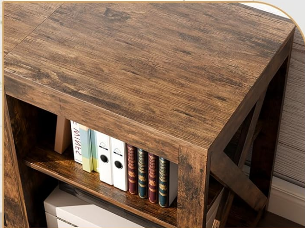
Refined and Elegant Surface Waterproof and Scratch-resistant