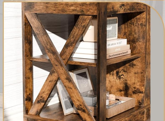
Criss-Cross Embellishment Graceful intersecting design