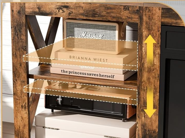
Ample Storage Capacity Flexible storage to meet your specific needs