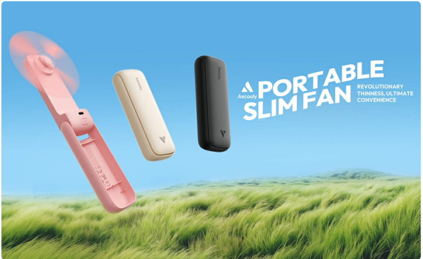
Image: Close-up of the fan's USB Type-C charging port and power button, highlighting its 2000 mAh battery capacity.

Before first use, fully charge your Aeecooly Slim Portable Fan. Connect the provided USB Type-C charging cable to the fan's charging port and plug the other end into a compatible USB power source (e.g., wall adapter, computer USB port). The indicator light will show charging status. A full charge provides up to 24 hours of cooling time.