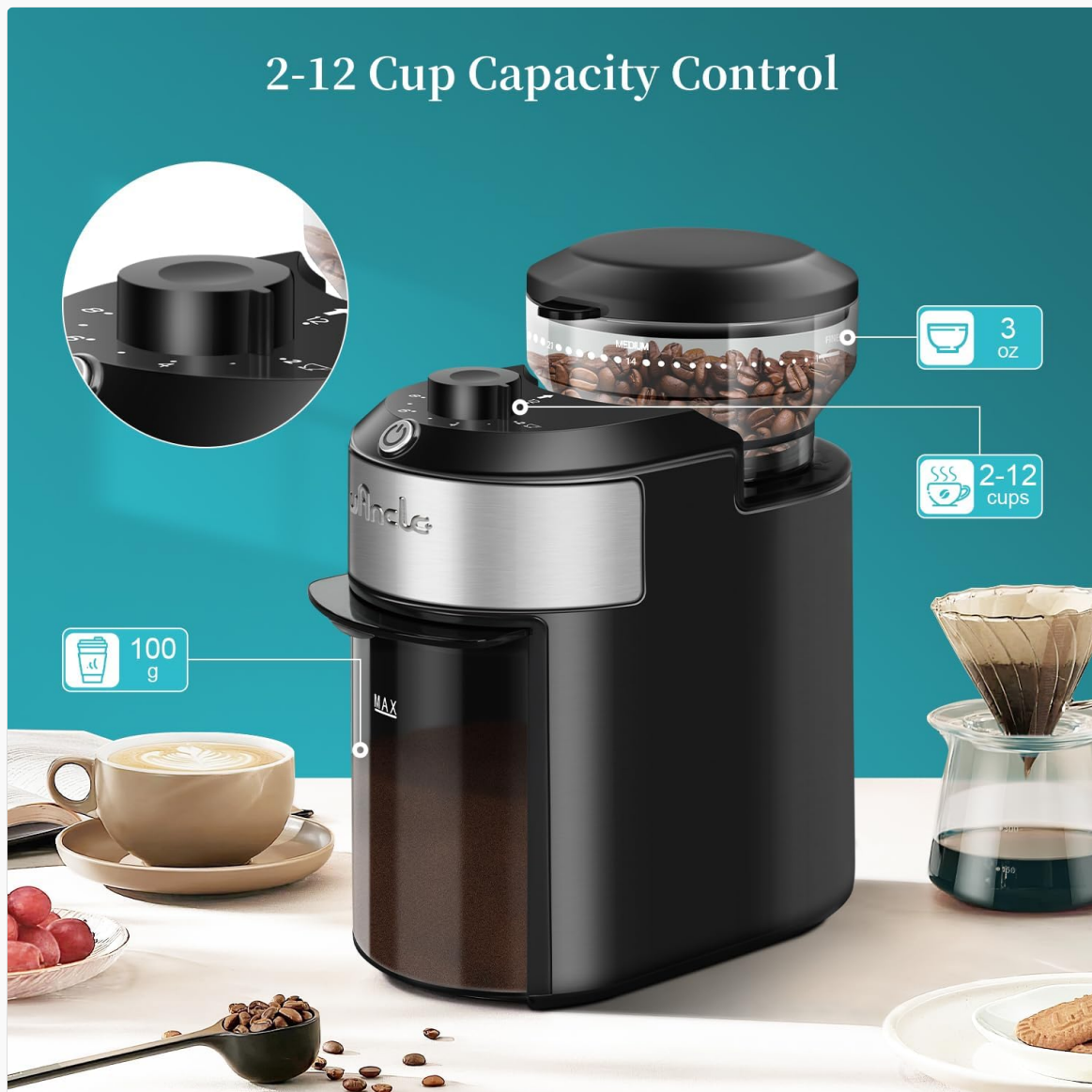
Image 5.1: The Wancle CBG-8002 coffee grinder demonstrating its 2-12 cup capacity control feature, with indicators for 3 oz of beans and 2-12 cups of ground coffee, alongside a brewed coffee setup.