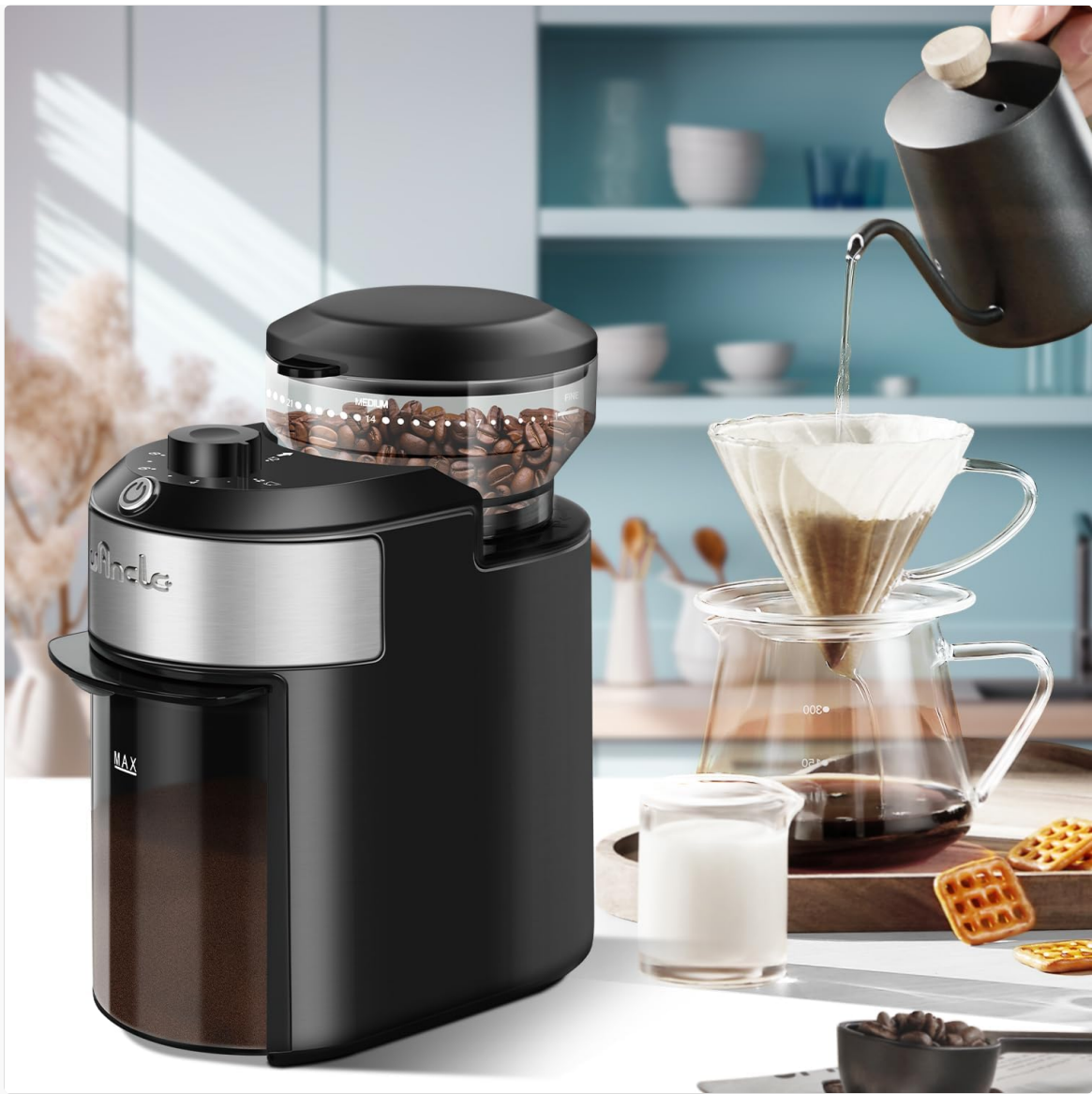
Image 5.2: The Wancle CBG-8002 coffee grinder in a kitchen setting, with coffee being prepared using a pour-over method, highlighting its integration into a coffee brewing routine.