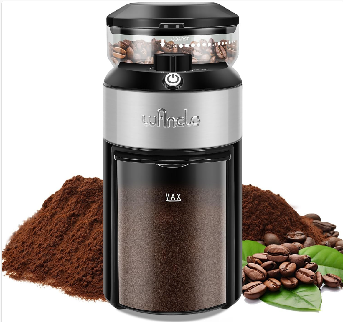
Image 3.1: The Wancle CBG-8002 Flat Burr Coffee Grinder, showcasing its main components including the bean hopper, control panel, and ground coffee container, surrounded by coffee beans and ground coffee.

The Wancle CBG-8002 is a flat burr coffee grinder designed for precise and consistent grinding. It features a compact design and user-friendly controls.