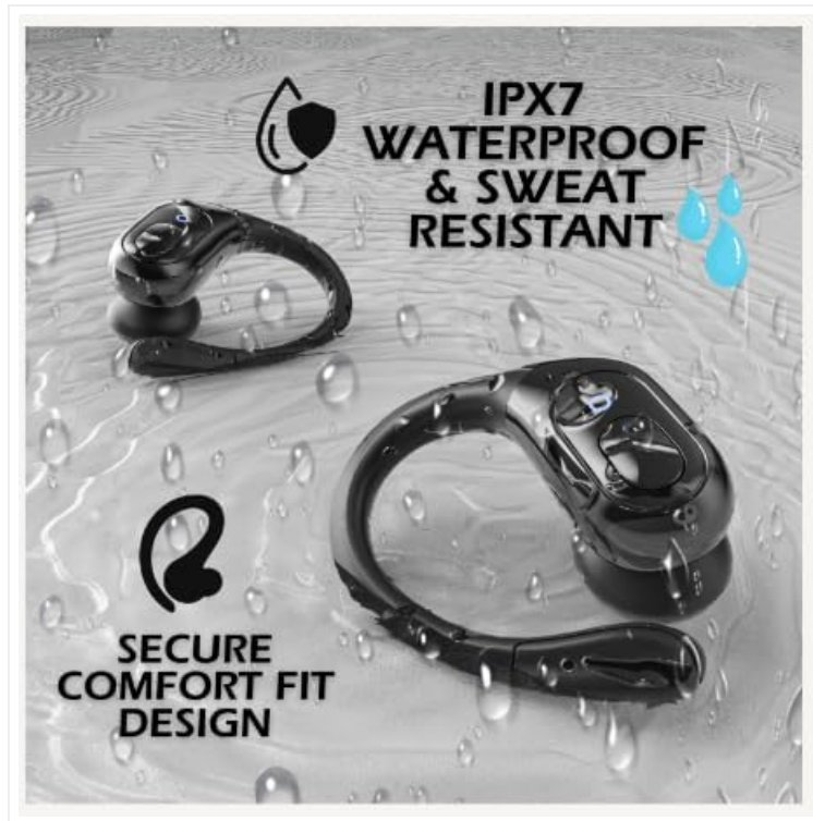
Image: Earbuds shown with water droplets, highlighting their IPX7 waterproof and sweat-resistant design, making them suitable for active use.