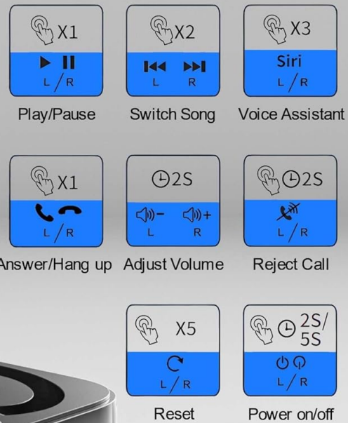
Image: Detailed guide to the push-button controls on the earbuds for various audio and call functions.