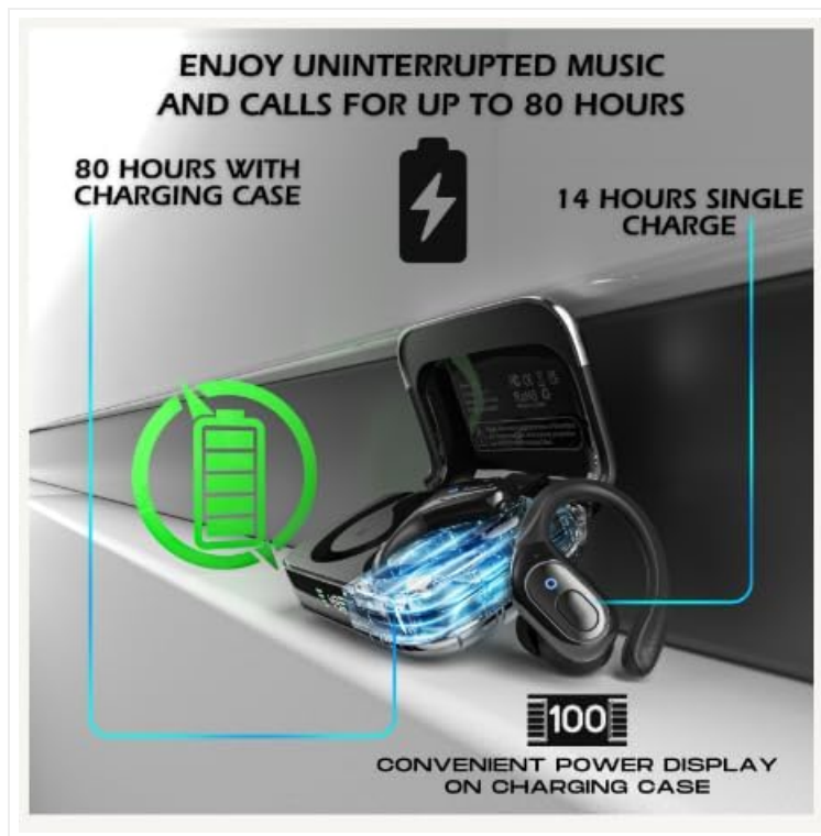
Image: The charging case displaying battery levels, indicating 14 hours of single charge playtime for earbuds and 80 hours total with the case.