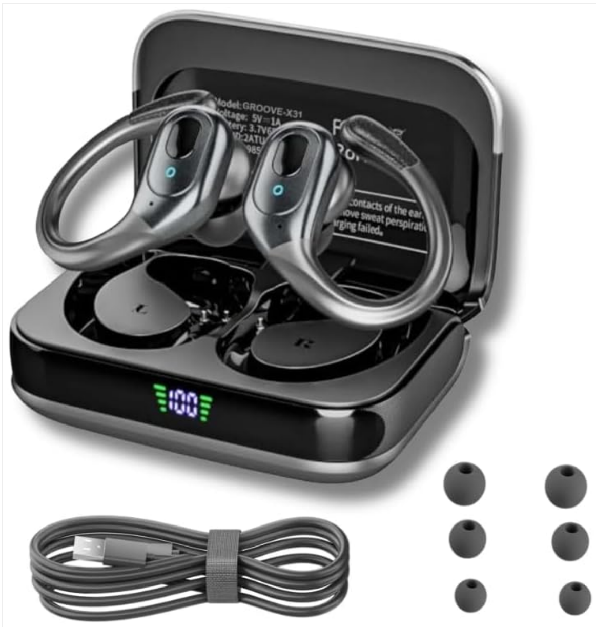
Image: Contents of the Groove Wireless Bluetooth Earbuds package, including earbuds, charging case, USB-C cable, and various eartip sizes.