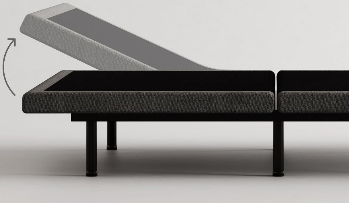
Image: An adjustable base demonstrating customizable comfort and support with head and foot elevation.

Elevate your head or feet and relieve pressure with our Zero Gravity setting.