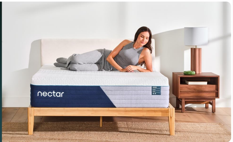
Image: A Nectar mattress in a bedroom setting, emphasizing the 365-night trial, Forever Warranty, and simple setup.