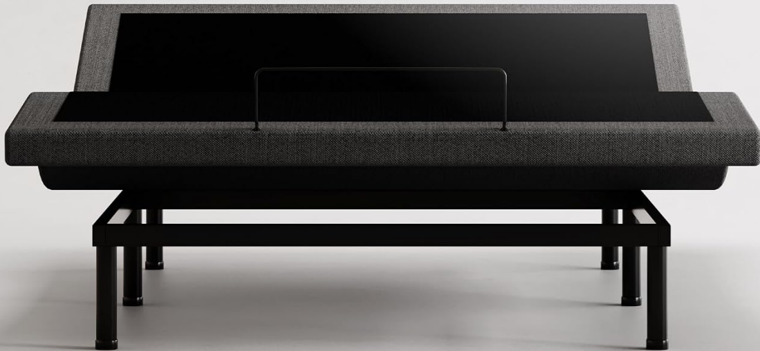
Image: The Nectar Premier Adjustable Base with a mattress, highlighting its easy setup, customizable support, and smart technology.