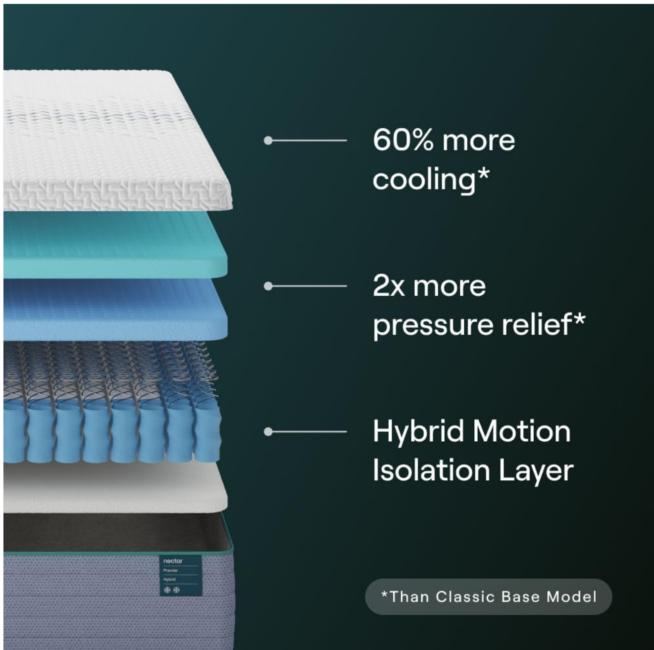
Image: A cross-section view of the Nectar Premier Hybrid Mattress, illustrating its multiple layers for cooling, pressure relief, and motion isolation.