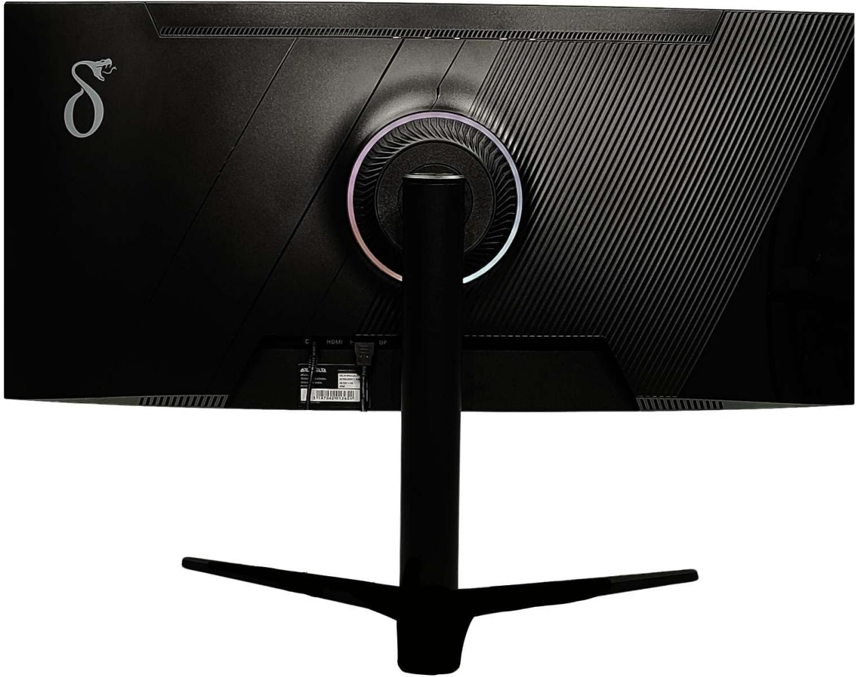
Image: Rear view of the monitor with the stand securely attached.

Your browser does not support the video tag.