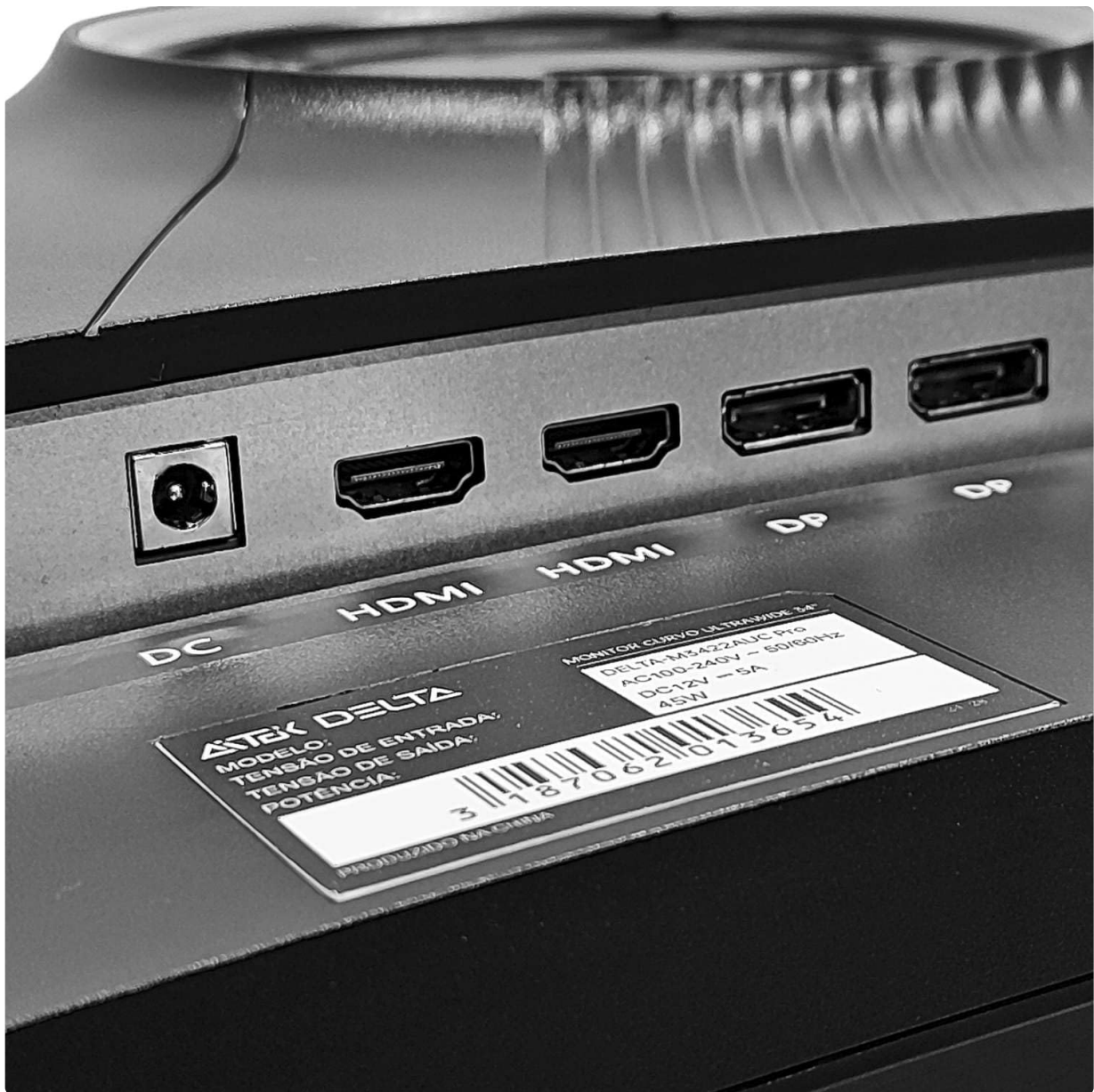
Image: Close-up view of the monitor's connectivity ports, including DC power input, HDMI ports, and DisplayPort inputs.