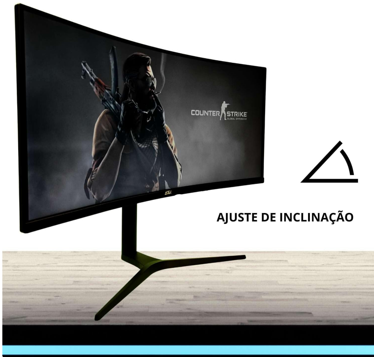
Image: Illustration of the monitor's tilt adjustment capability.