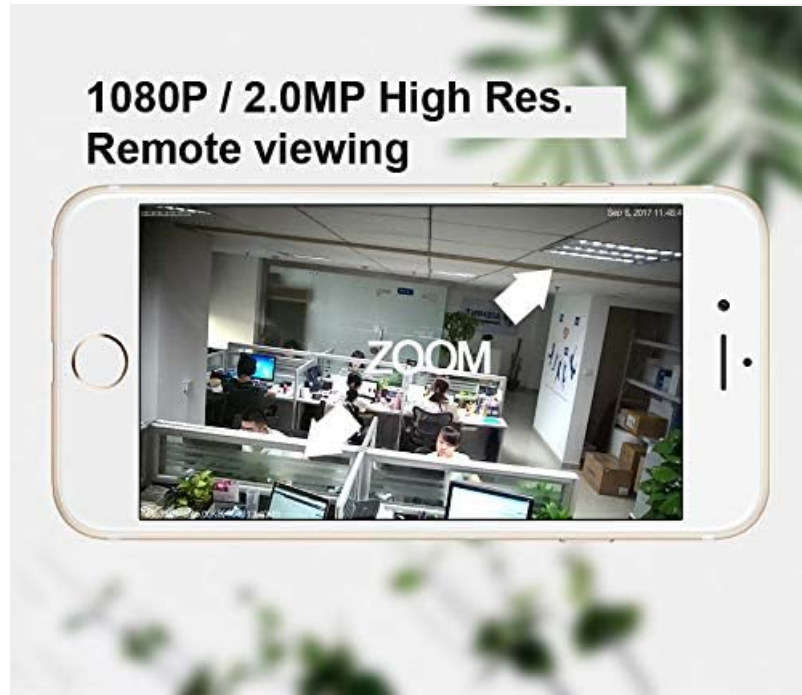
Figure 3: Remote viewing of the 1080p live feed via the mobile application.