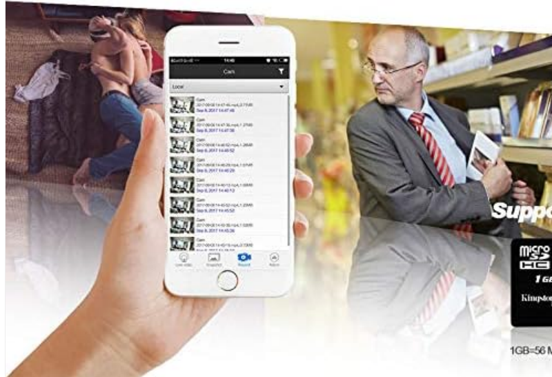
Figure 4: Mobile app interface showing a list of recorded events for playback.