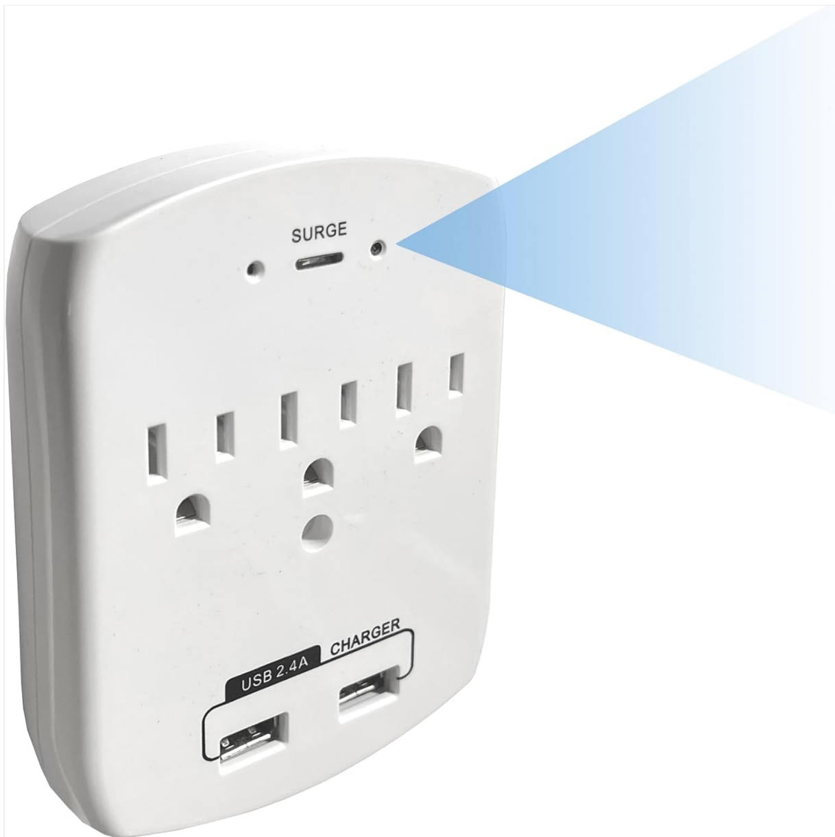
Figure 2: Angled view indicating the discreetly placed camera lens and confirming the full functionality of the power outlets.