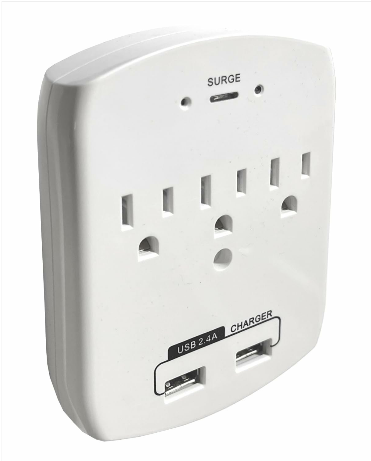
Figure 1: Front view of the WF-113, displaying the AC outlets and USB charging ports.

Familiarize yourself with the physical components of your WF-113 device.