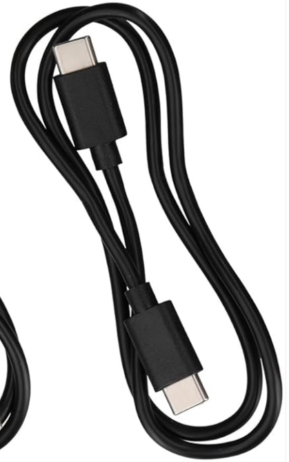
USB-C to USB-C Cable