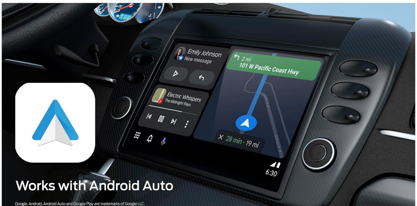
Image 5: The adapter supports both Apple CarPlay and Android Auto, as shown on the car's display.