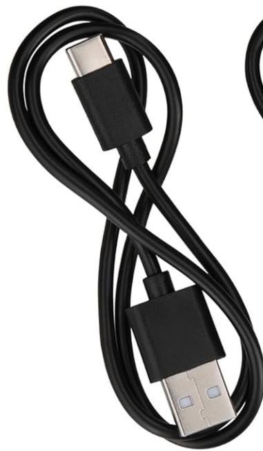
USB-C to USB-A Cable