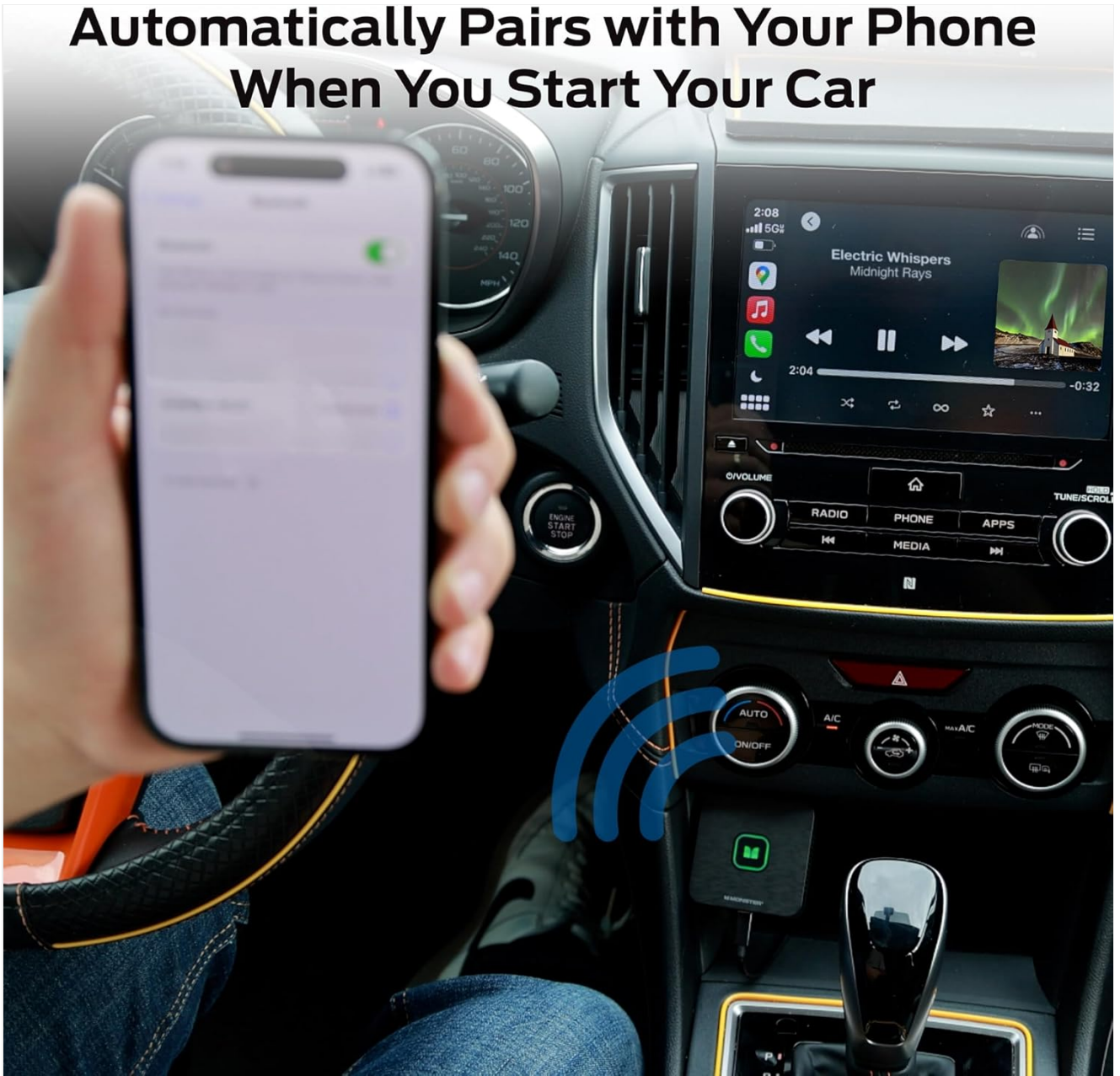
Image 3: The adapter connected to a car's USB port, ready for pairing.