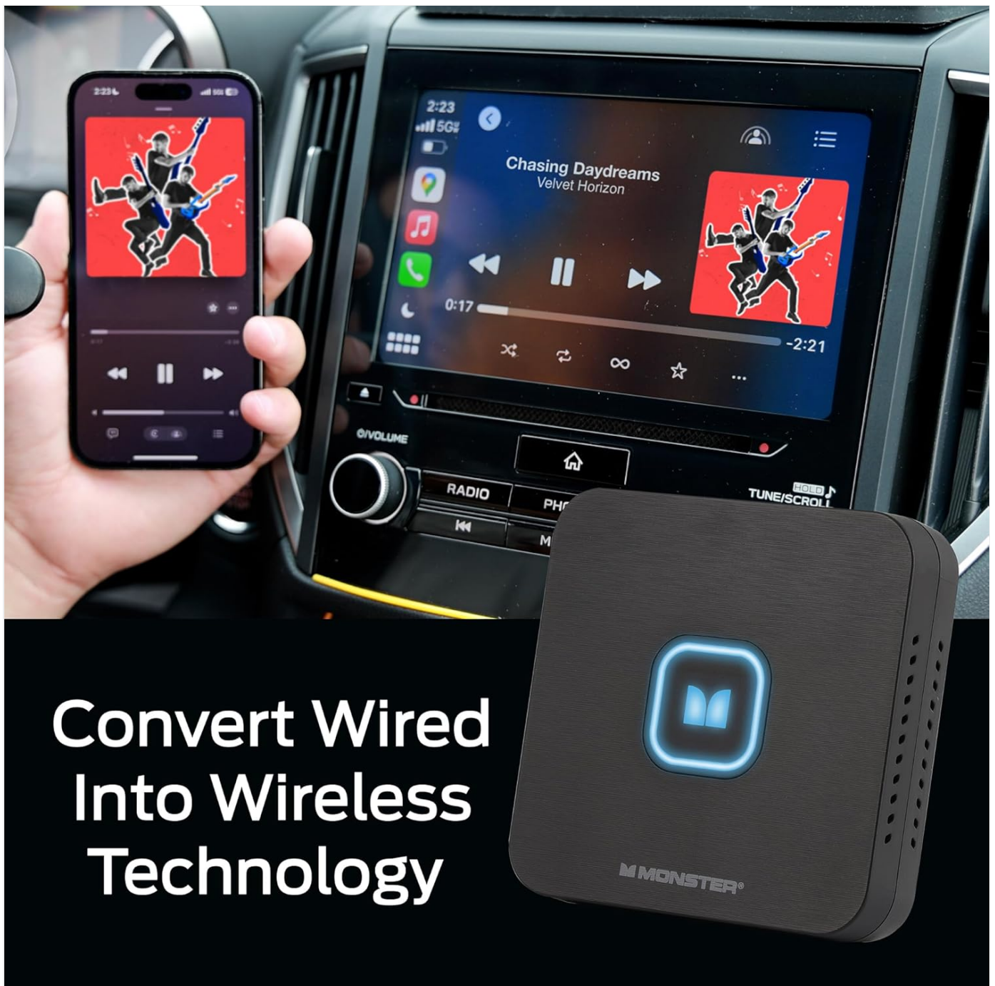
Image 1: The Monster Wireless Adapter in a car interior, demonstrating wireless CarPlay functionality.