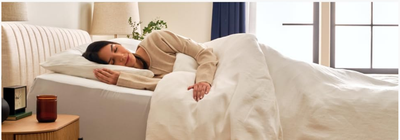
Image: The Nectar Premier Adjustable Base, highlighting its easy setup, customizable support, and smart technology features.

If you struggle with mobility issues, sleep apnea, heartburn, acid reflux, poor circulation, or any ailment where it's better to sleep in a more upright position, this frame is your perfect match.