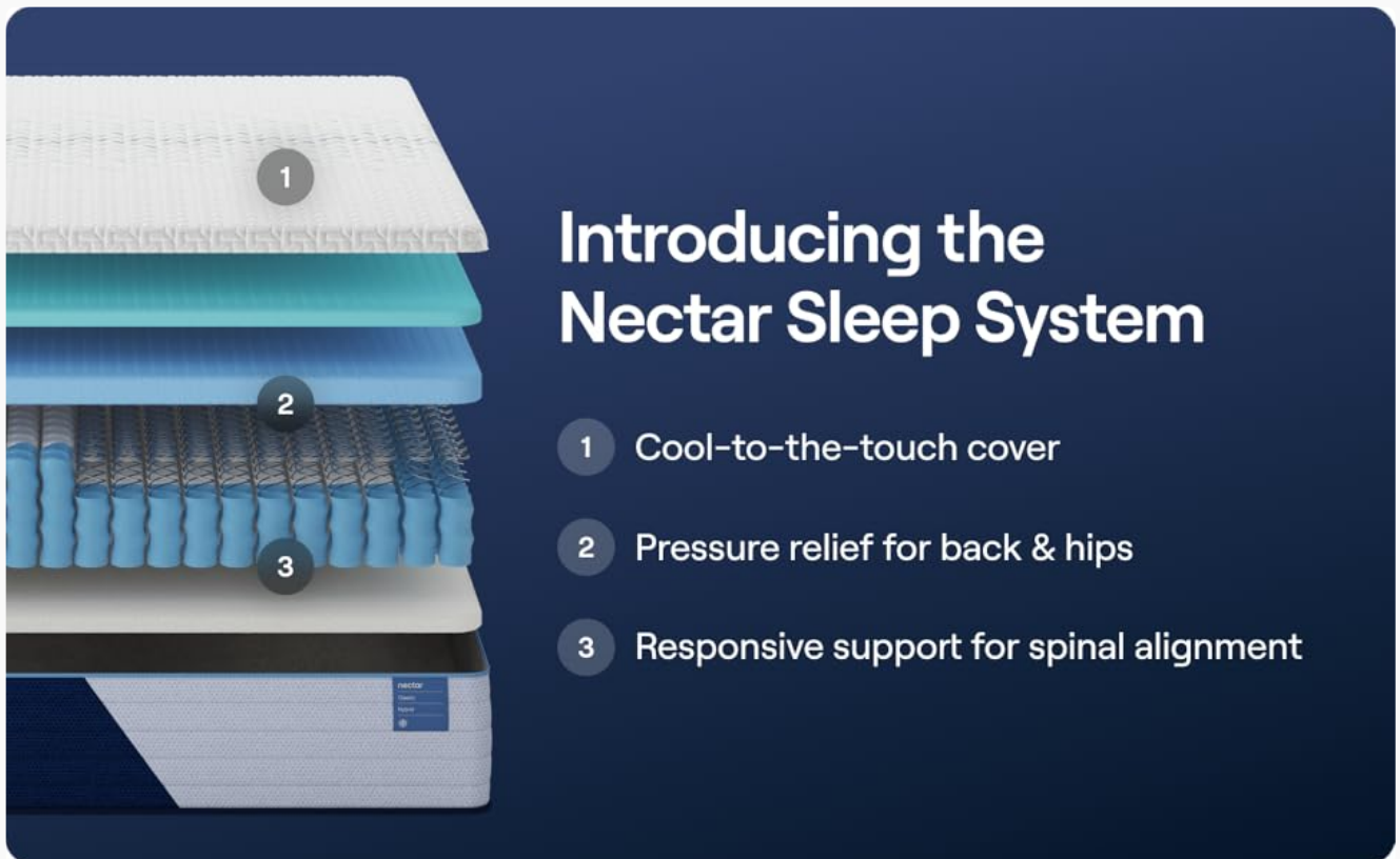
Image: A diagram illustrating the layers of the Nectar Sleep System, including the cool-to-the-touch cover, pressure relief memory foam, and responsive support for spinal alignment.