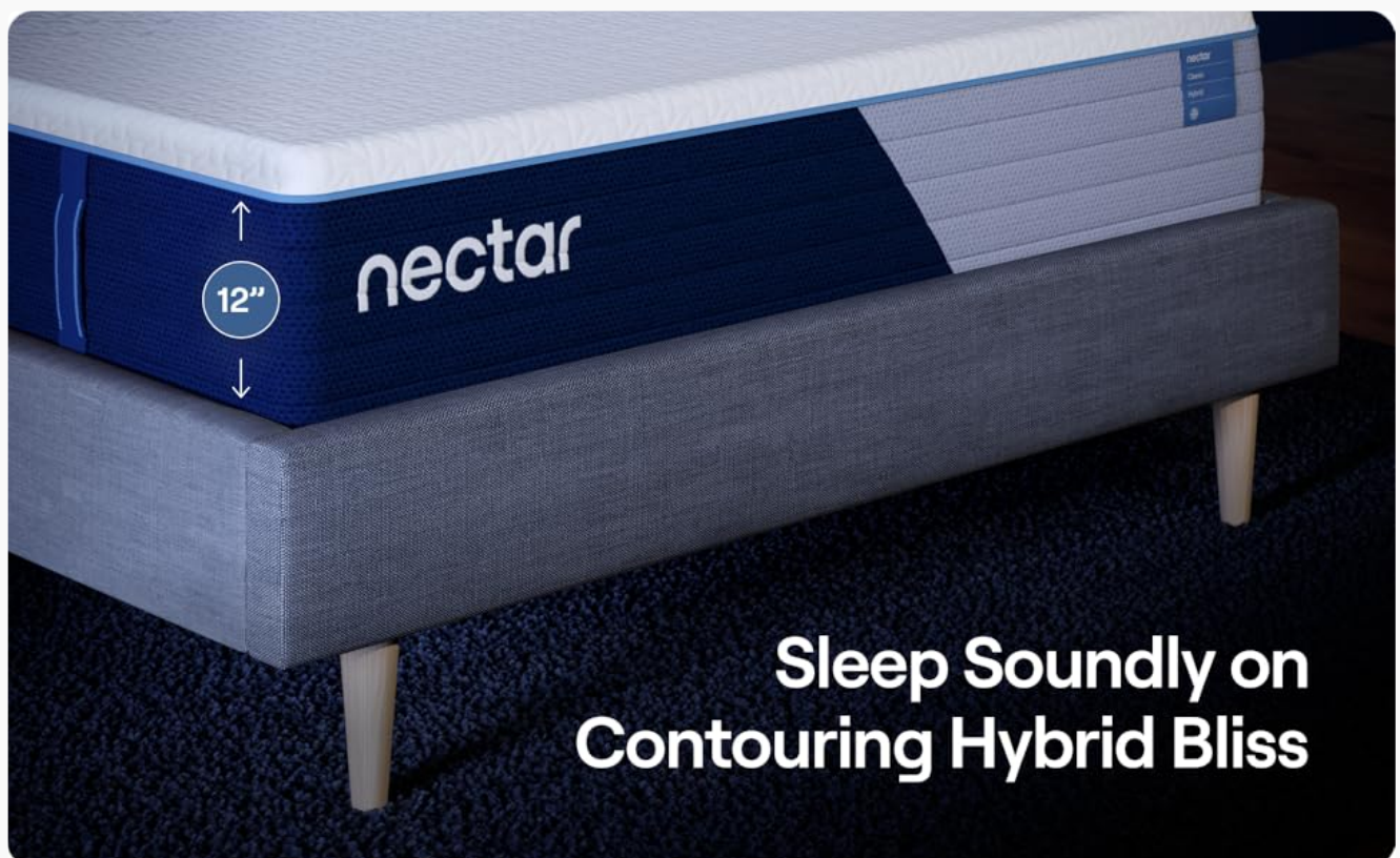
Image: The Nectar Split King Adjustable Base and 12-inch Hybrid Mattress, shown with two remote controls for independent adjustment.

The Nectar Sleep System offers an advanced sleep experience combining a breathable cooling fabric, contouring memory foam, and dynamic support foam. This system includes a 12-inch Hybrid Mattress and a Split King Adjustable Base, designed to provide restful and rejuvenating sleep. The Split King configuration allows for individual adjustment of each side of the bed.