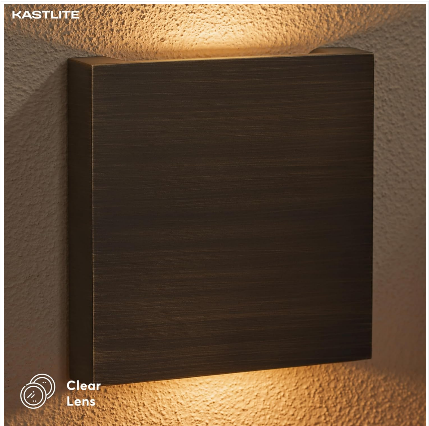
Figure 4: Detail of the clear lens and antique brass finish.