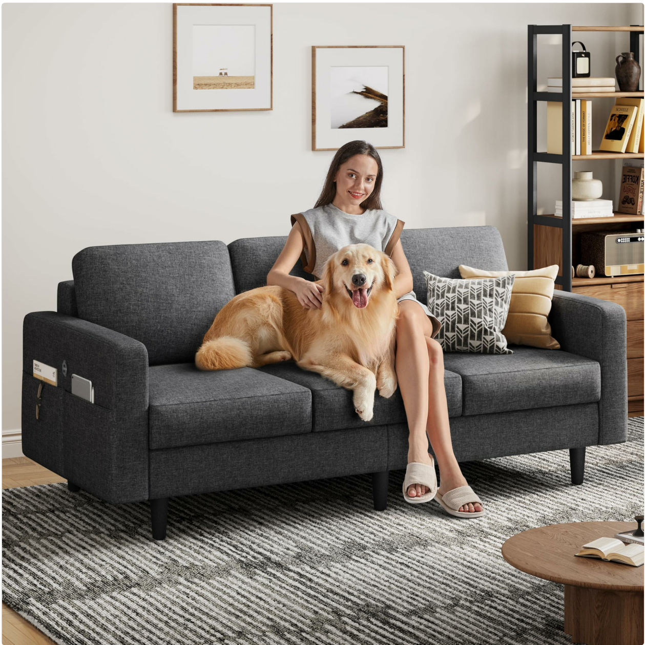
Image: The Yaheetech 3-Seater Sofa, featuring a modern design with dark gray fabric upholstery, positioned in a living room.