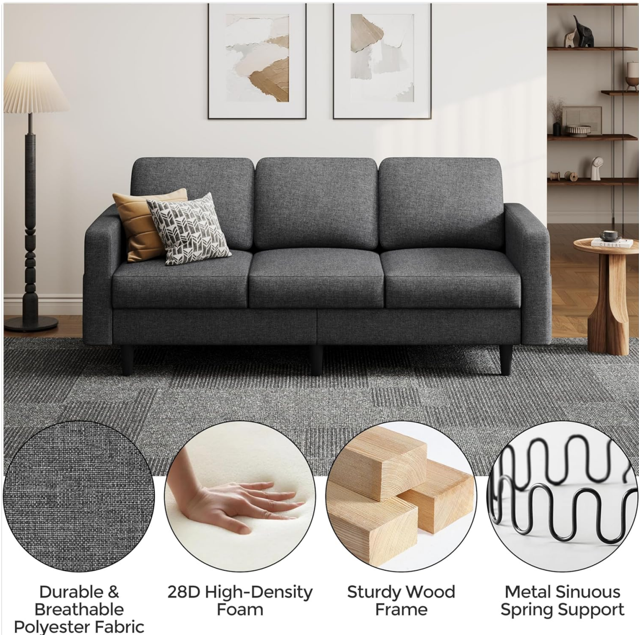
Image: An illustration detailing the internal construction of the sofa, showcasing the durable and breathable polyester fabric, 28D high-density foam, sturdy wood frame, and metal sinuous spring support system.