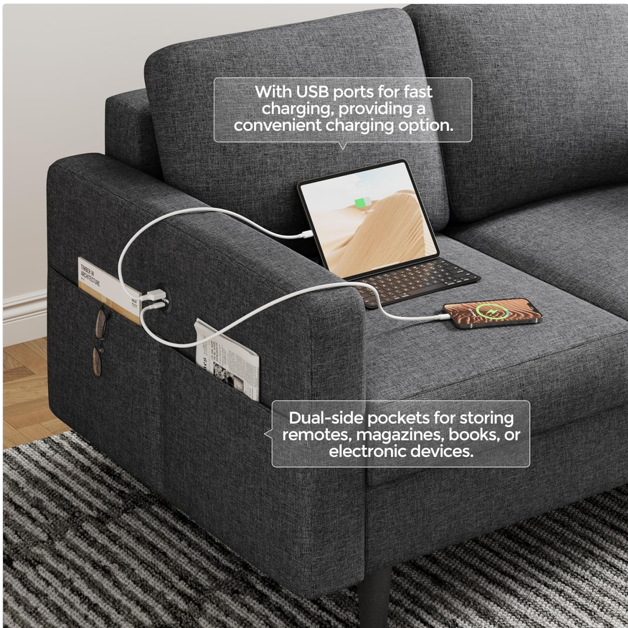
Image: A detailed view of the sofa's armrest, highlighting the integrated USB charging ports and dual-side storage pockets, with a laptop and smartphone connected for charging.