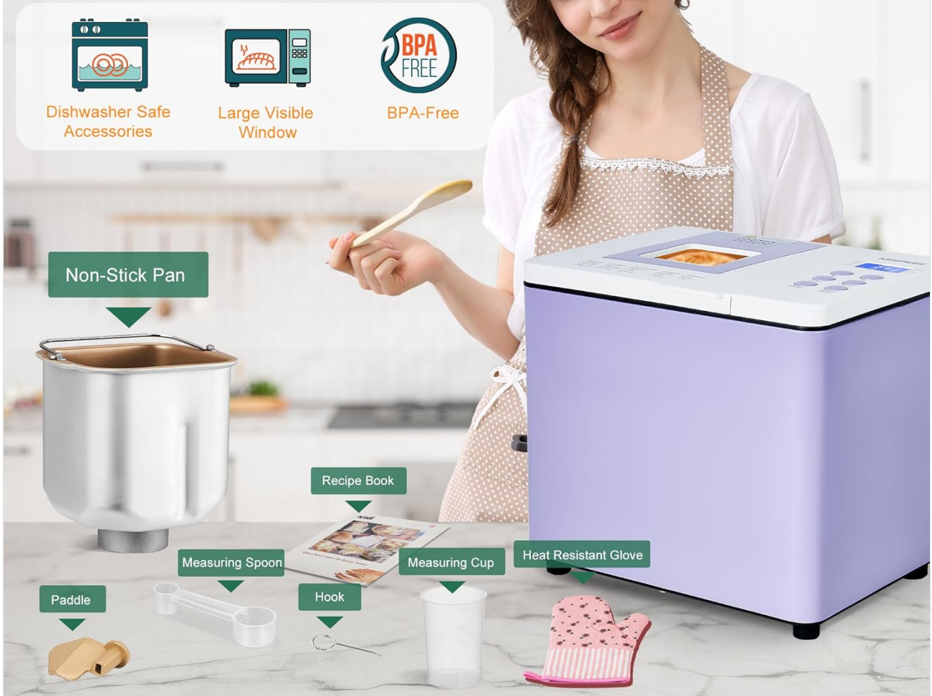
Image: A display of the accessories included with the KEEPEEZ Bread Maker, such as the non-stick pan, kneading paddle, measuring cup, measuring spoon, hook, heat-resistant glove, and recipe book.