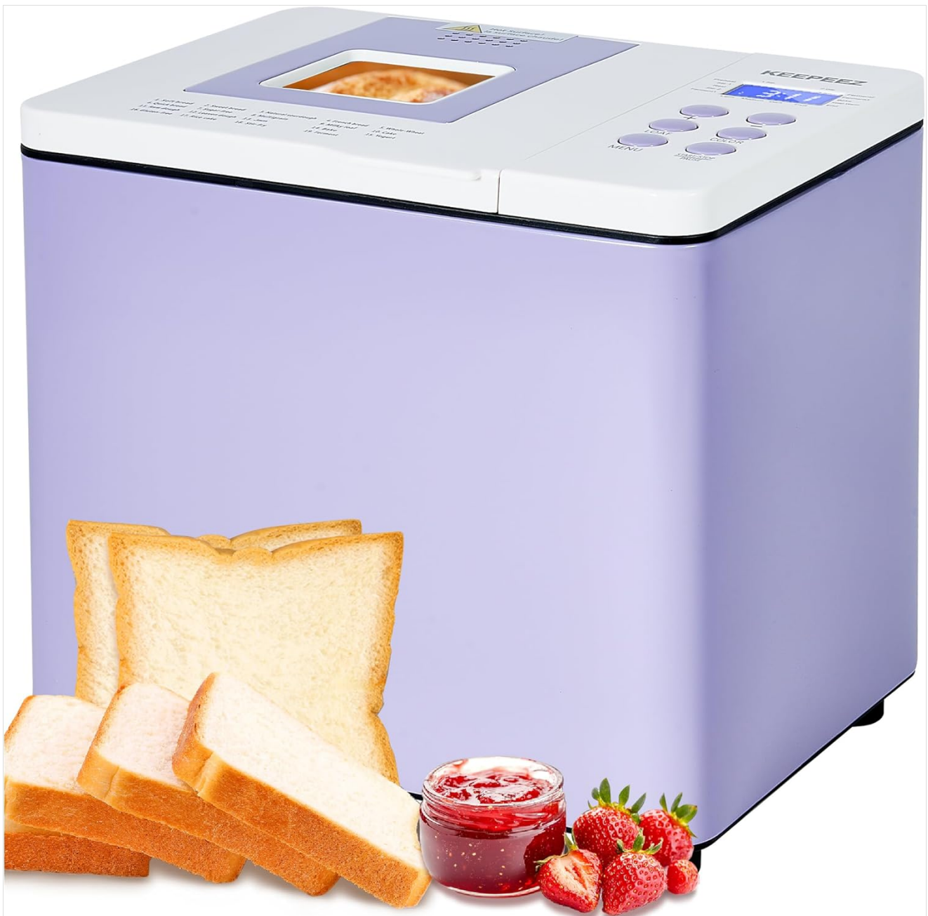
Image: The KEEPEEZ 19-in-1 Bread Maker Machine in purple, with slices of bread, jam, and strawberries. This image shows the overall design and typical output.