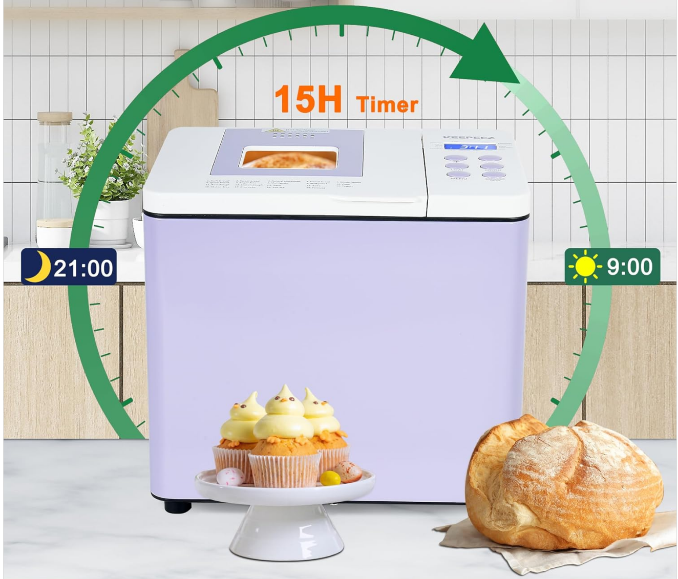
Image: Illustration showing the 15-hour delay timer function, allowing users to set the machine to finish baking at a desired time, such as for breakfast.

15 Min Power Interruption Recovery, Control Precise Baking Time