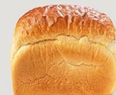
Image: Visual representation of the KEEPEEZ Bread Maker's master recipes, showing options for bread, jam, yogurt, and dough, along with the three crust colors (light, medium, dark) and two loaf sizes (1 LB, 1.5 LB).