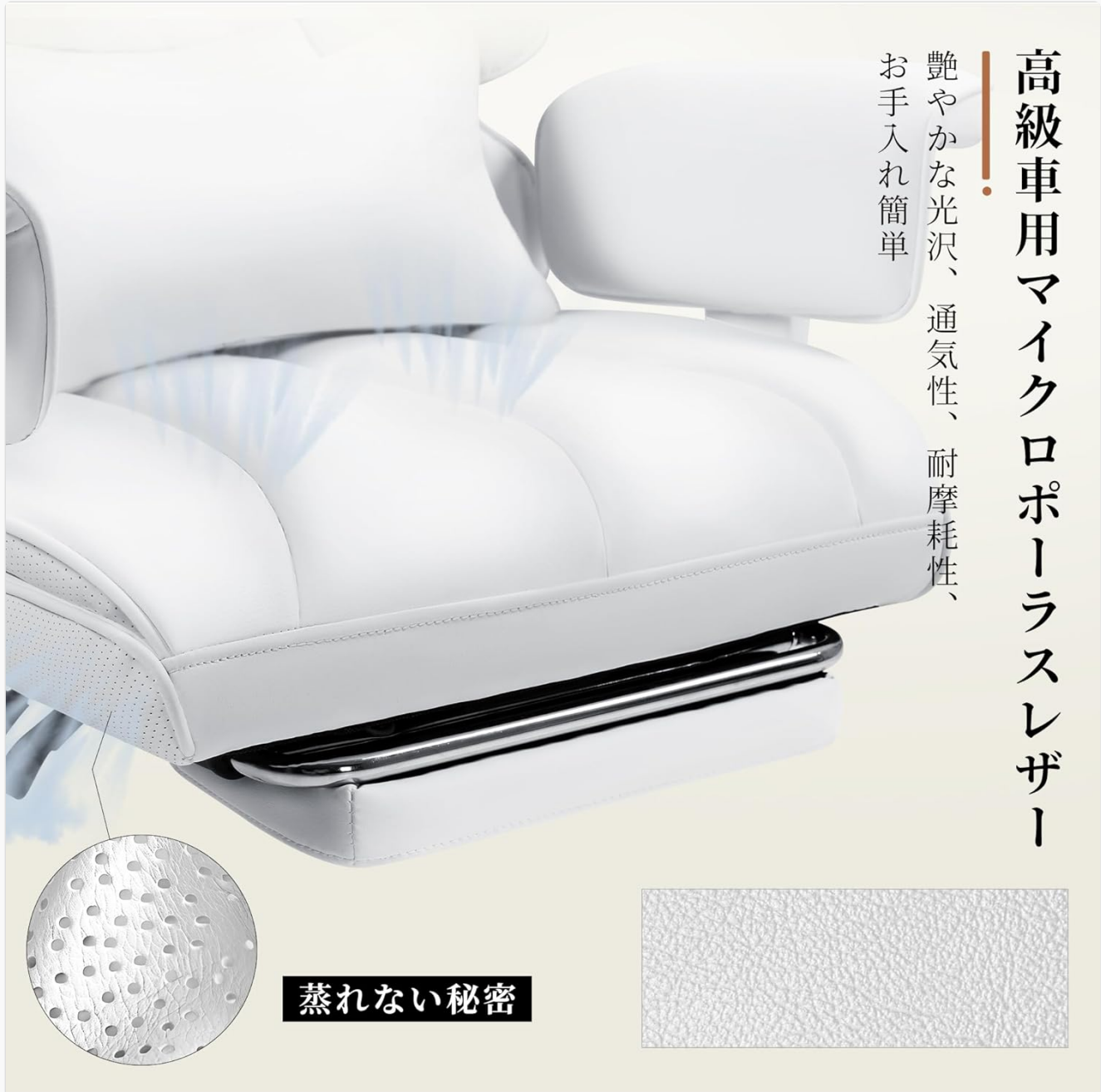
Figure 6: A detailed view of the chair's faux leather material, highlighting its texture and breathable design, which helps prevent stuffiness during extended use.