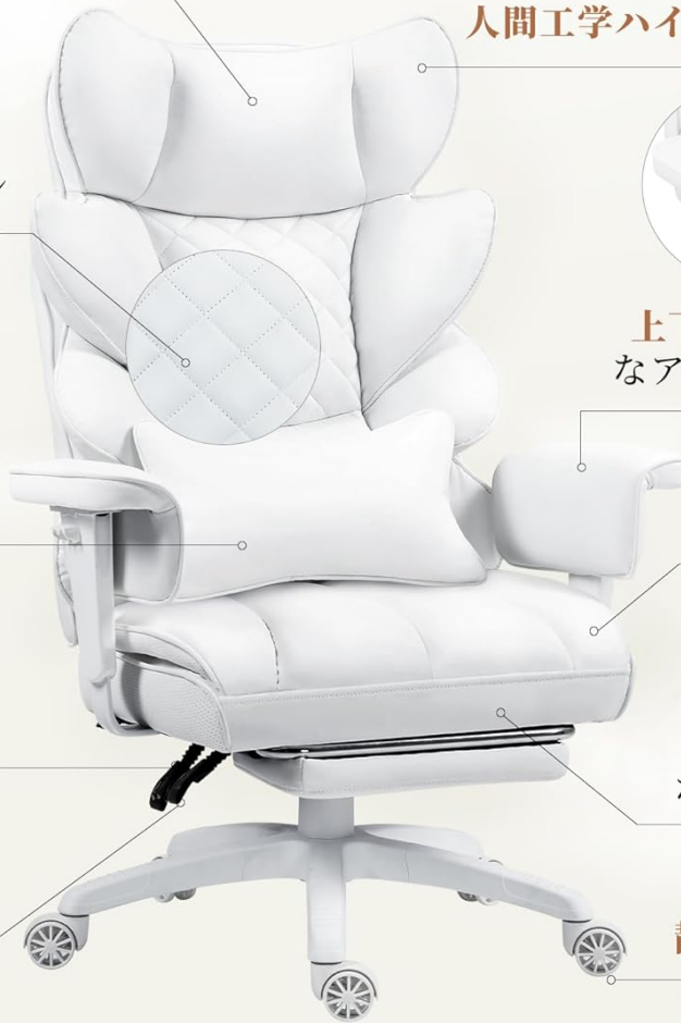
Figure 2: Overview of the chair's ergonomic design and adjustable features, including the high-back support, adjustable armrests, and retractable footrest.