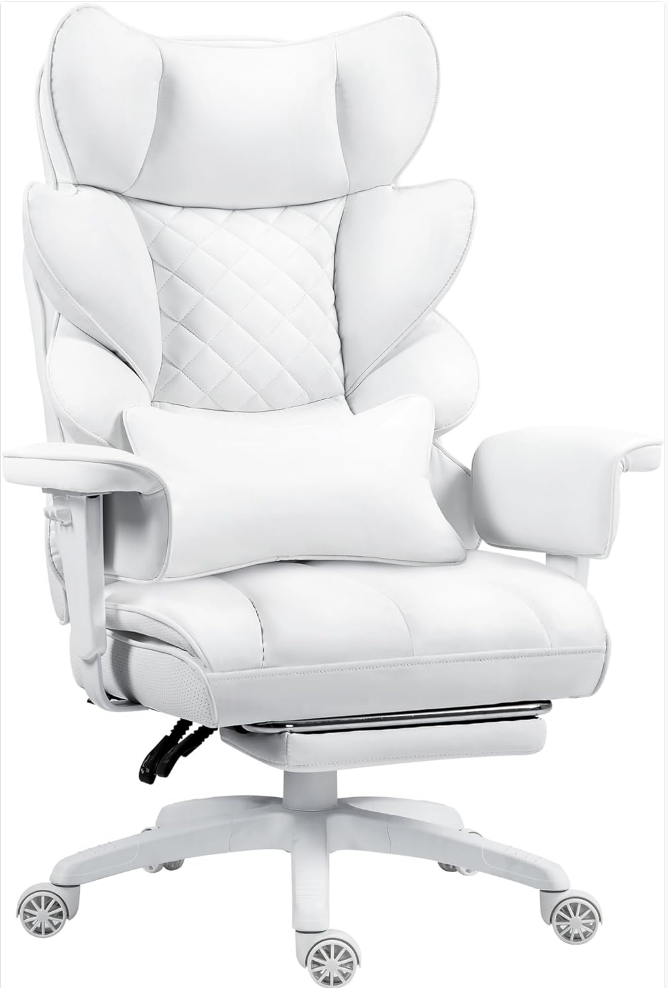
Figure 1: The Dowinx Gaming Chair LS-66BG1-04C in white, featuring a high back, adjustable armrests, and a lumbar pillow.