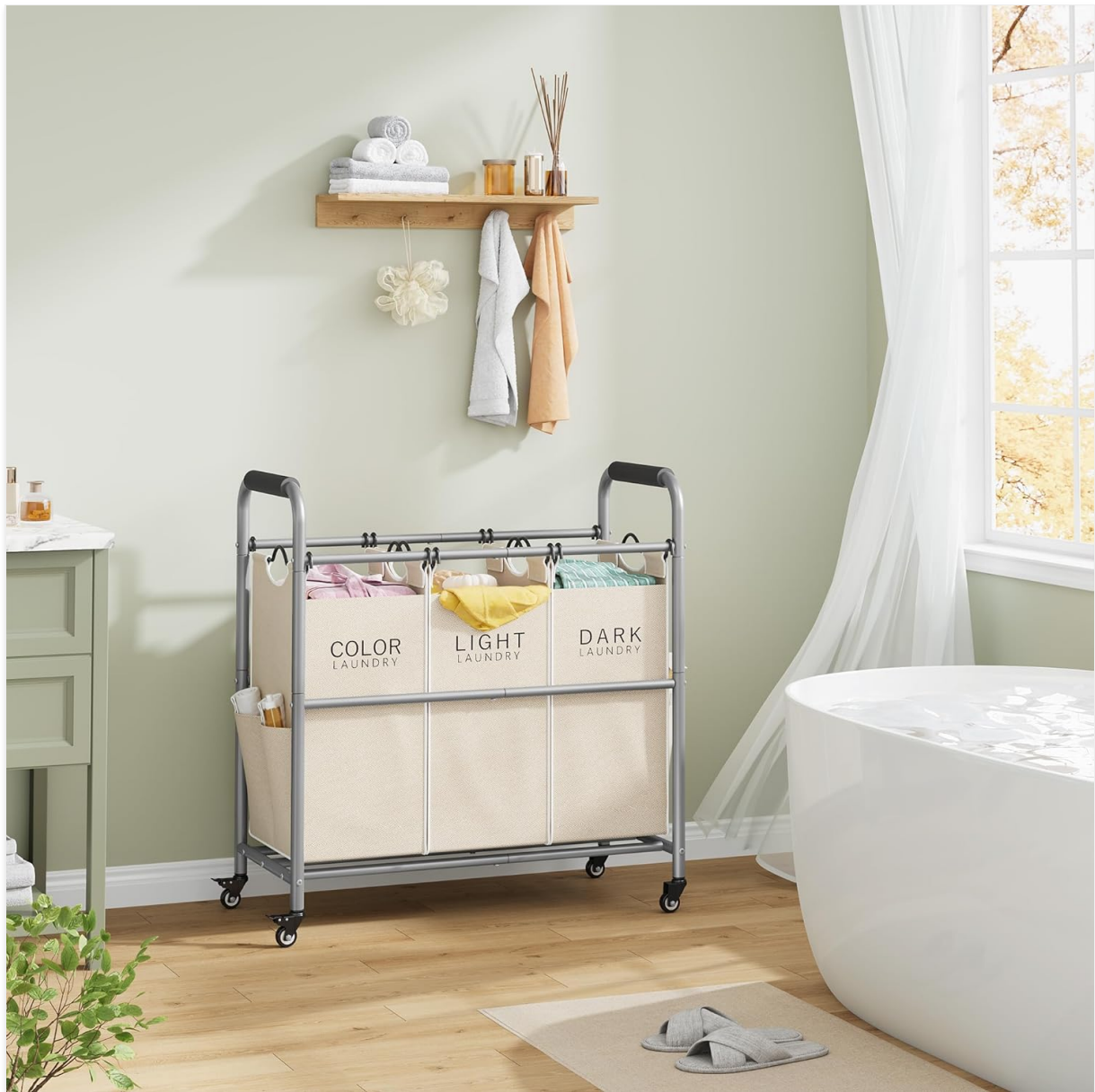
Figure 6: Lockable casters for stability.