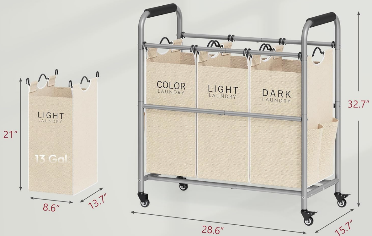
Figure 8: Convenient side pockets for small items.