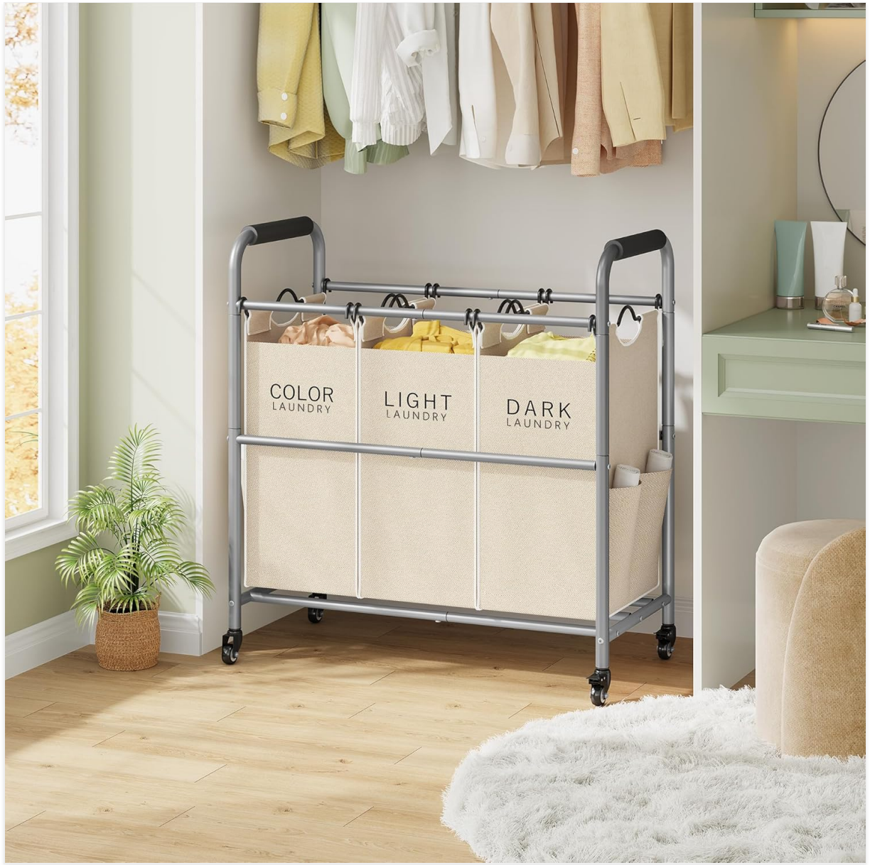
Figure 7: Foam-padded handles for comfortable grip.