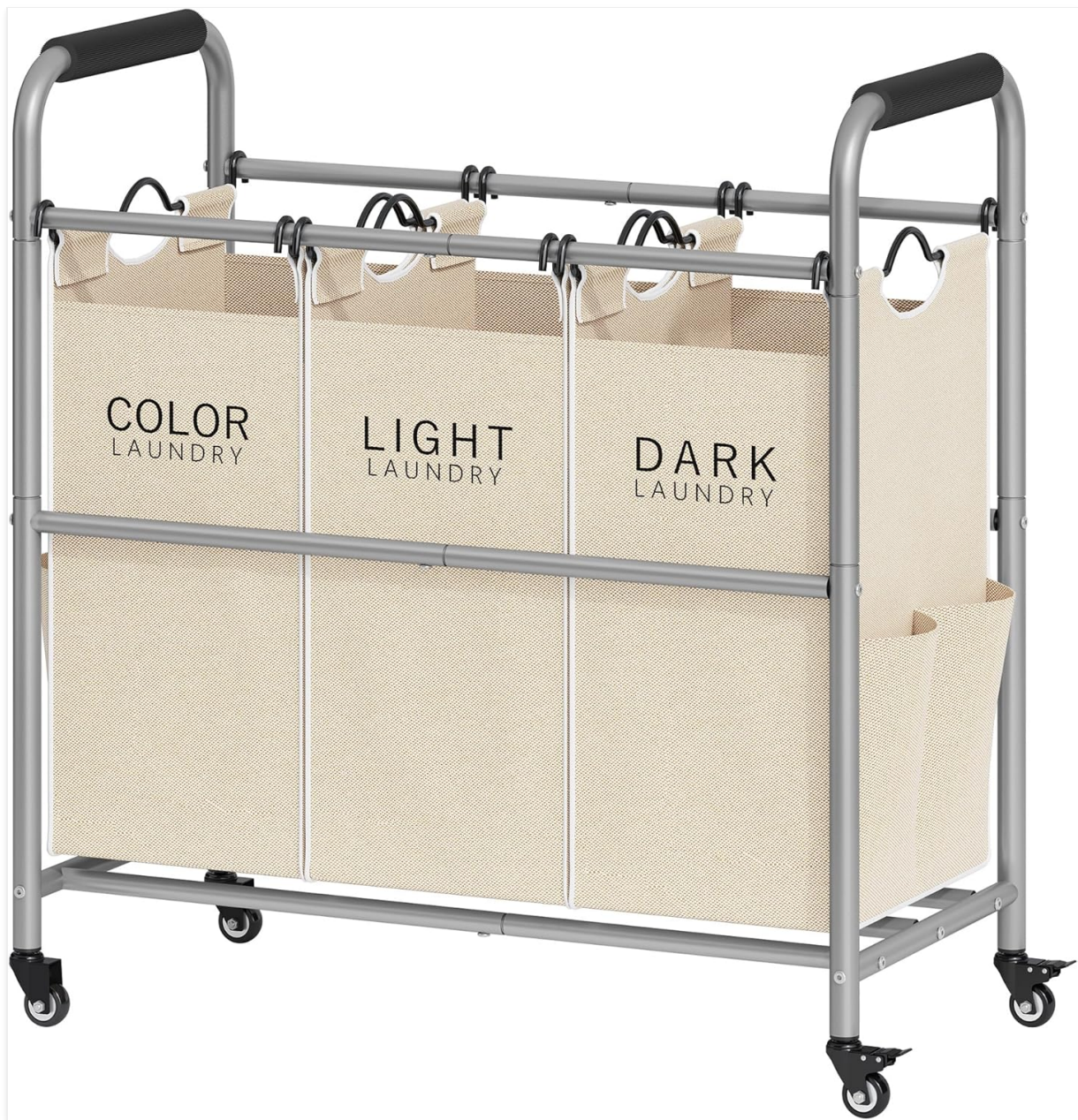
Figure 1: Tajsoon 3 Bag Laundry Sorter Cart in use.