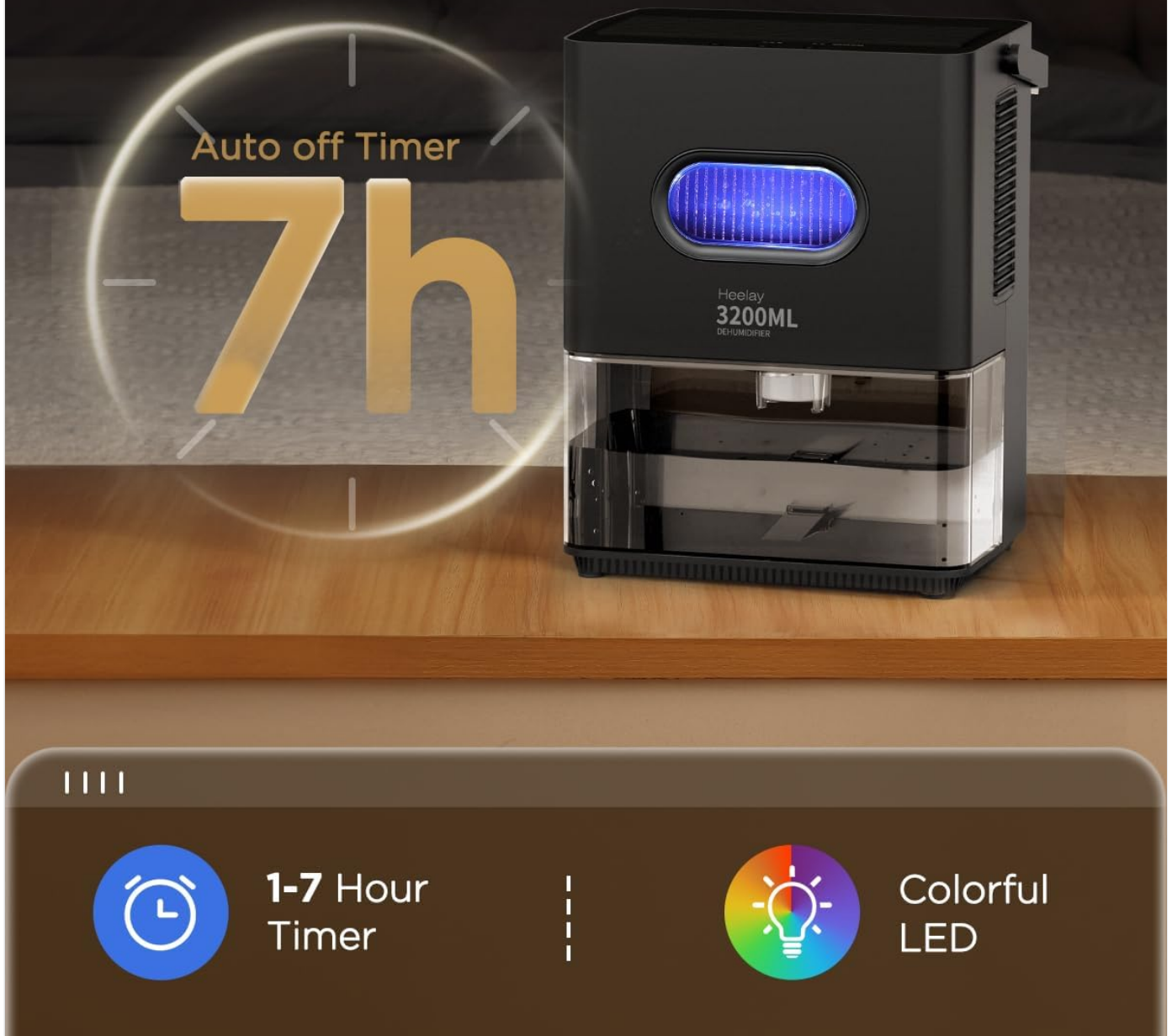
Figure 4.2: Timer and Night Light Function. This image highlights the 1-7 hour timer and the colorful LED night light features of the dehumidifier.

Scheduled shutdown, convenient and worry-free