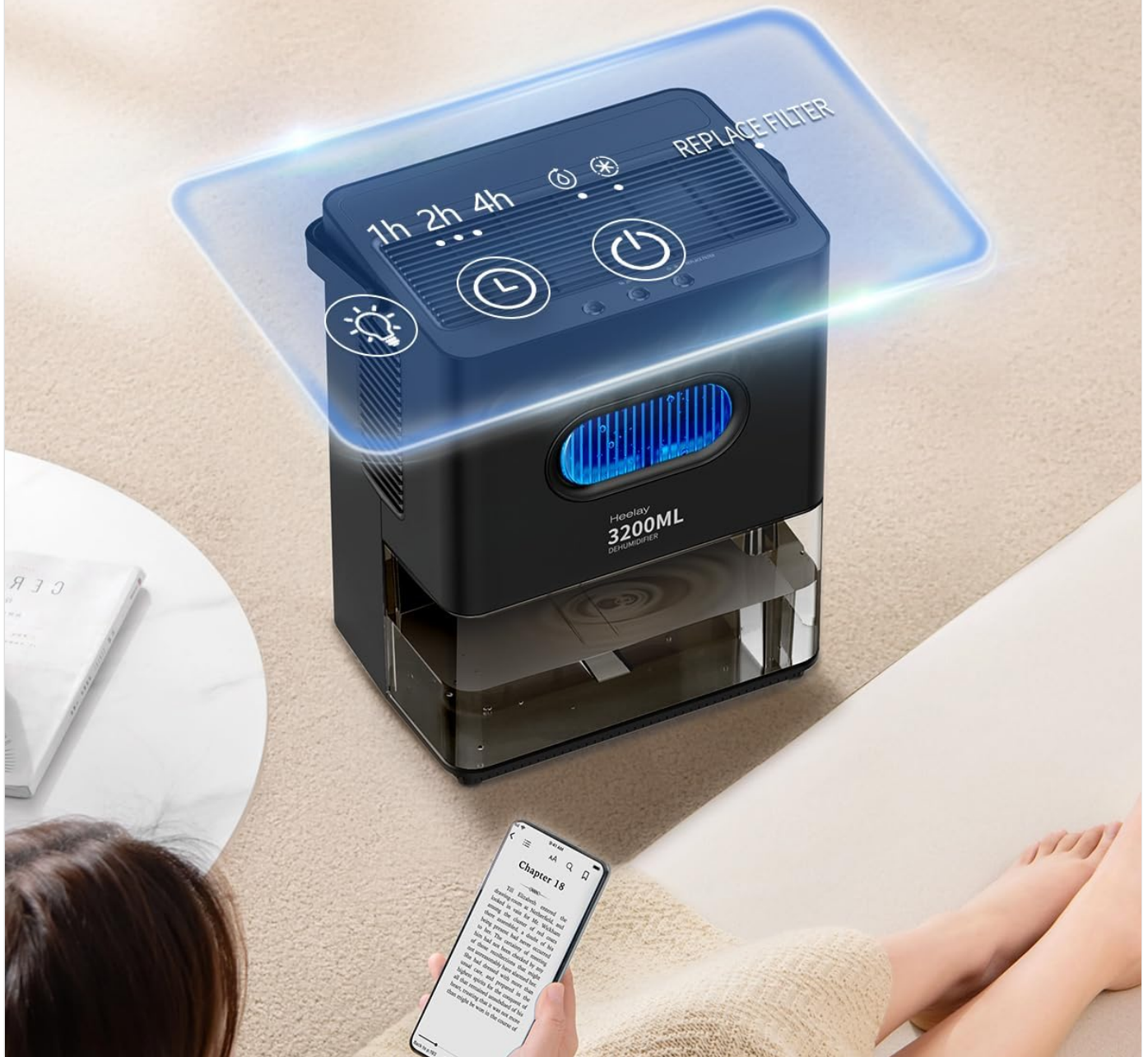
Figure 4.1: Multi-function Control Panel. This image displays the top control panel of the dehumidifier with clearly labeled buttons for various functions including night light, power, timer, and defrost.