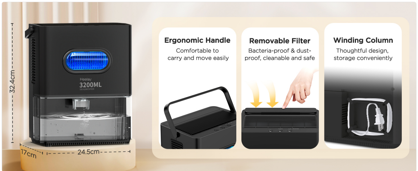
Figure 5.2: Ergonomic Handle, Removable Filter, and Cord Storage. This image details the physical features of the dehumidifier, including its dimensions, the convenient handle for portability, the removable filter for easy maintenance, and the integrated cord storage solution.