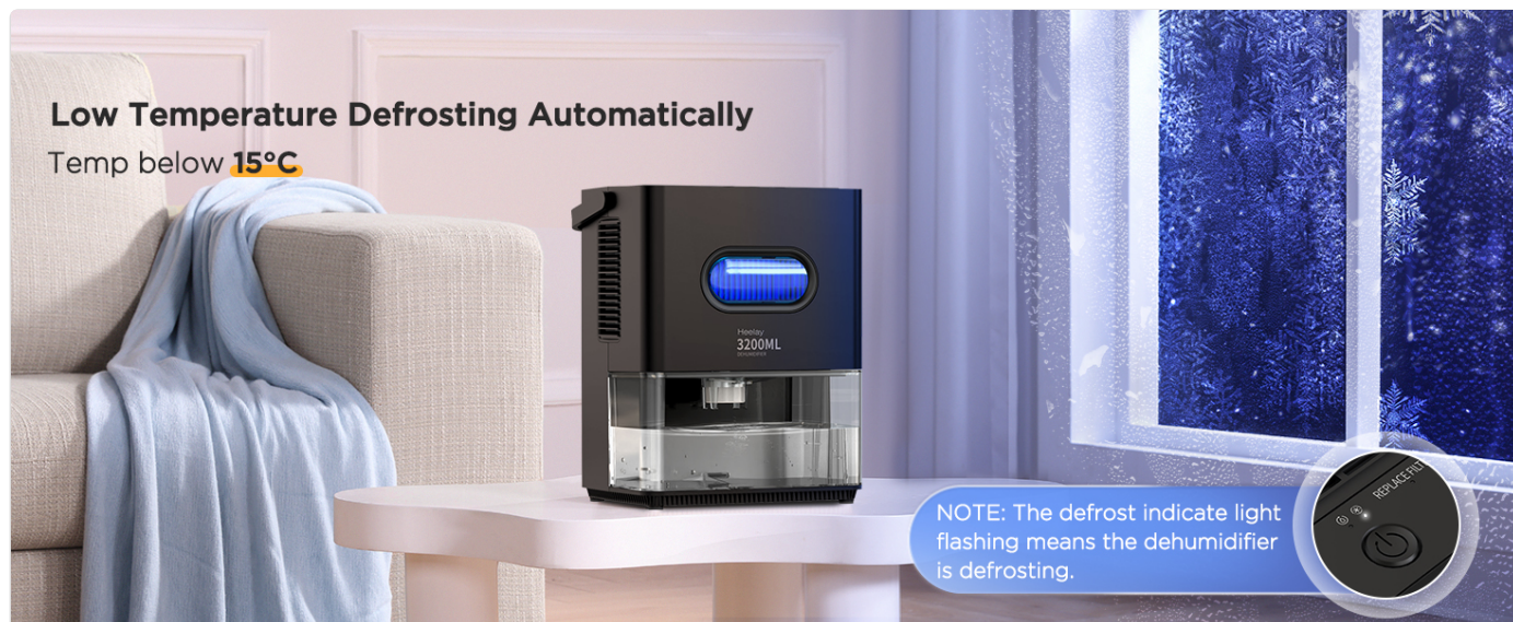
Figure 4.4: Low Temperature Defrosting. This image illustrates the dehumidifier's automatic defrost feature, which activates when the temperature drops below 15°C, with a note explaining the flashing defrost indicator light.

The dehumidifier features an automatic defrost function. If the ambient temperature drops below 15°C (59°F), the unit will automatically enter defrost mode to prevent ice buildup on the cooling elements. During this process, the defrost indicator light may flash. The unit will resume normal dehumidification once defrosting is complete.