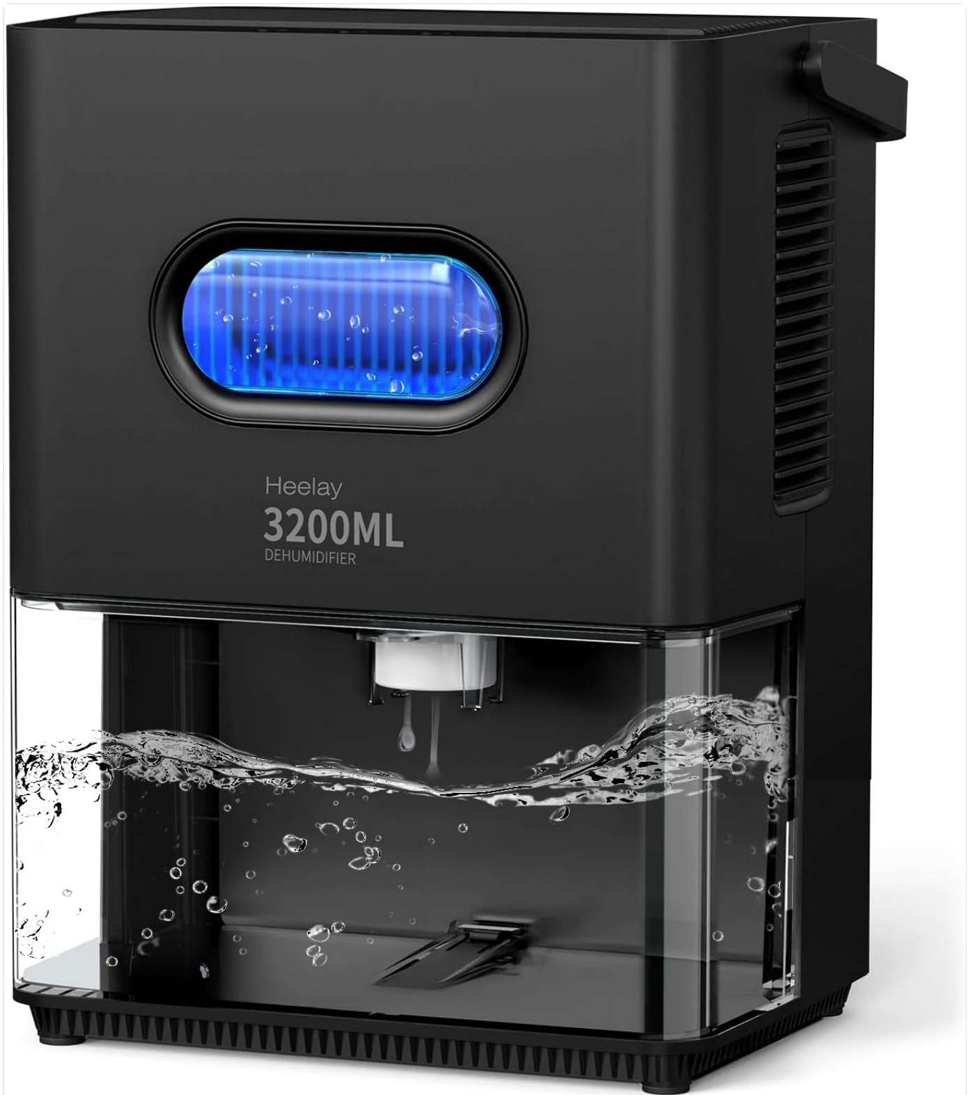
Figure 2.1: Heelay 3200ml Dehumidifier Model KW-CS02. This image shows the main product unit, a black dehumidifier with a transparent