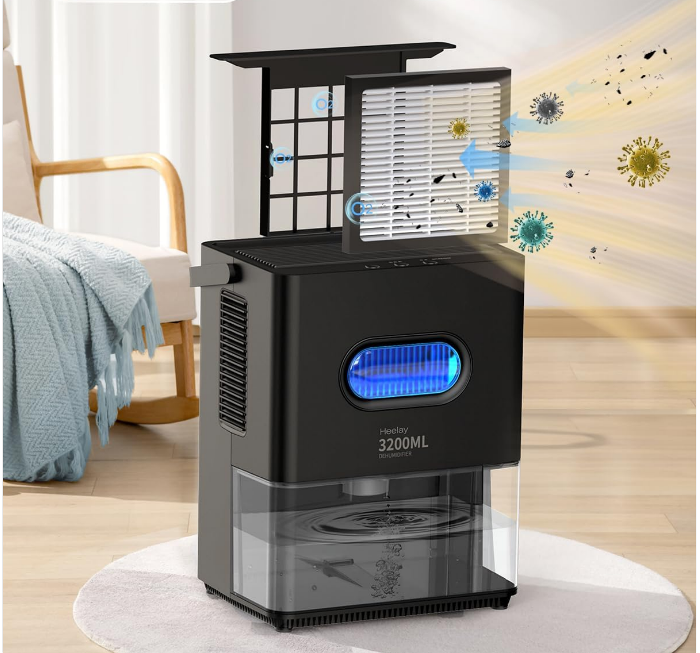
Figure 5.1: Replaceable HEPA Filter. This image shows the process of replacing the HEPA filter, highlighting its role in purifying the air by capturing dust and other particles.