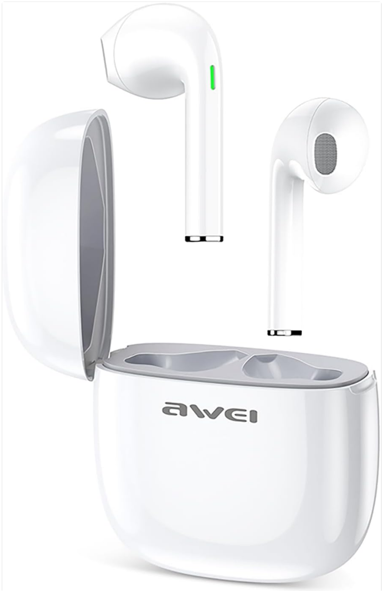
Image: AWEI T28 Wireless Earbuds shown inside their open charging case.