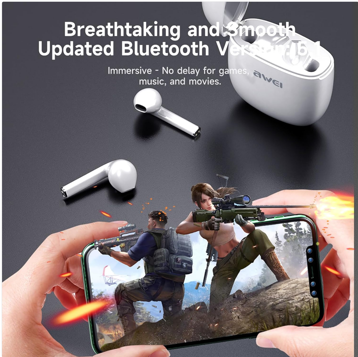
Image: AWEI T28 Earbuds and charging case, emphasizing the powerful battery life with 300 hours of standby time.

Immersive - No delay for games, music, and movies.