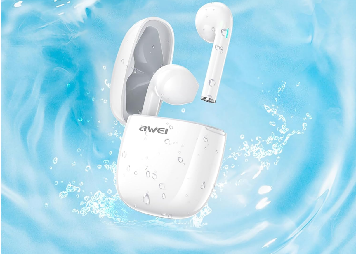
Image: AWEI T28 Earbuds shown with water splashes, illustrating their IPX6 water repellency, suitable for gym or outdoor use.

Effectively prevent the erosion from rain and sweat No matter in Gym or outdoors