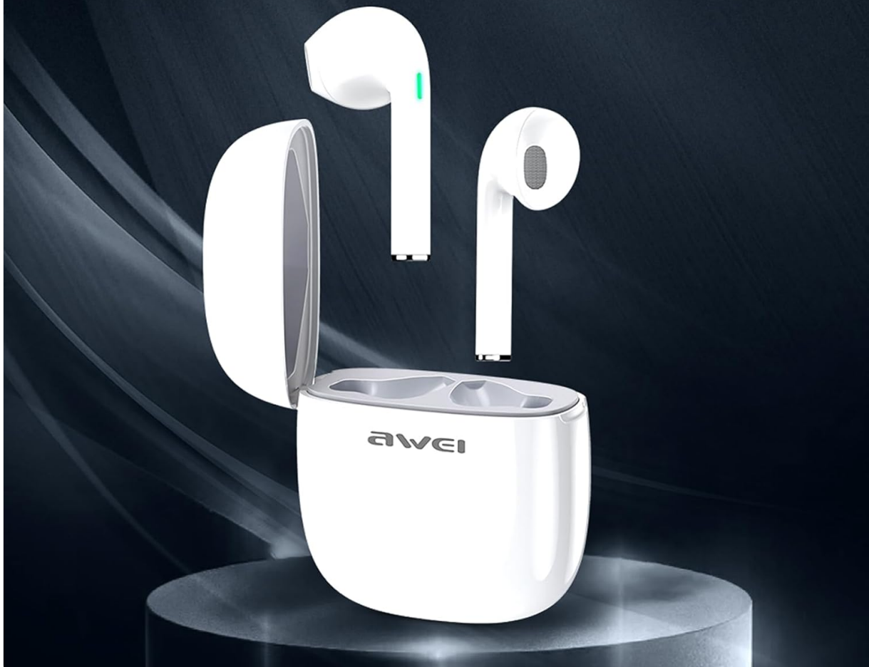
Image: AWEI T28 Earbuds and charging case, highlighting the automatic linking feature upon startup for both monaural and binaural modes.

Autolink after Startup Monaural & Binaural TWS