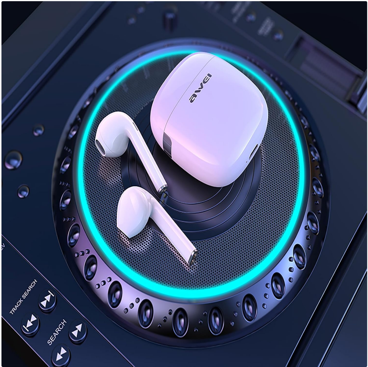
Image: AWEI T28 Earbuds on a turntable, illustrating the immersive audio experience and low latency provided by Bluetooth 5.3, ideal for games, music, and movies.