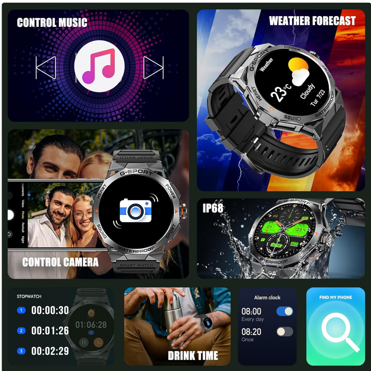
Image: A collage showing the smartwatch controlling music, acting as a camera remote, displaying weather, and featuring stopwatch, alarm, and 'find phone' functions.