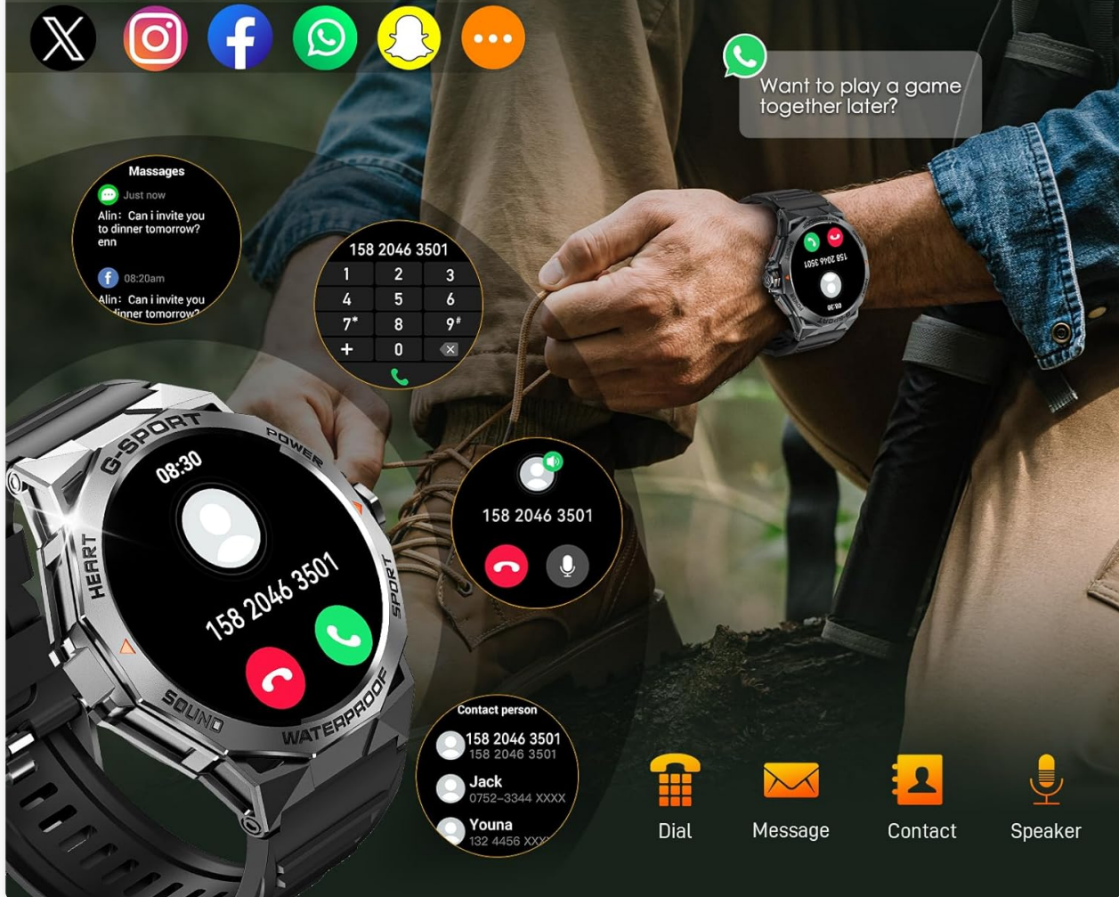
Image: The smartwatch displaying an incoming call and various app notification icons, illustrating its Bluetooth call and smart notification capabilities.

Never miss any important calls & messages