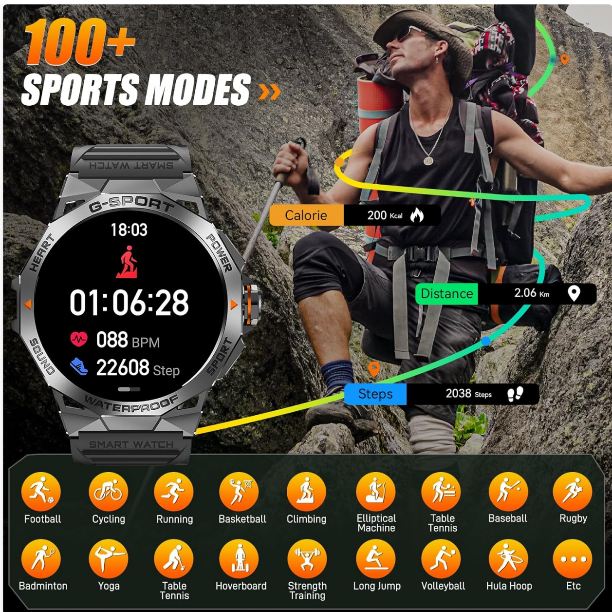
Image: A user hiking while the smartwatch displays workout metrics like calories, distance, and steps, alongside icons for various sports modes.