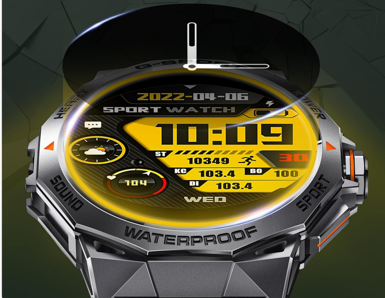
Image: Close-up of the 1.43-inch AMOLED display, showing a detailed watch face with time and activity data.