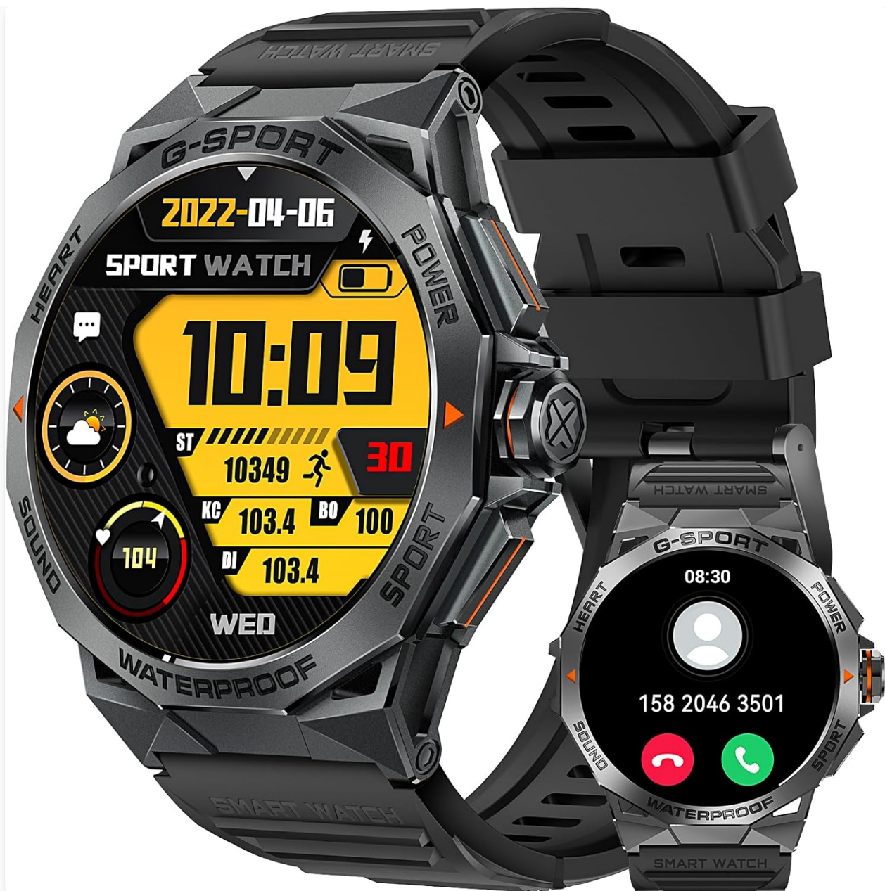
Image: EIGIIS K22 Smartwatch, showcasing its rugged design and vibrant display.