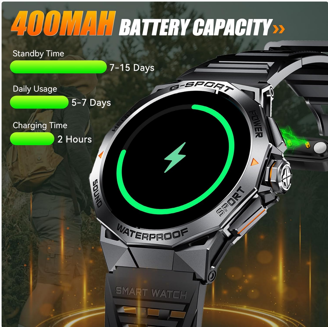
Image: The smartwatch displaying its charging status, indicating a 400mAh battery capacity and charging time.