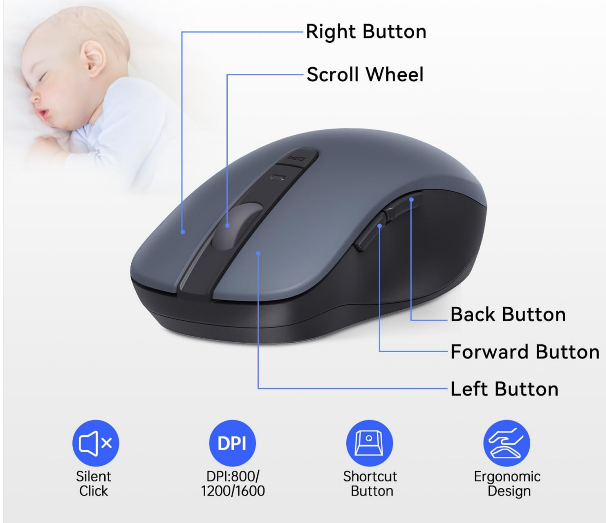
Figure 5.1: Detailed view of the ergonomic wireless mouse with its adjustable DPI and dedicated navigation buttons.