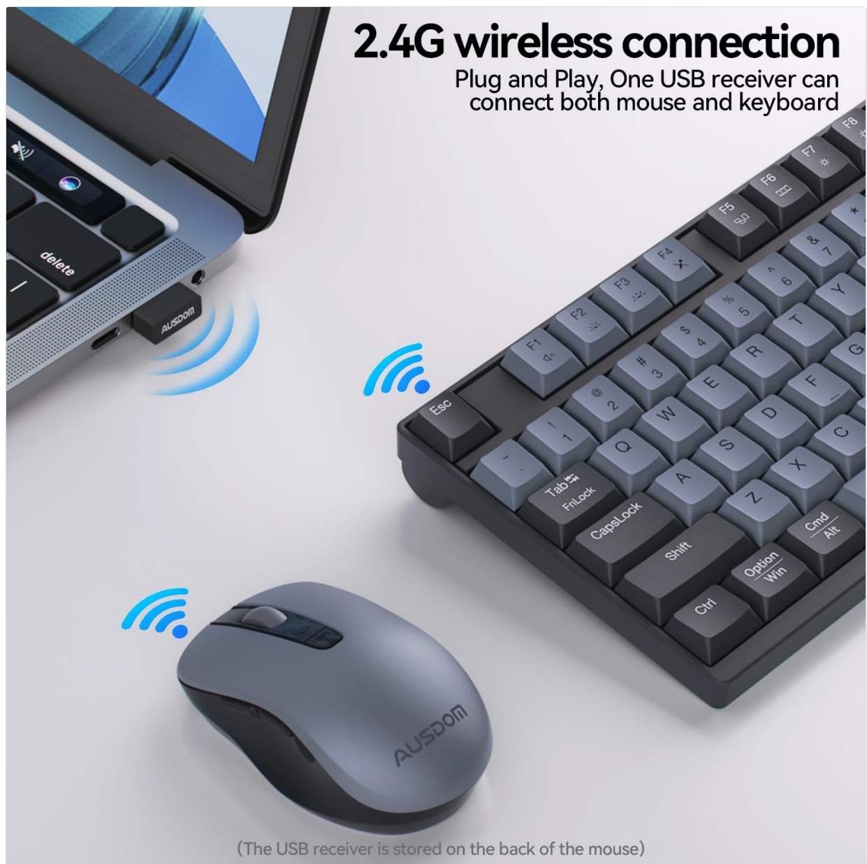
Figure 3.2: The 2.4G USB receiver connects both the keyboard and mouse to your computer. The receiver is stored in the mouse.

Your browser does not support the video tag.