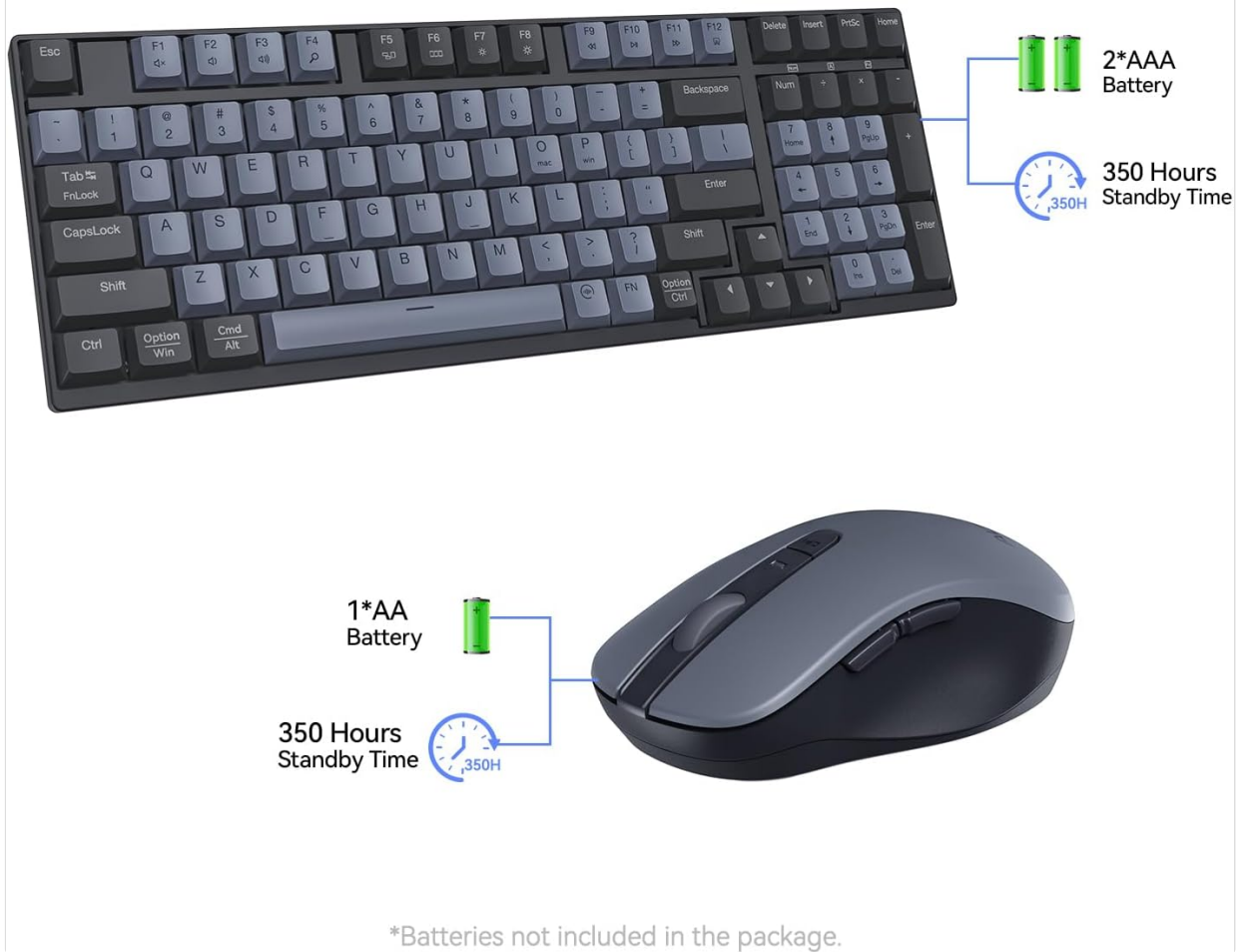
Figure 3.1: Battery installation for the keyboard (2x AAA) and mouse (1x AA).

No need to charge, battery can be replaced at any time