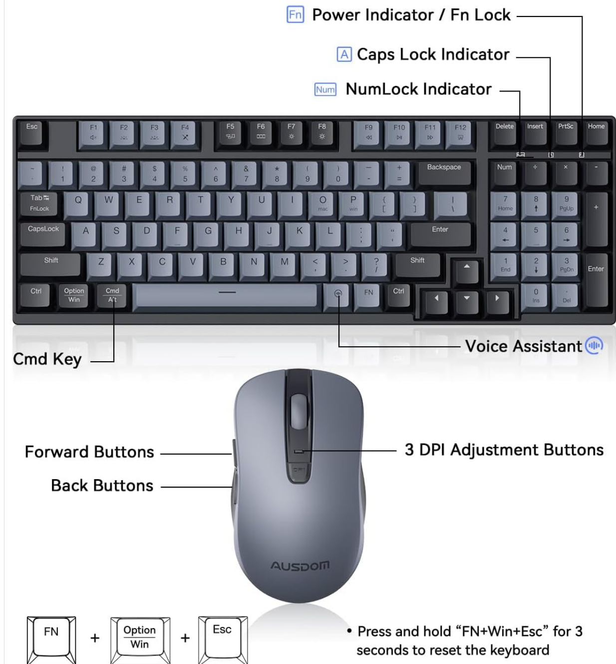
Figure 4.2: Overview of keyboard shortcuts and mouse buttons.