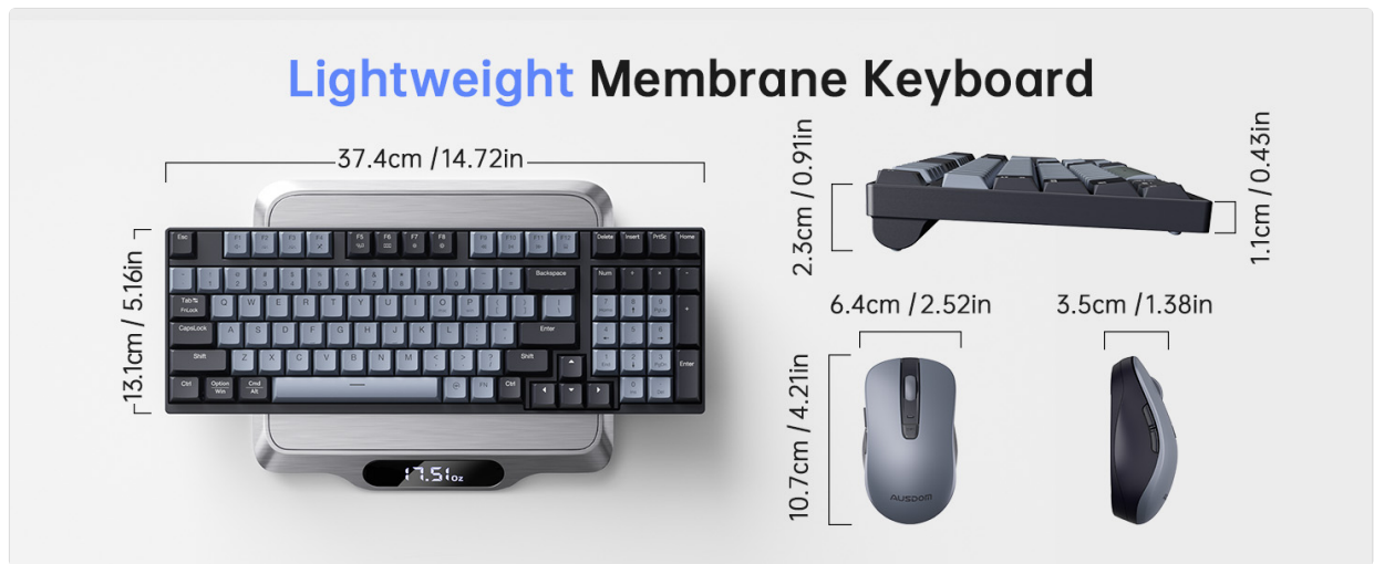
Figure 4.3: The keyboard is designed with a comfortable tilt angle to enhance typing experience.