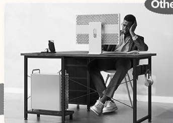
Image: Ample legroom and dedicated host stand.

A dedicated host stand is provided to keep your computer tower off the floor, protecting it from dust and improving airflow. The desk also offers generous legroom (approximately 100 cm) for comfortable use.