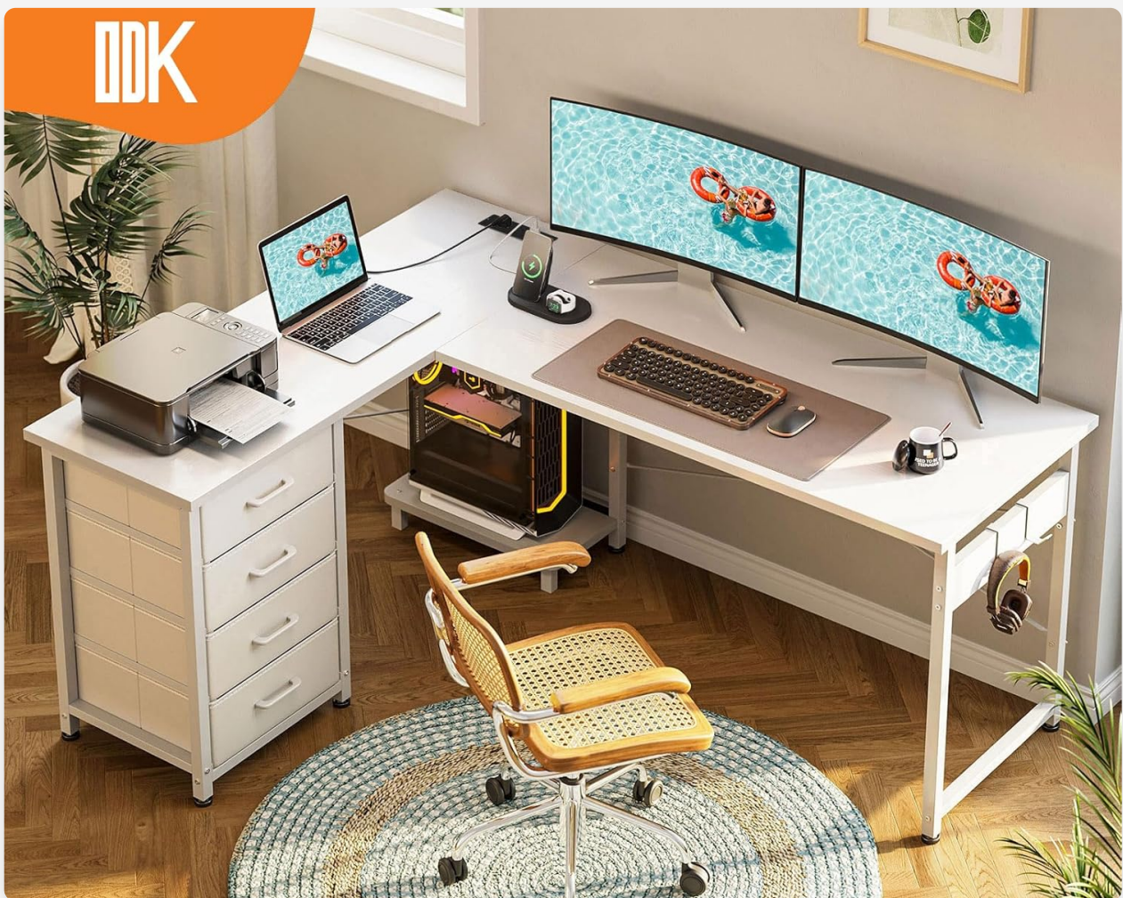
Image: ODK L-Shaped Reversible Computer Desk setup.