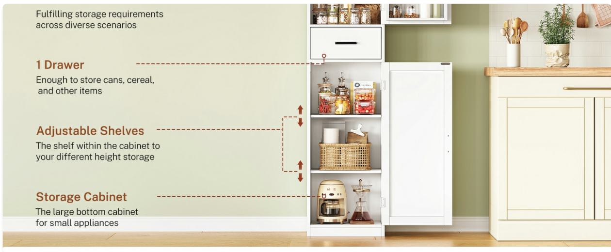
Image 1.2: The TEENFON Tall Storage Cabinet positioned in a living room, illustrating its adaptability as a storage solution in different home environments.