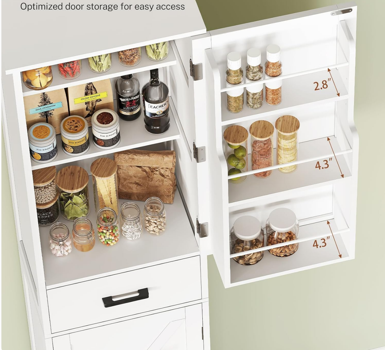
Image 5.2: A detailed view of the three door shelves, demonstrating their capacity for small items like spices and jars, optimizing storage space.