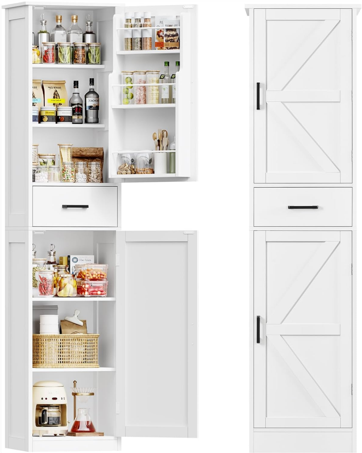
Image 1.1: The TEENFON Tall Storage Cabinet with its upper and lower doors open, showcasing the internal shelving and a central drawer. The cabinet is filled with various household items, demonstrating its storage capacity.