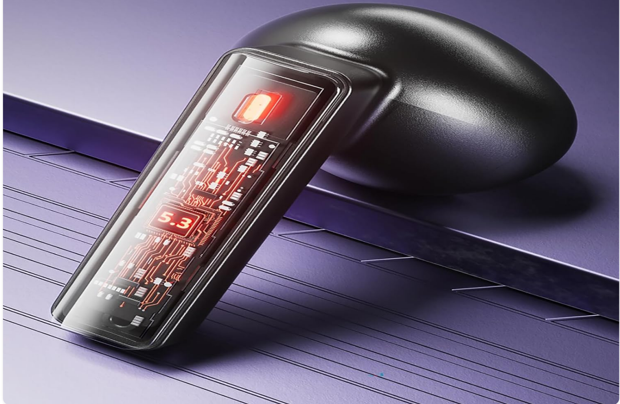
Image 4.1: Bluetooth 5.3 Technology Illustration. This image visually represents the advanced Bluetooth 5.3 chipset, emphasizing its smooth and stable connectivity.

Anti-electromagnetic interference, no jam or disconnection, automatic connection, high-speed transmission... which is applicable to the devices with iOS/Android/Harmony OS