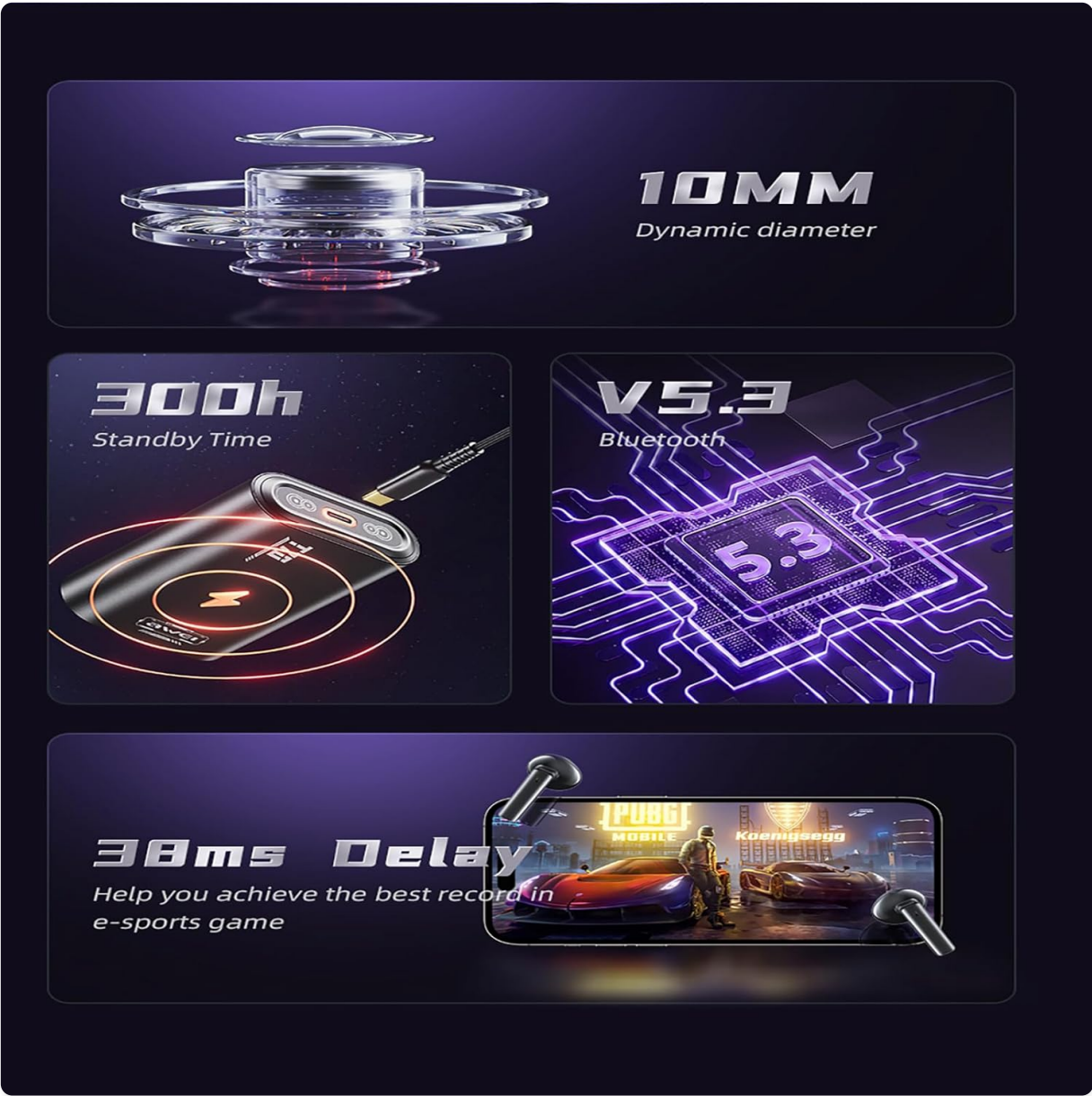
Image 8.1: AWEI T70ENC Key Features Summary. This image provides a visual summary of key specifications including 10mm dynamic diameter, 300h standby time, Bluetooth V5.3, and 38ms low delay.