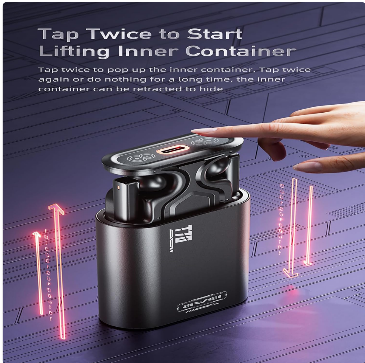
Image 5.1: Earbud Charging Case Interaction. This image illustrates the 'Tap Twice to Start Lifting Inner Container' feature, showing a finger interacting with the charging case to reveal the earbuds.

The AWEI T70ENC earbuds feature intuitive touch controls on each earbud for easy management of audio playback and calls.