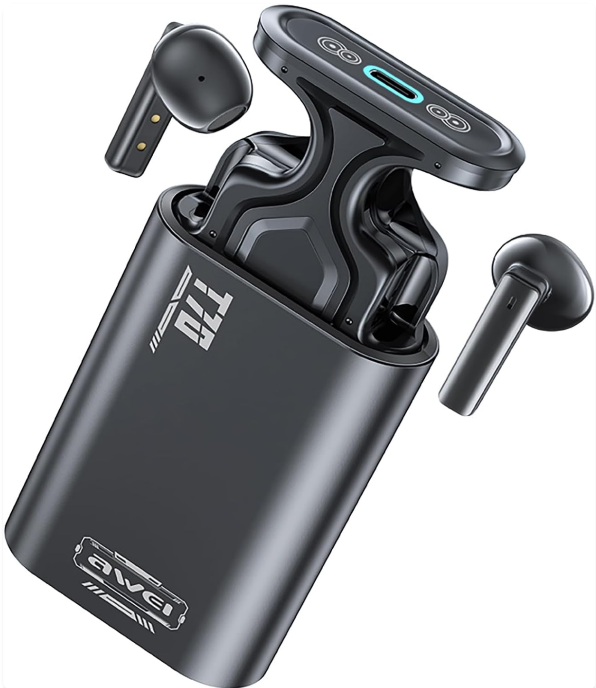
Image 3.1: AWEI T70ENC Wireless Earbuds and Charging Case. This image displays the black earbuds partially inserted into their sleek, black charging case, with one earbud fully visible outside the case.

The earbuds feature a compact, in-ear design for a secure and comfortable fit. The charging case is equipped with an indicator for battery status and a Type-C charging port.