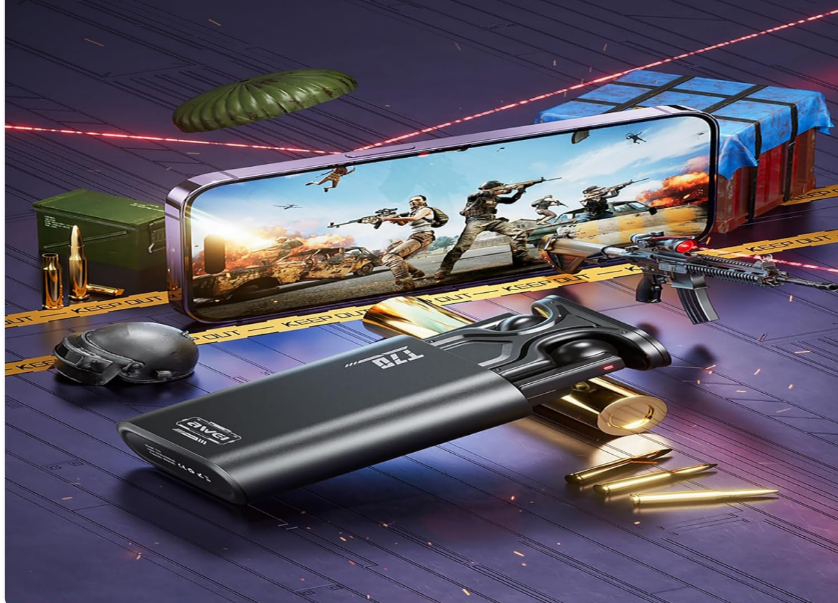
Image 5.3: Audio and Video Synchronization for Gaming. This image depicts the earbuds alongside a smartphone displaying a fast-paced game, illustrating the low latency feature for synchronized audio and video.

With 0.038s senseless delay, any trouble on the e-sports field can be perceived at the first time