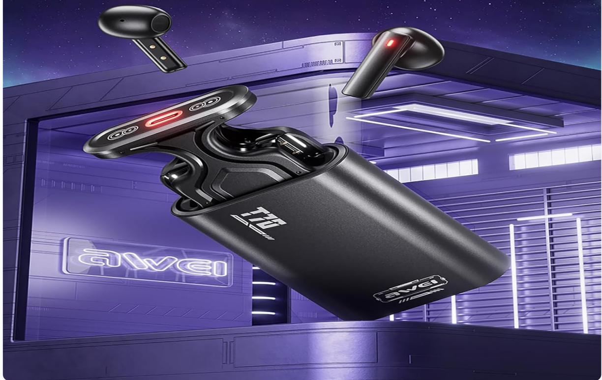
Image 3.2: AWEI T70ENC Earbuds and Charging Case Design. This image highlights the aesthetic integration of the earbuds and their charging case, showcasing their modern and sleek appearance.

A gradual & dazzling twinkle in the crowd