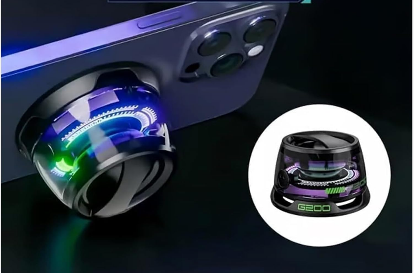
Image: The G200 speaker magnetically attached to a smartphone, illustrating its use as a phone stand and speaker combination.