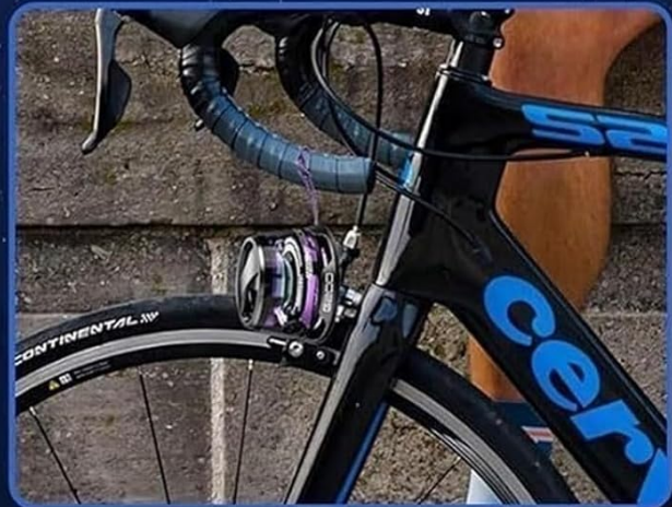
Image: Examples of the G200 speaker's magnetic attachment feature, demonstrating its versatility for outdoor and everyday use.