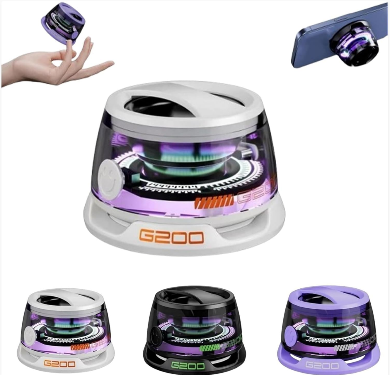
Image: The Generic G200 speaker in white, highlighting its compact size and magnetic attachment feature when used with a smartphone.

The Generic G200 is a compact, portable Bluetooth speaker featuring magnetic attachment capabilities and RGB lighting. It is designed for versatile use with various devices.