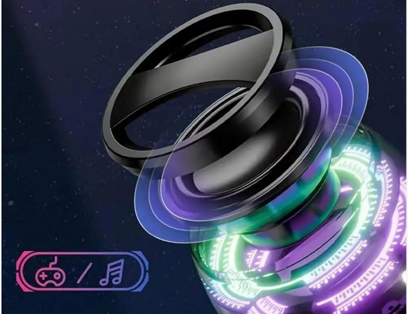
Image: A detailed view of the speaker's internal 40mm dynamic coil, indicating its sound output capabilities.

40mm high sensitivity assembled unit, clearly displaying sound details