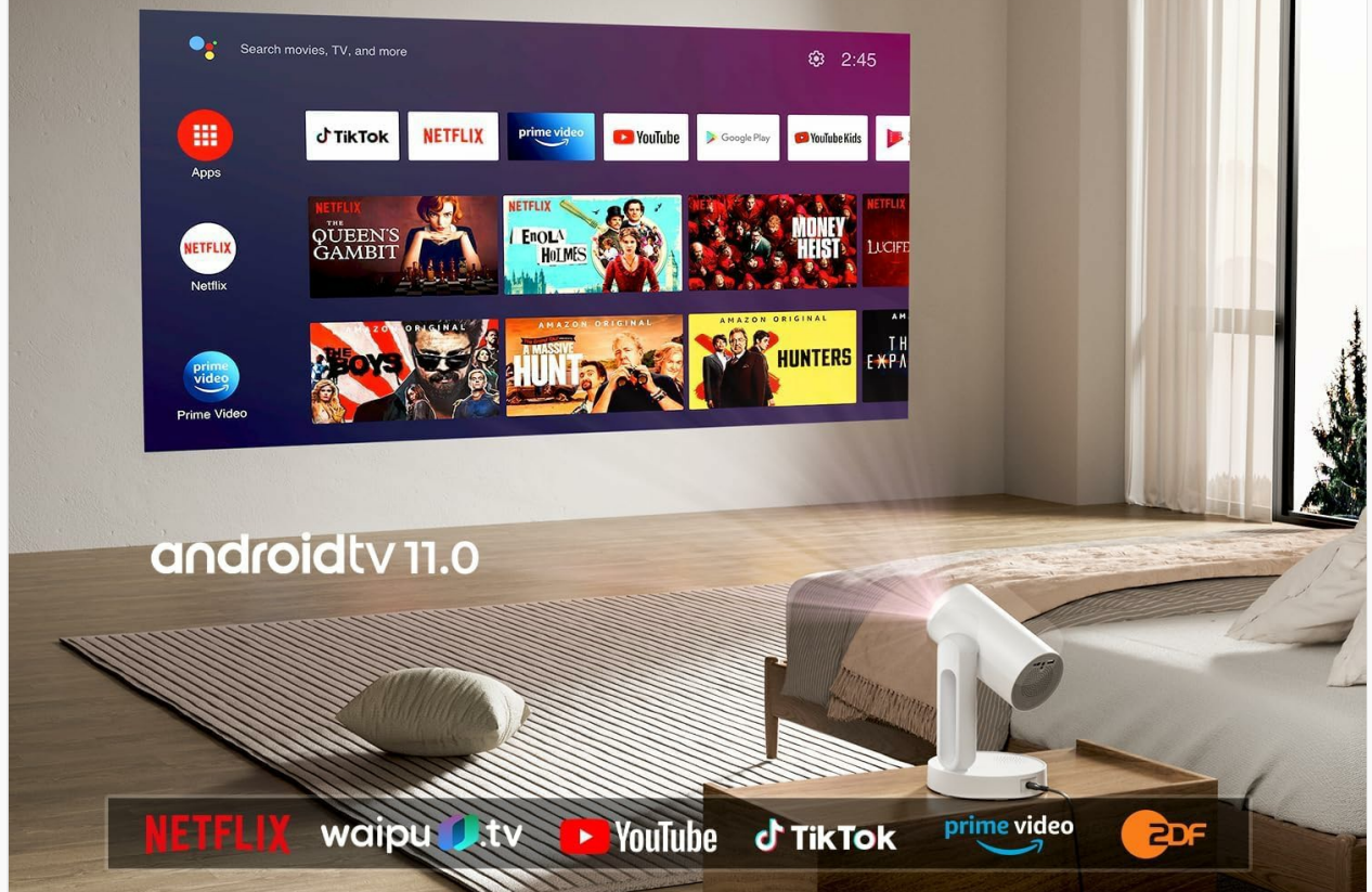
Image: The ETOE Starfish Projector displaying the Android TV interface, showing various streaming applications like Netflix, YouTube, and Prime Video.