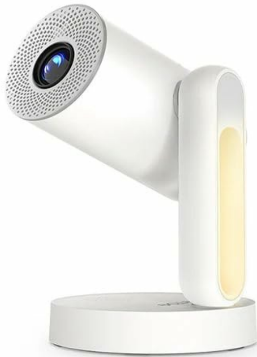
Image: Front view of the ETOE Starfish Projector, showcasing its compact and modern design.