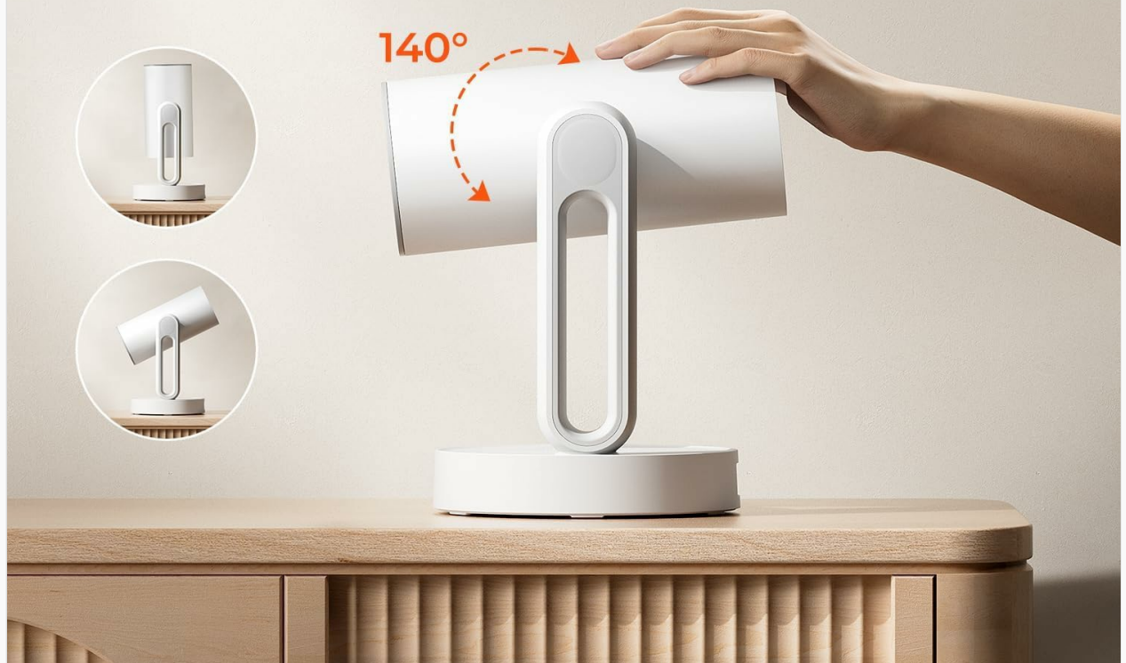
Image: The ETOE Starfish Projector shown rotating 140 degrees, illustrating its flexible projection capabilities.