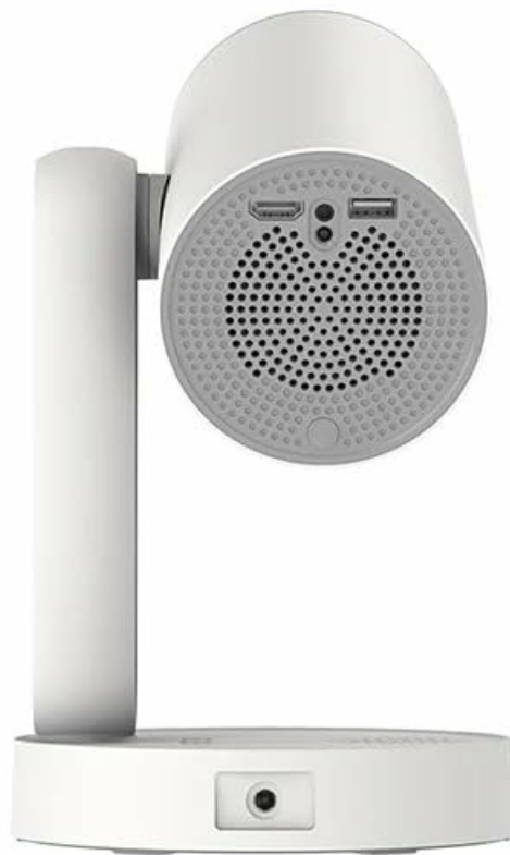
Image: Side view of the ETOE Starfish Projector, highlighting its connectivity ports including USB and HDMI.

The projector includes various ports for connectivity: