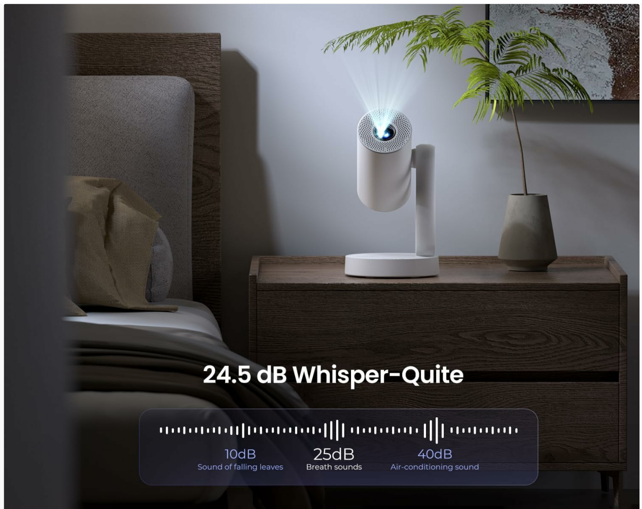
Image: Illustration comparing the low noise level of the ETOE Starfish Projector (24.5 dB) to common sounds.