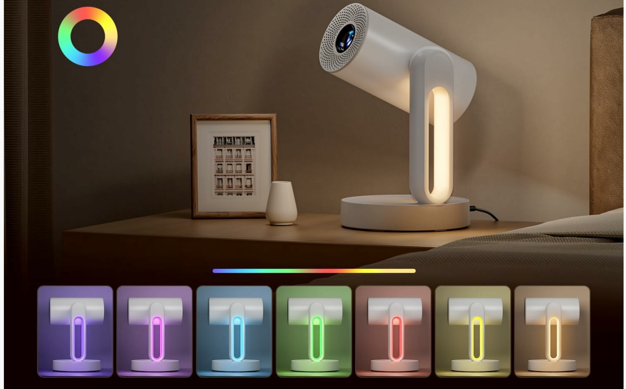
Image: The ETOE Starfish Projector displaying its touch-controlled ambient light feature with various color options.