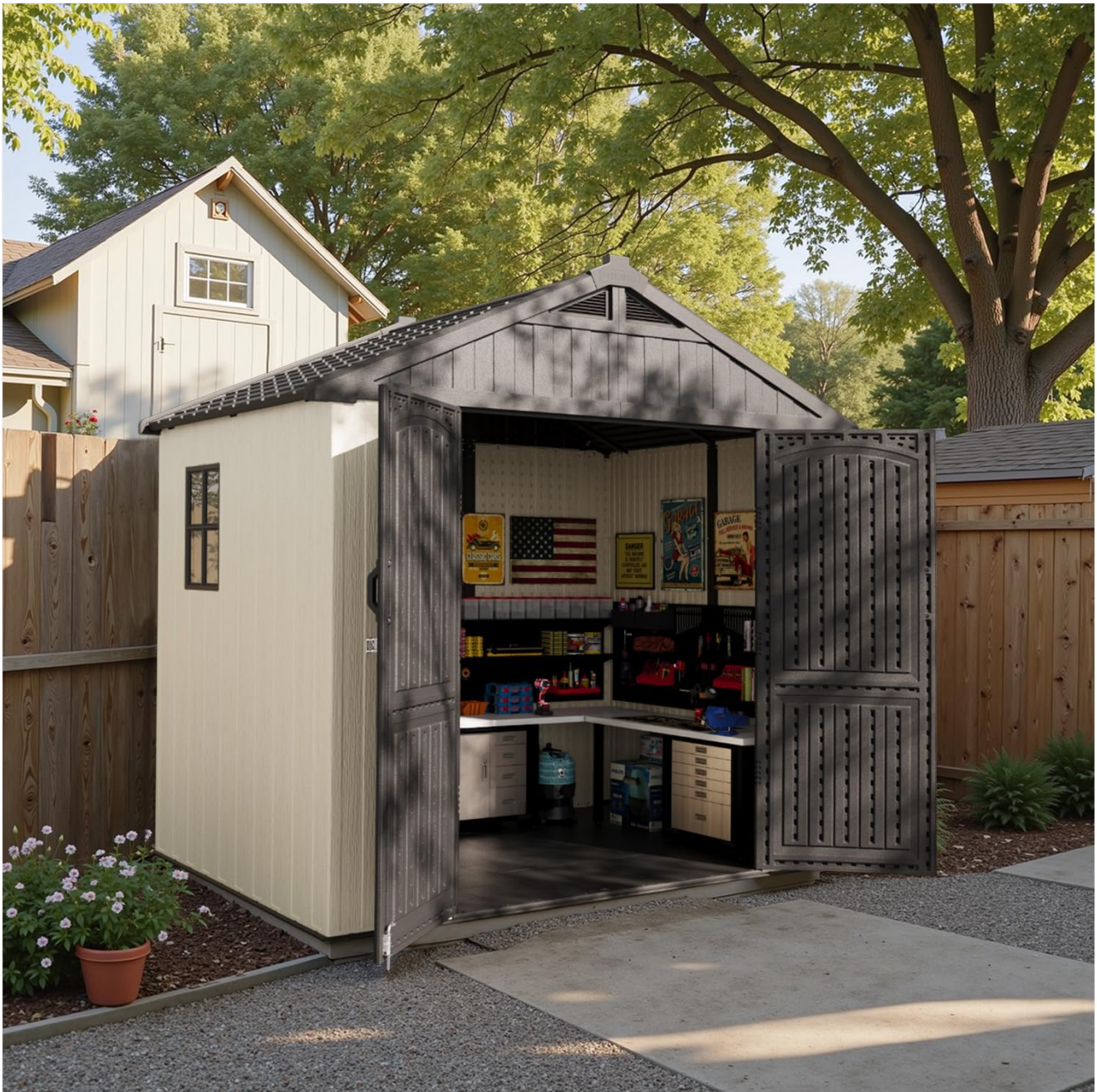
Image 1.1: Patiowell 8x6 FT Plastic Outdoor Storage Shed in a backyard setting, showcasing its design and size.