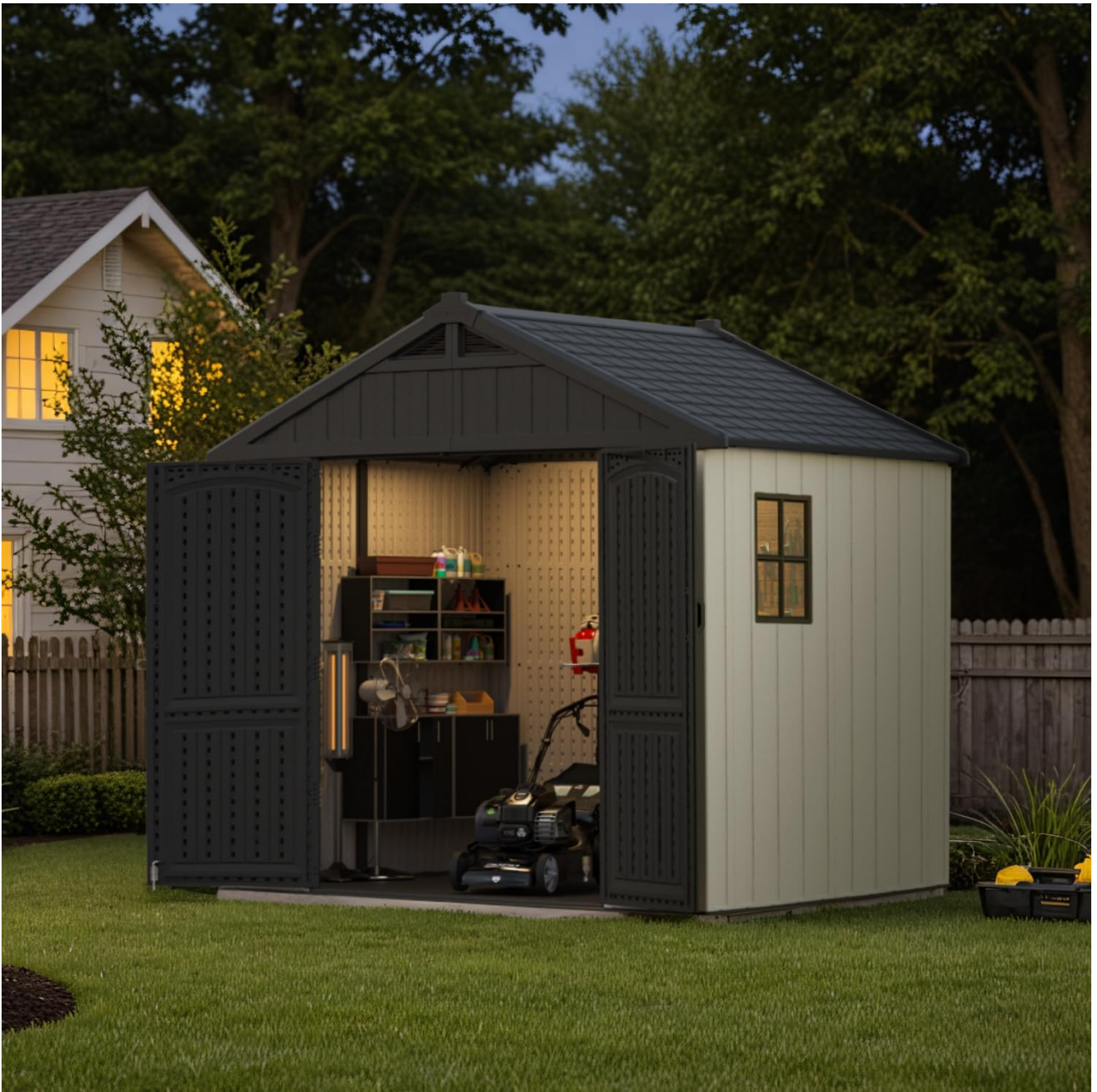
Image 3.1: Interior view of the Patiowell storage shed, demonstrating its spacious design for various items.