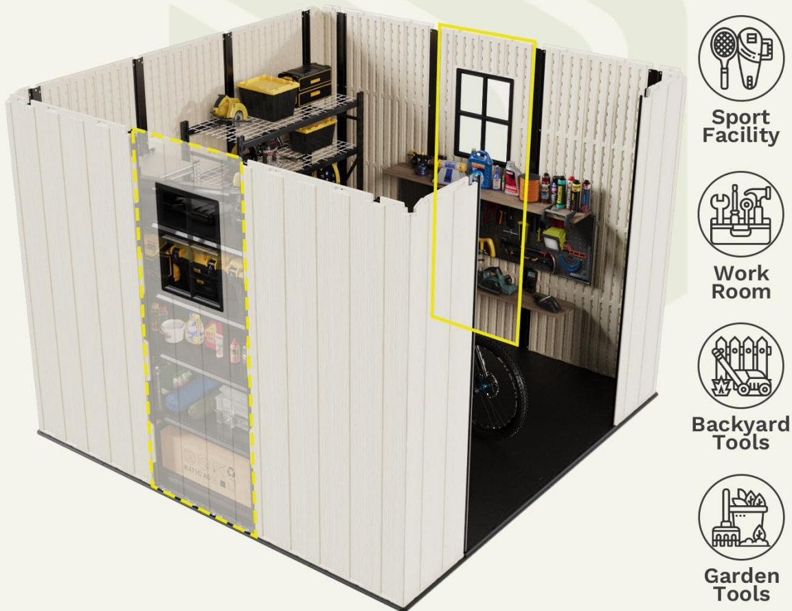
Image 3.2: Diagram illustrating how the window panel can be adjusted to different positions on the shed walls during assembly.

Customize your storage shed to fit your needs—place different types of items with ease and adjust the window orientation to your preference.