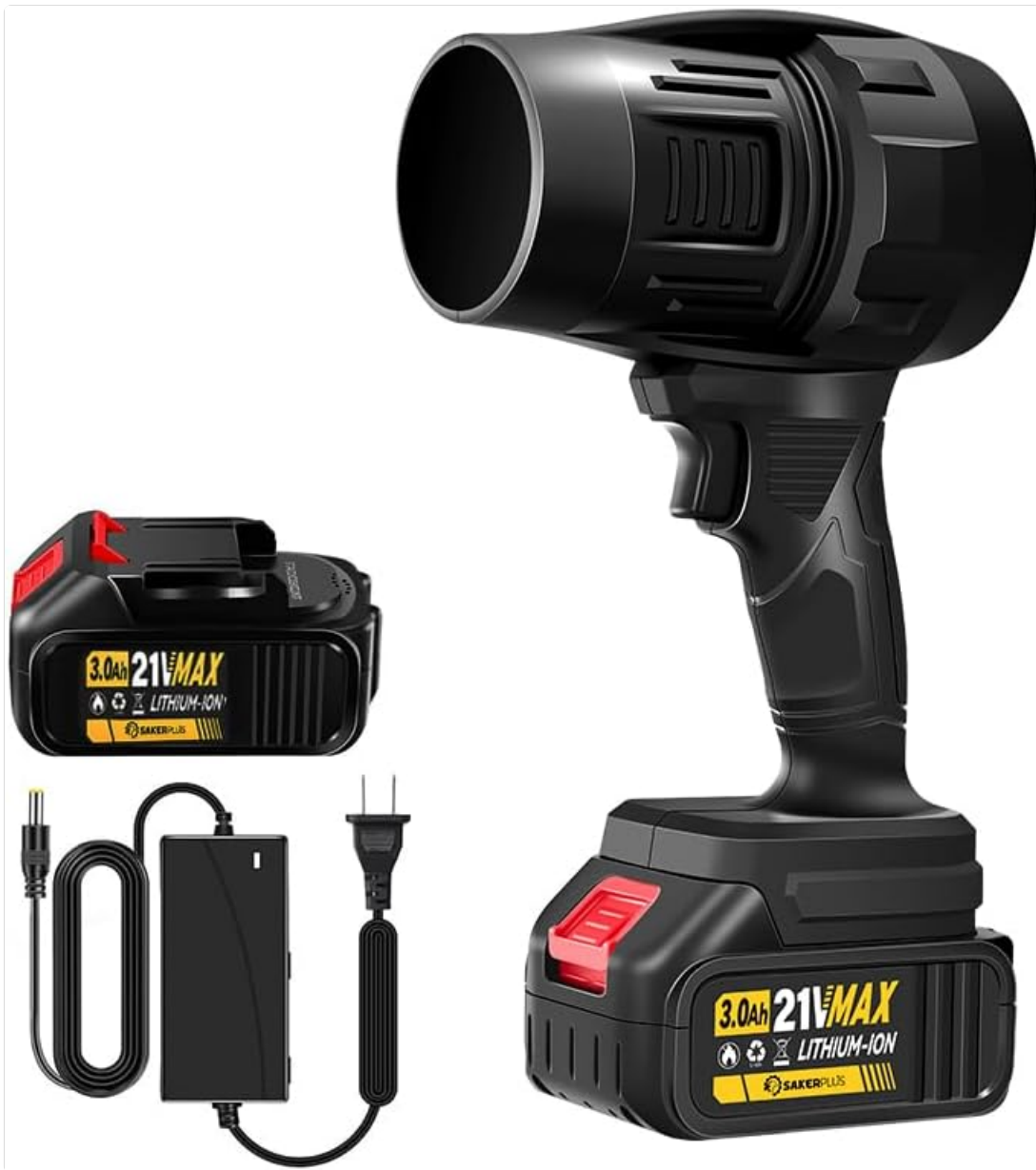
Figure 3.1: Contents included in the package.