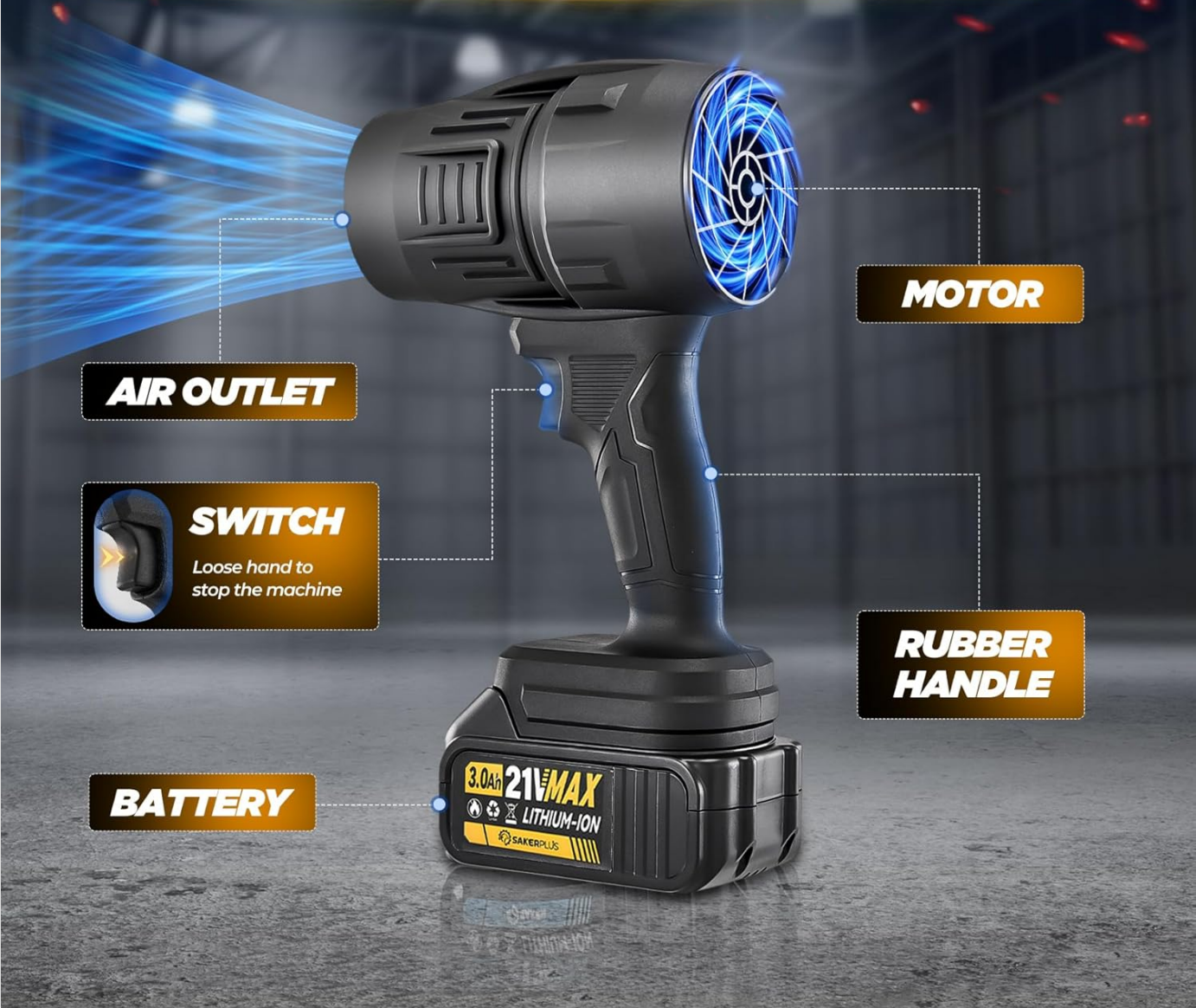
Figure 4.1: Key components of the Portable Air Duster.