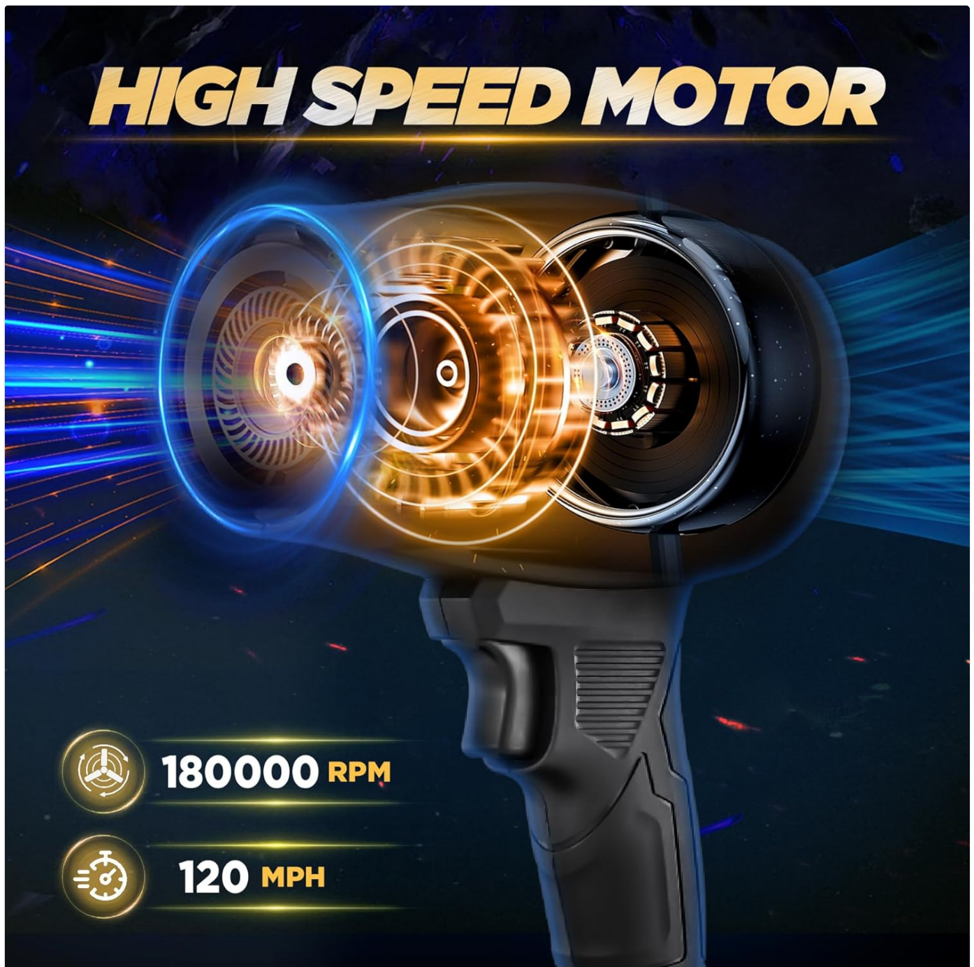
Figure 4.2: Internal view highlighting the high-speed motor performance.