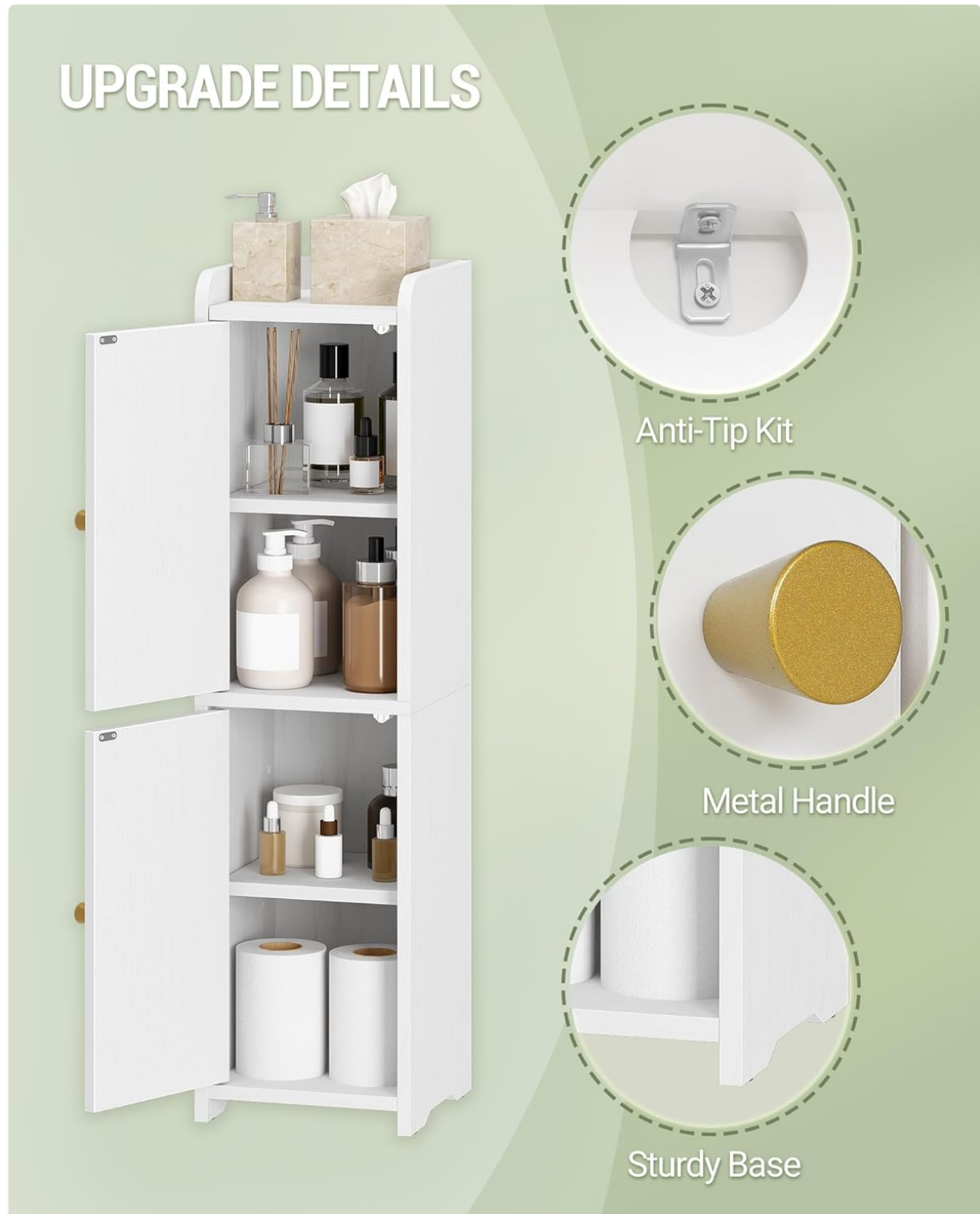
Image 5.2: The cabinet interior, showcasing its capacity to store bottles, rolled towels, and toilet paper.