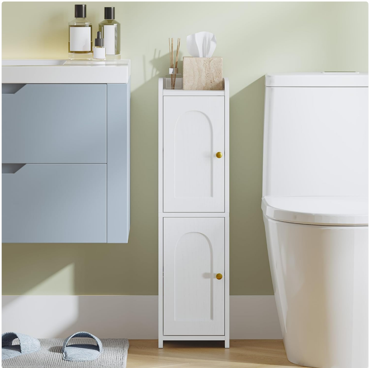
Image 1.1: The Hzueneri Bathroom Storage Cabinet BC49913X, a narrow white cabinet with two doors, positioned next to a toilet and sink.