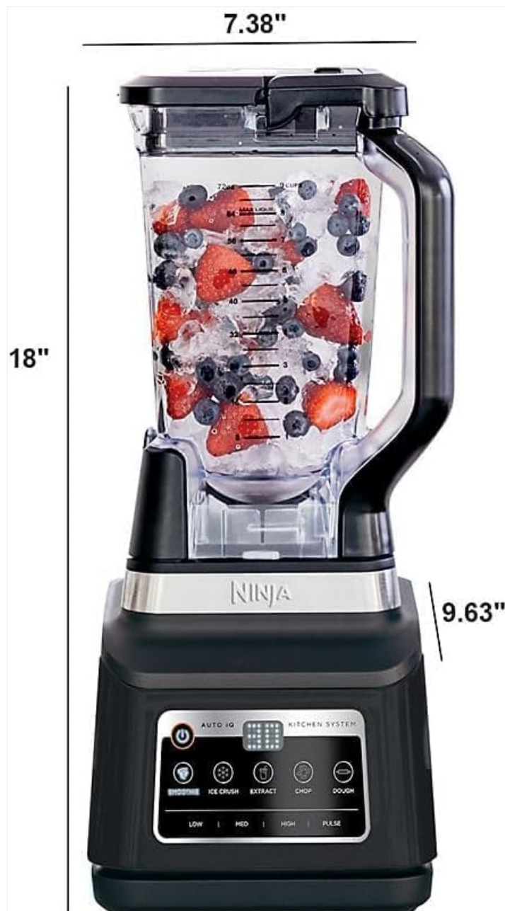
Figure 3.3: Side view of the Ninja Pro Plus Kitchen System blender pitcher with measurements indicating a height of 18 inches, a depth of 9.63 inches, and a width of 7.38 inches.