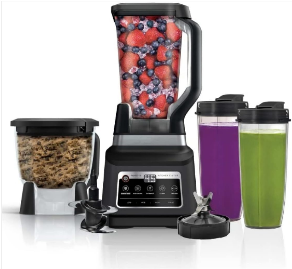
Figure 3.1: The Ninja Pro Plus Kitchen System showing the motor base, 72 oz. blender pitcher, 64 oz. food processor bowl, and two 32 oz. single-serve cups with lids.