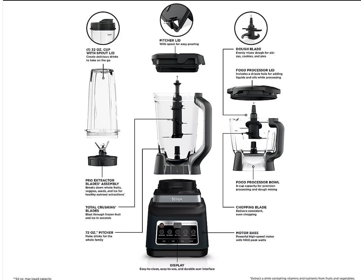
Figure 3.2: Exploded view diagram illustrating the various parts of the Ninja Pro Plus Kitchen System, including the motor base, 72 oz. pitcher with stacked blades, food processor bowl with chopping and dough blades, and 32 oz. single-serve cup with Pro Extractor Blades.