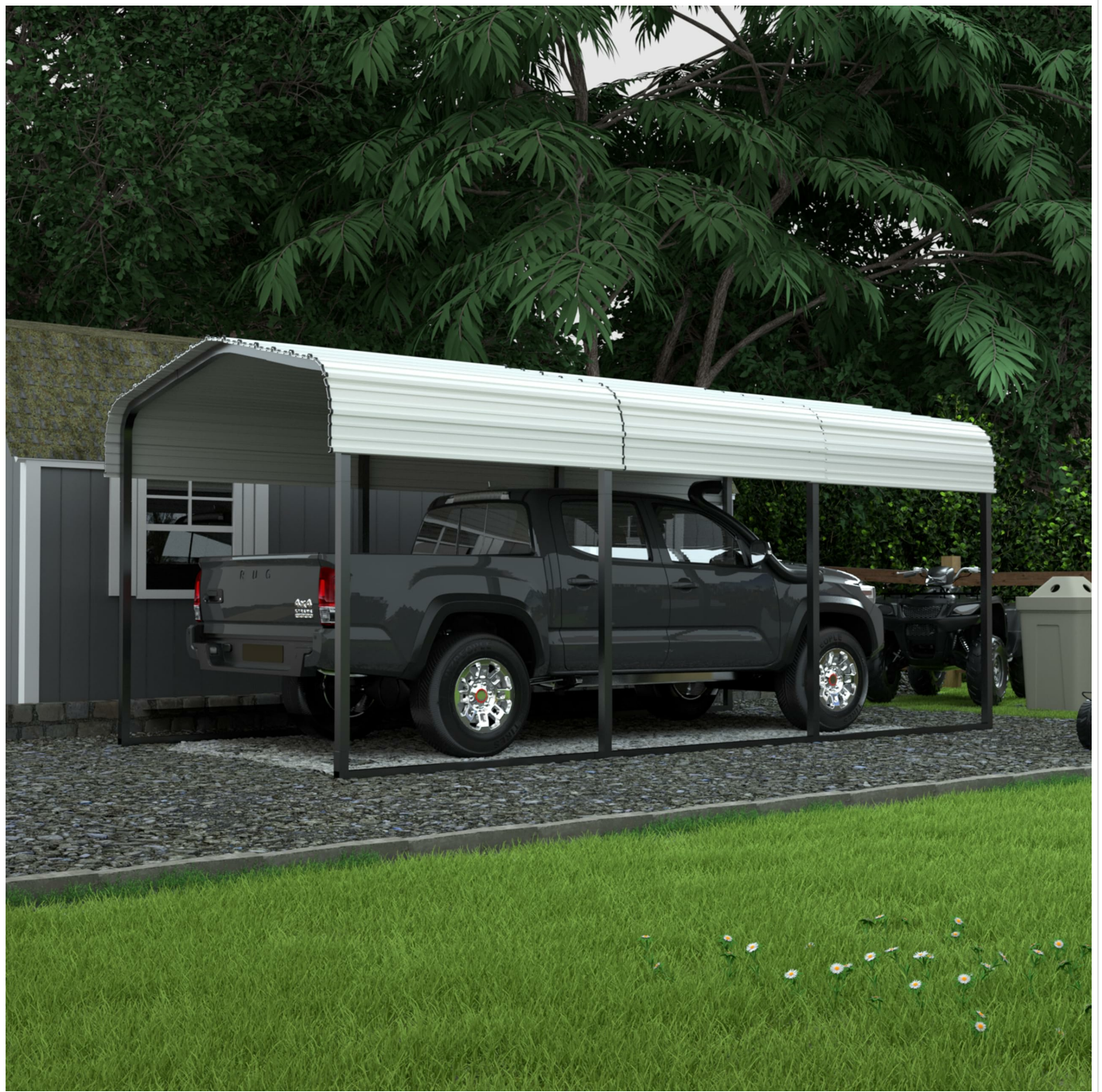
Image: The VEIKOU 10'x15' Metal Carport providing shelter for a black pickup truck on a gravel driveway.