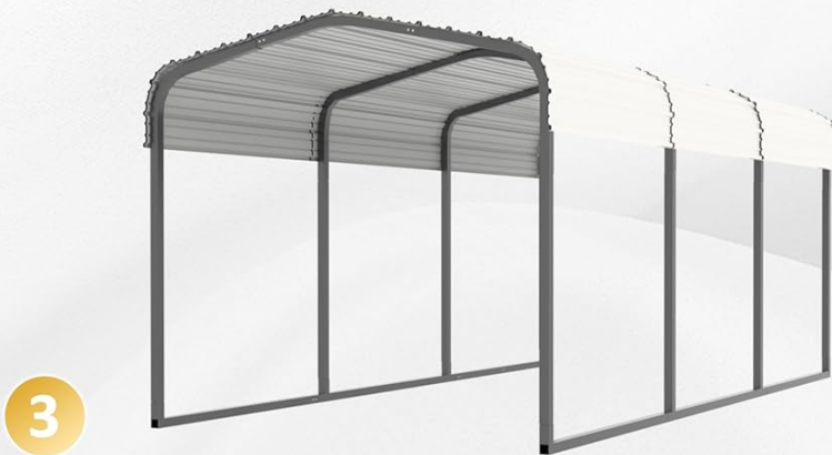
Image: Diagram illustrating the innovative adaptive-screw tube frame assembly method, designed to reduce installation time.