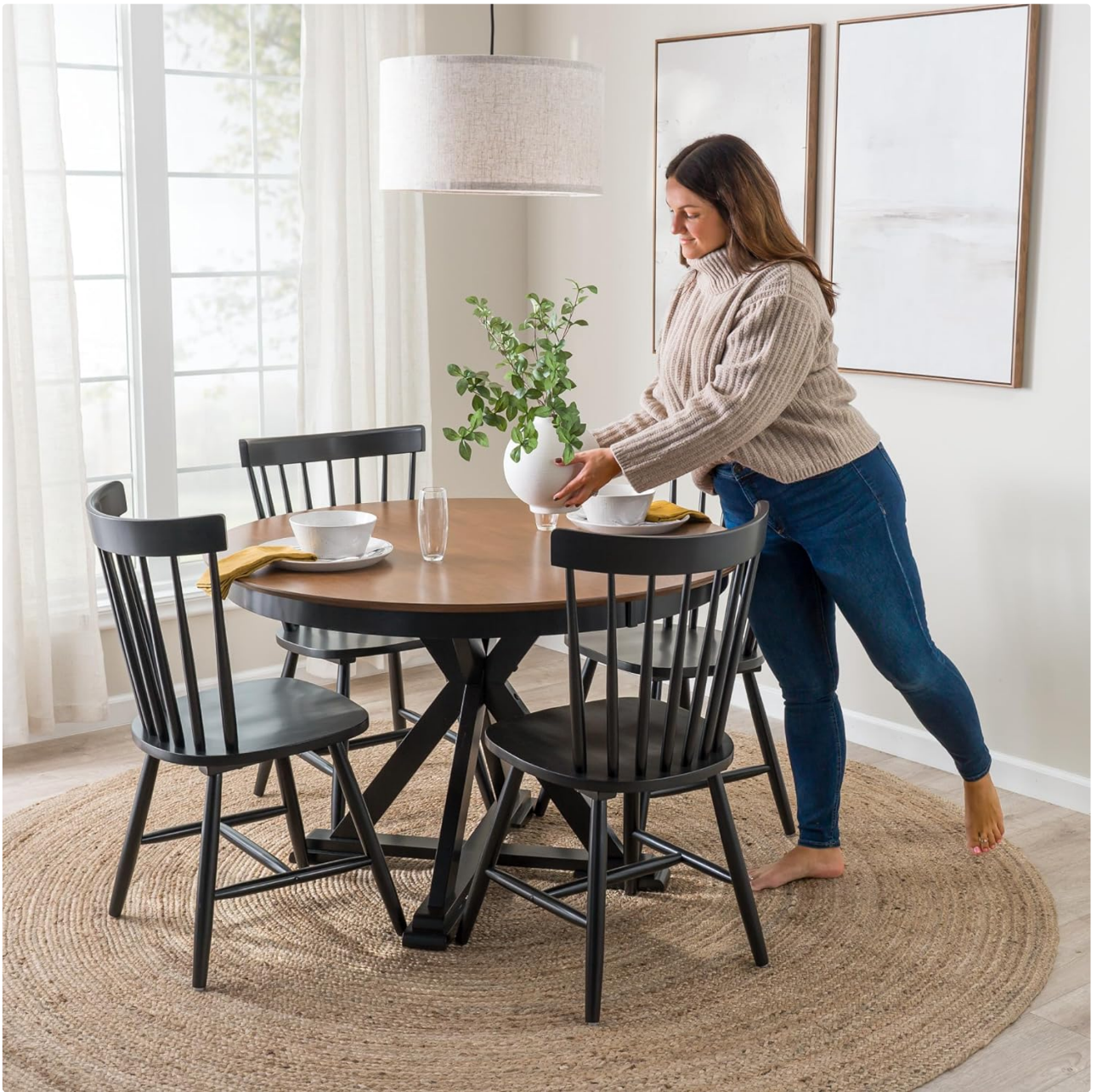
Figure 2: The dining set in a home setting, with a person arranging items on the table, illustrating scale and use.