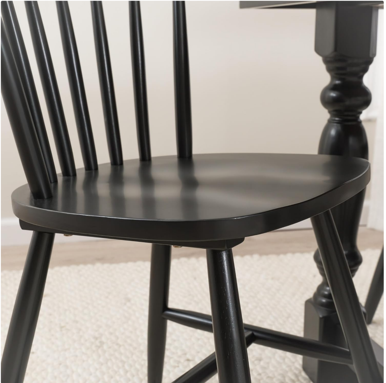
Figure 4: Close-up of a dining chair, highlighting the contoured seat and high spindle back design.