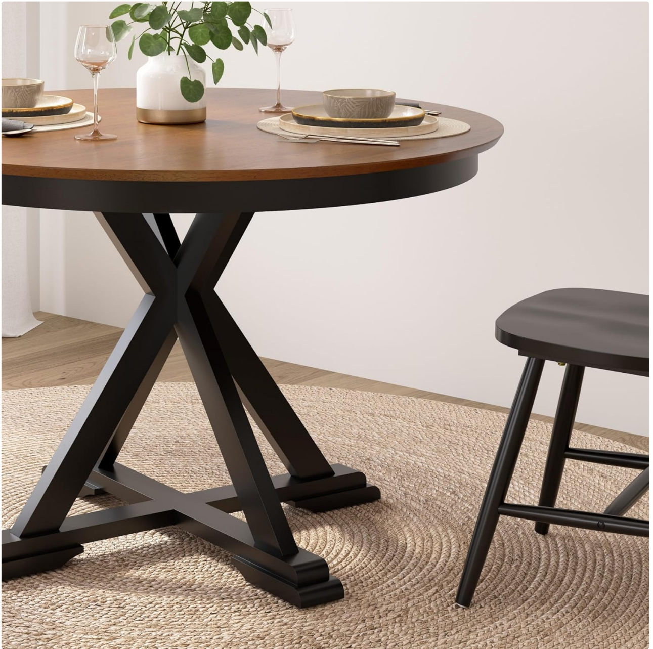
Figure 3: Detailed view of the table's sturdy trestle base and the design of a dining chair.