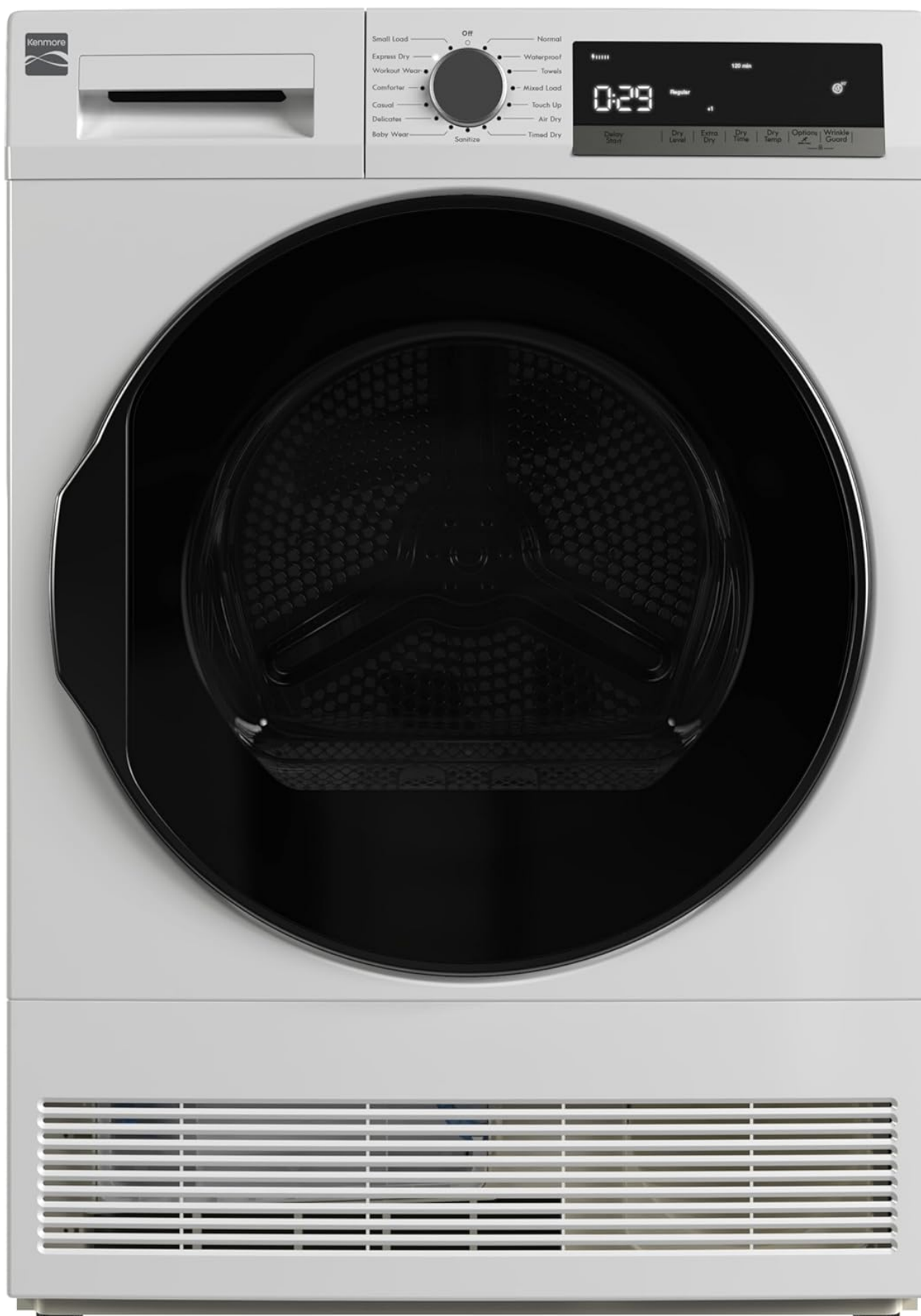
Front view of the Kenmore 4.0 cu. ft. Ventless Compact Front Load Electric Dryer.