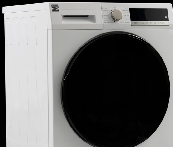
Overview of drying cycles and features.