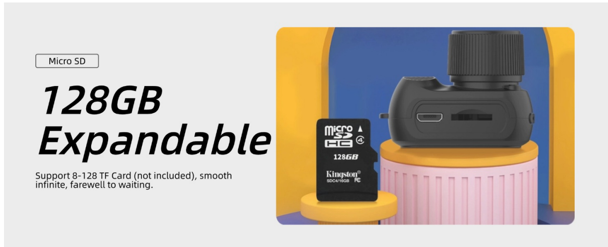
Image: A visual representation of inserting a Micro SD card into the camera's slot.