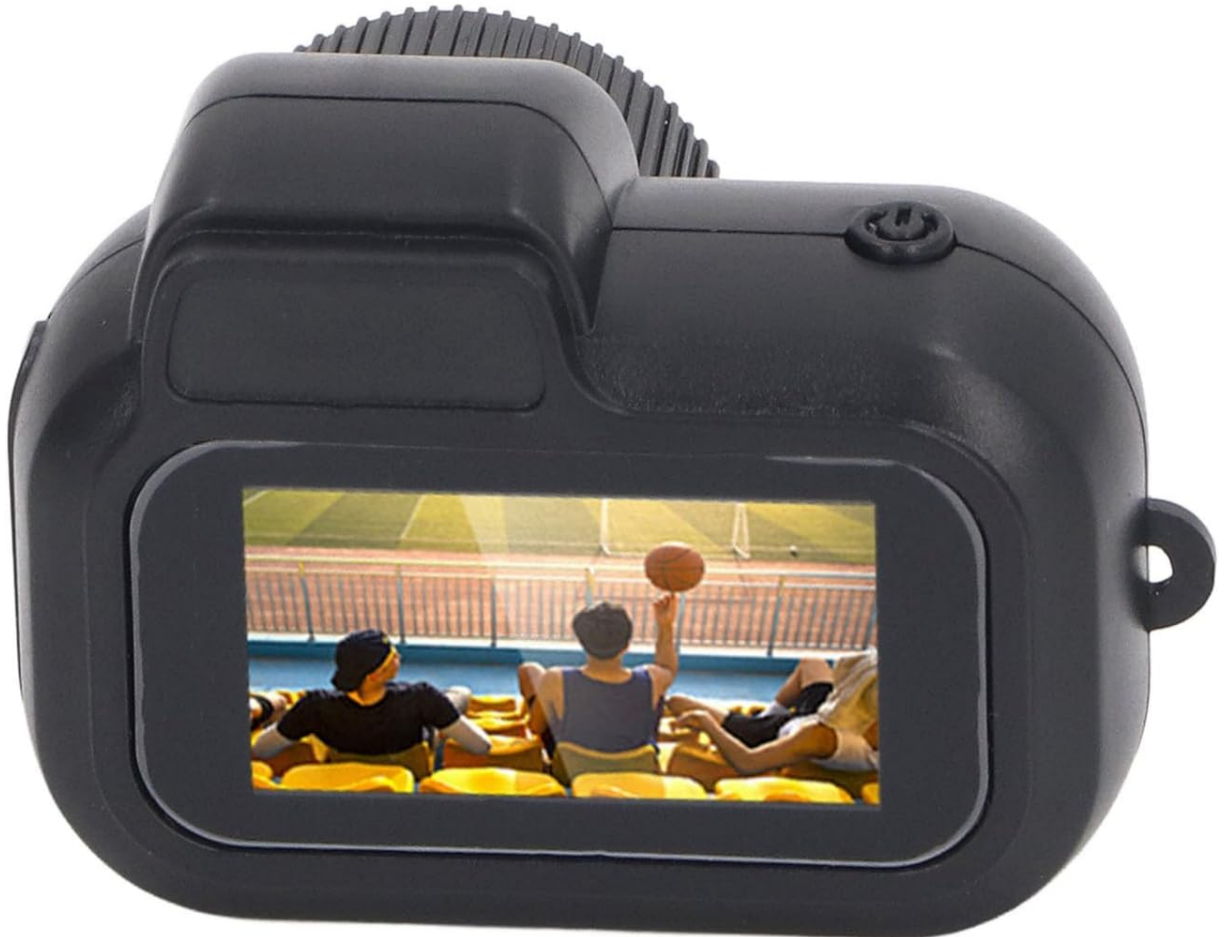
Image: Top view of the camera, highlighting the power button.