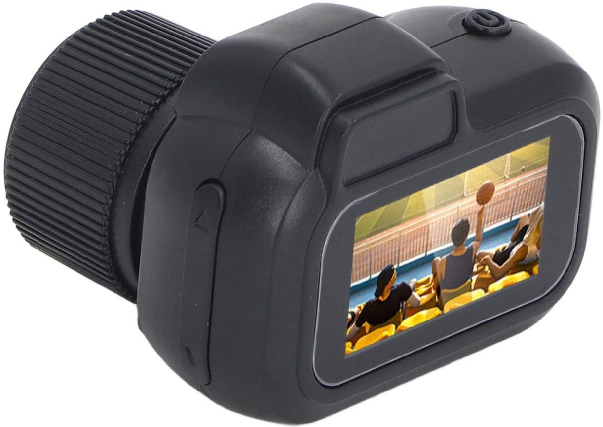
Image: Side view of the camera, showing the control buttons.