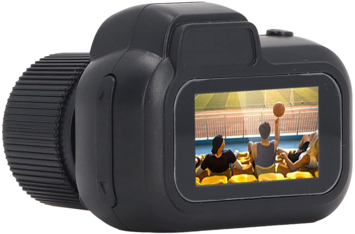
Image: Front view of the camera, showing the lens and screen.