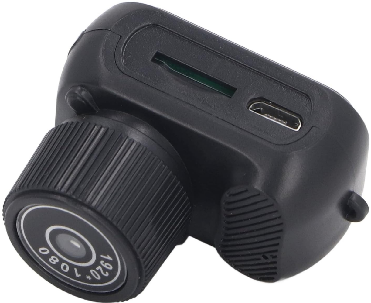
Image: Bottom view of the camera, revealing the Micro USB port and TF card slot.