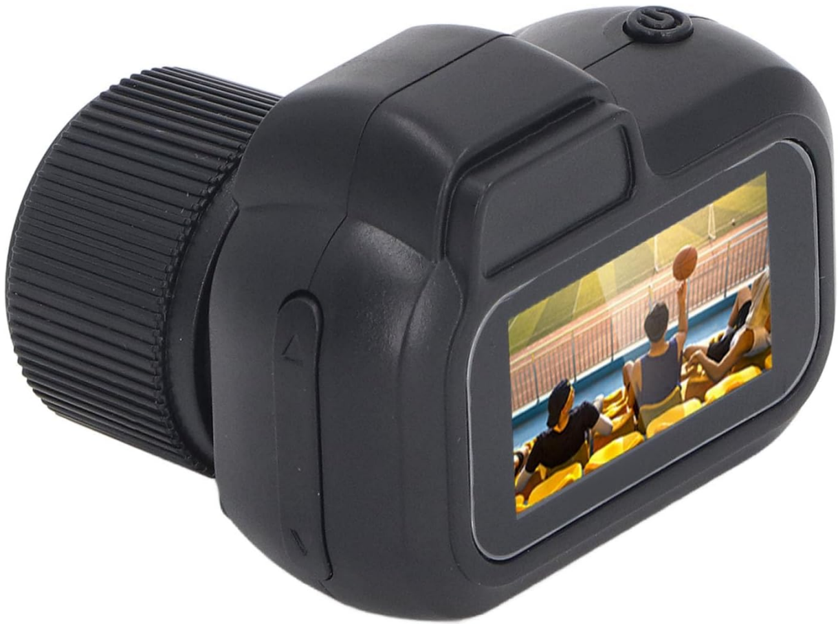
Image: The Yechiry Keychain Camera, along with its included wrist strap, charging cable, and keychain.