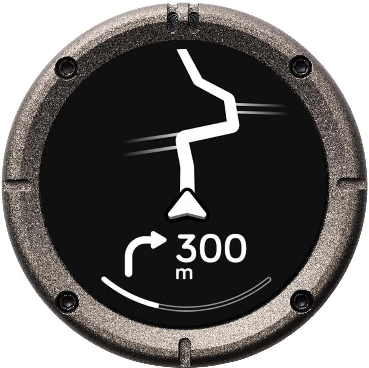
The Beeline Moto II device displaying a turn-by-turn navigation route.